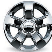
20" Chrome-Aluminum (Available on LTZ)