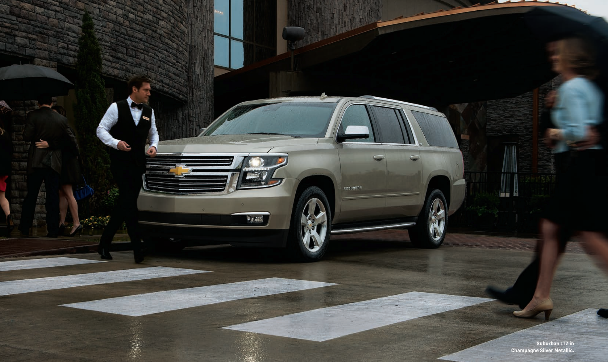
Suburban LTZ in Champagne Silver Metallic.

PREMIUM ATTITUDE. Suburban makes a striking design statement. The crisp profile and athletic stance contribute to this commanding presence.