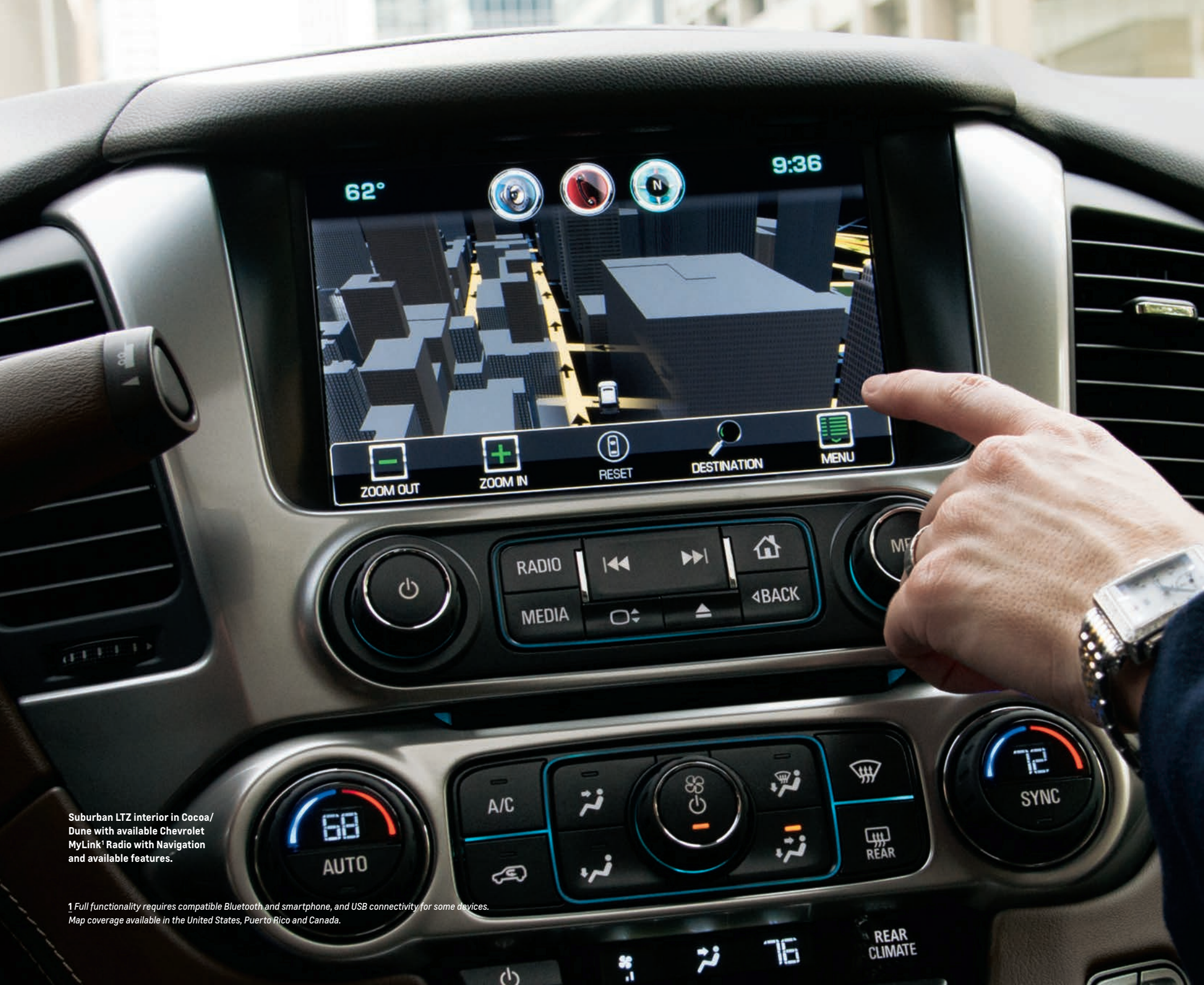
Suburban LTZ interior in Cocoa/ Dune with available Chevrolet MyLink 1 Radio with Navigation and available features.