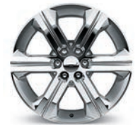
22" Chrome-Aluminum (Available on LT and LTZ)