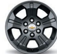
18" Painted-Aluminum (Available on LT; requires Z71 Off-Road Package)