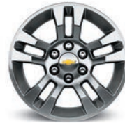
18" Aluminum with High-Polished Finish (Standard on LS and LT)