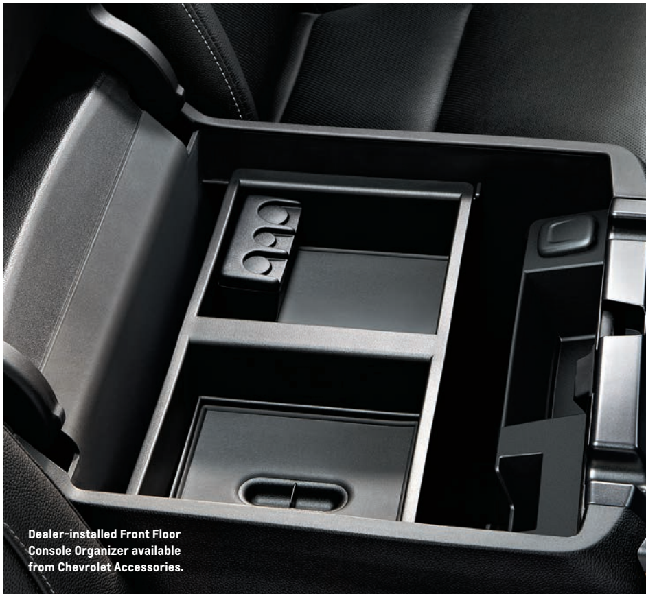
Dealer-installed Front Floor Console Organizer available from Chevrolet Accessories.