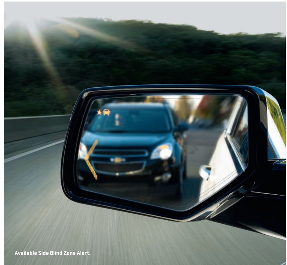
Available Side Blind Zone Alert.