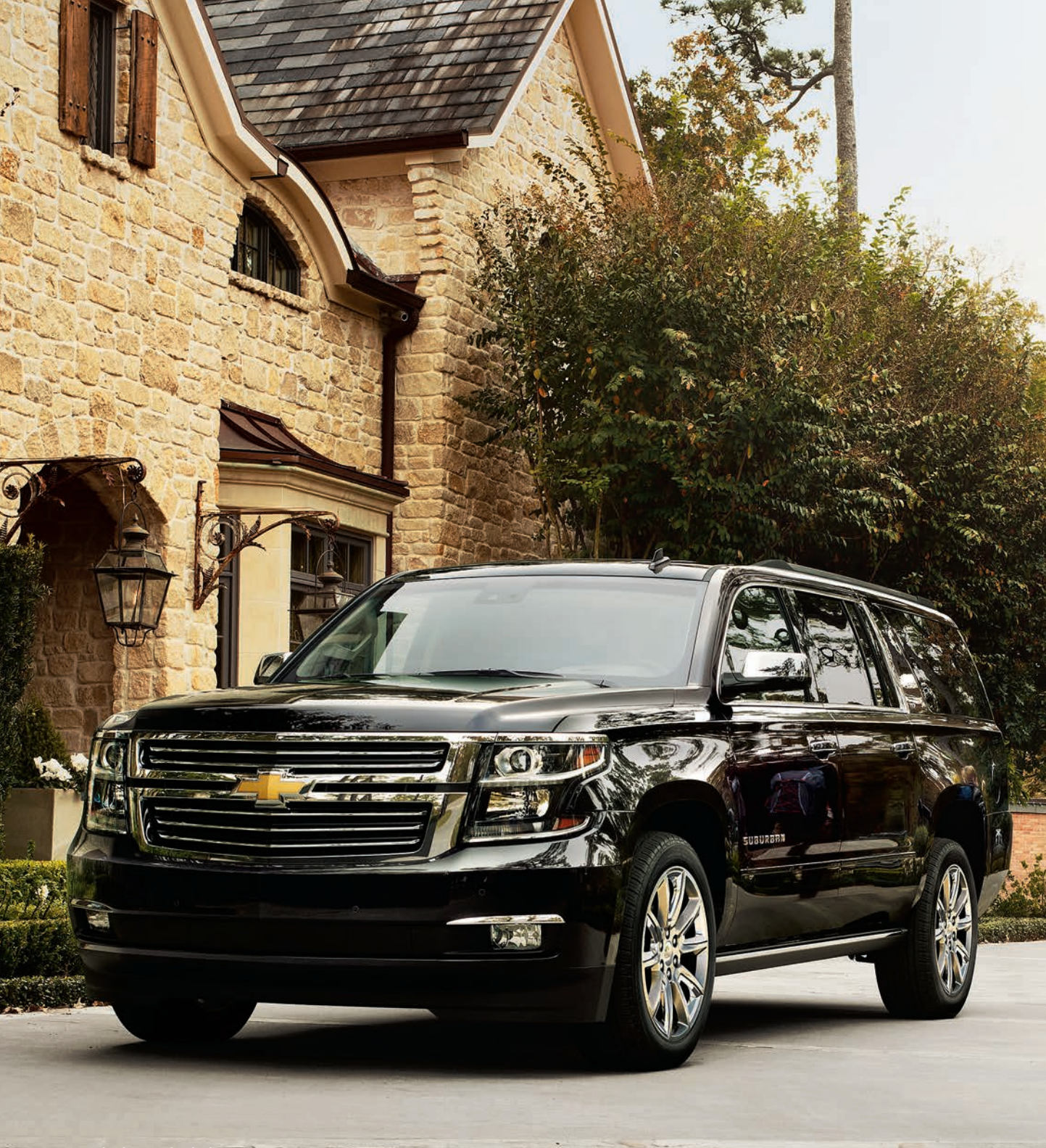
Suburban LTZ in Black with available features.