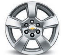
20" Polished-Aluminum (Standard on LTZ; available on LS and LT)