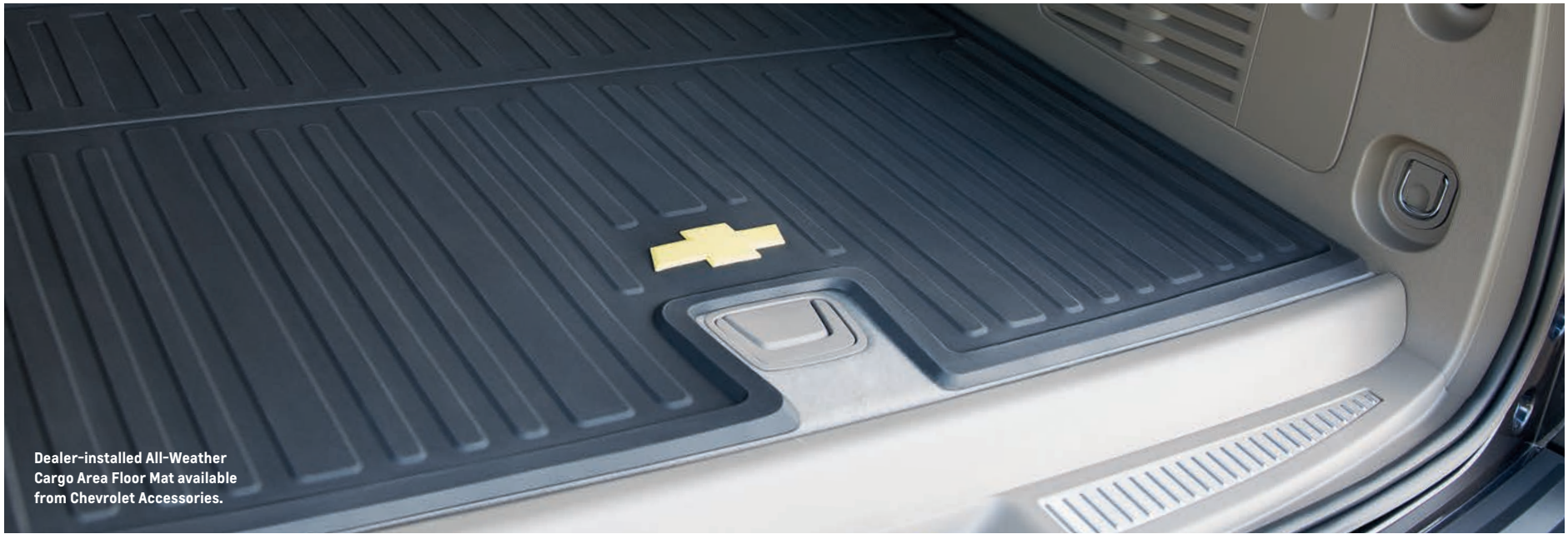
Dealer-installed All-Weather Cargo Area Floor Mat available from Chevrolet Accessories.