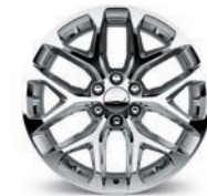
22" Chrome-Aluminum Multi-Featured Design (Available on LT and LTZ)