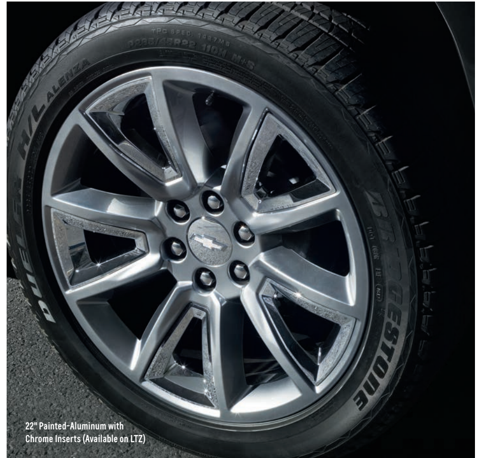
22" Painted-Aluminum with Chrome Inserts (Available on LTZ)