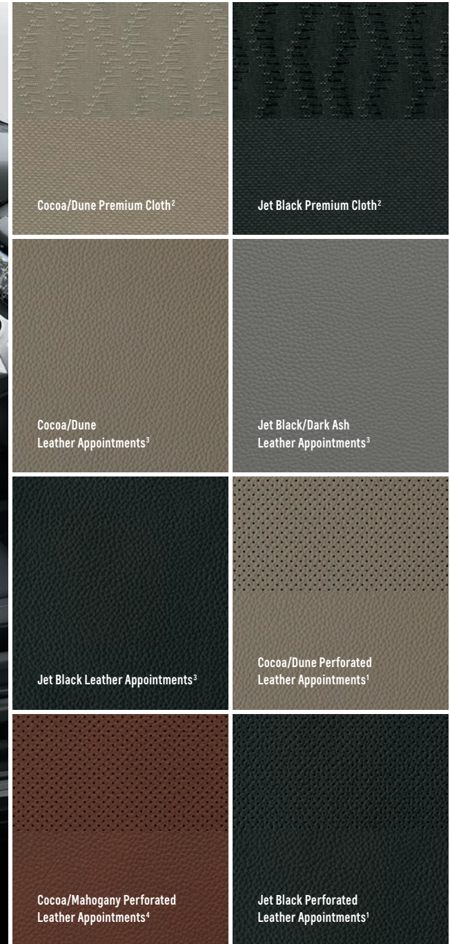
Jet Black Perforated Leather Appointments 1