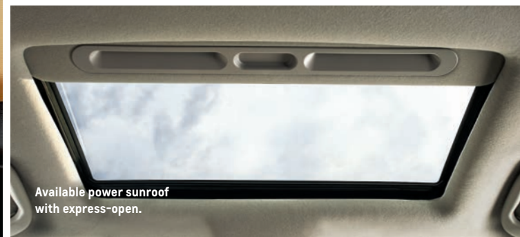
Available power sunroof with express-open.