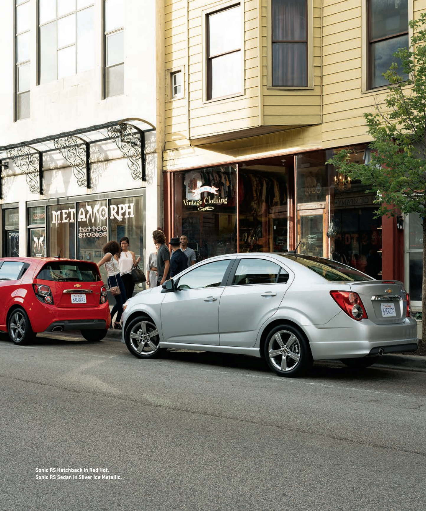
Sonic RS Hatchback in Red Hot. Sonic RS Sedan in Silver Ice Metallic.