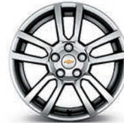
16" Silver-Painted Aluminum (Available on LT 8 )