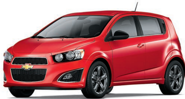
RED HOT 1