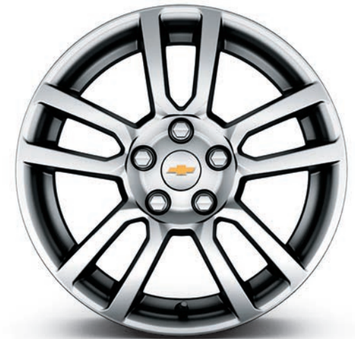
16" Silver-painted wheels available with select packages.