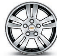
15" Painted-Aluminum (Standard on LT)