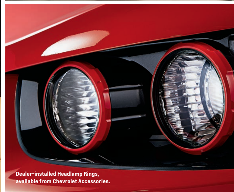
Dealer-installed Headlamp Rings, available from Chevrolet Accessories.