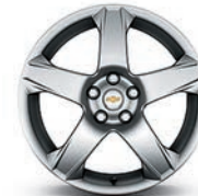
17" Painted-Aluminum (Standard on LTZ)