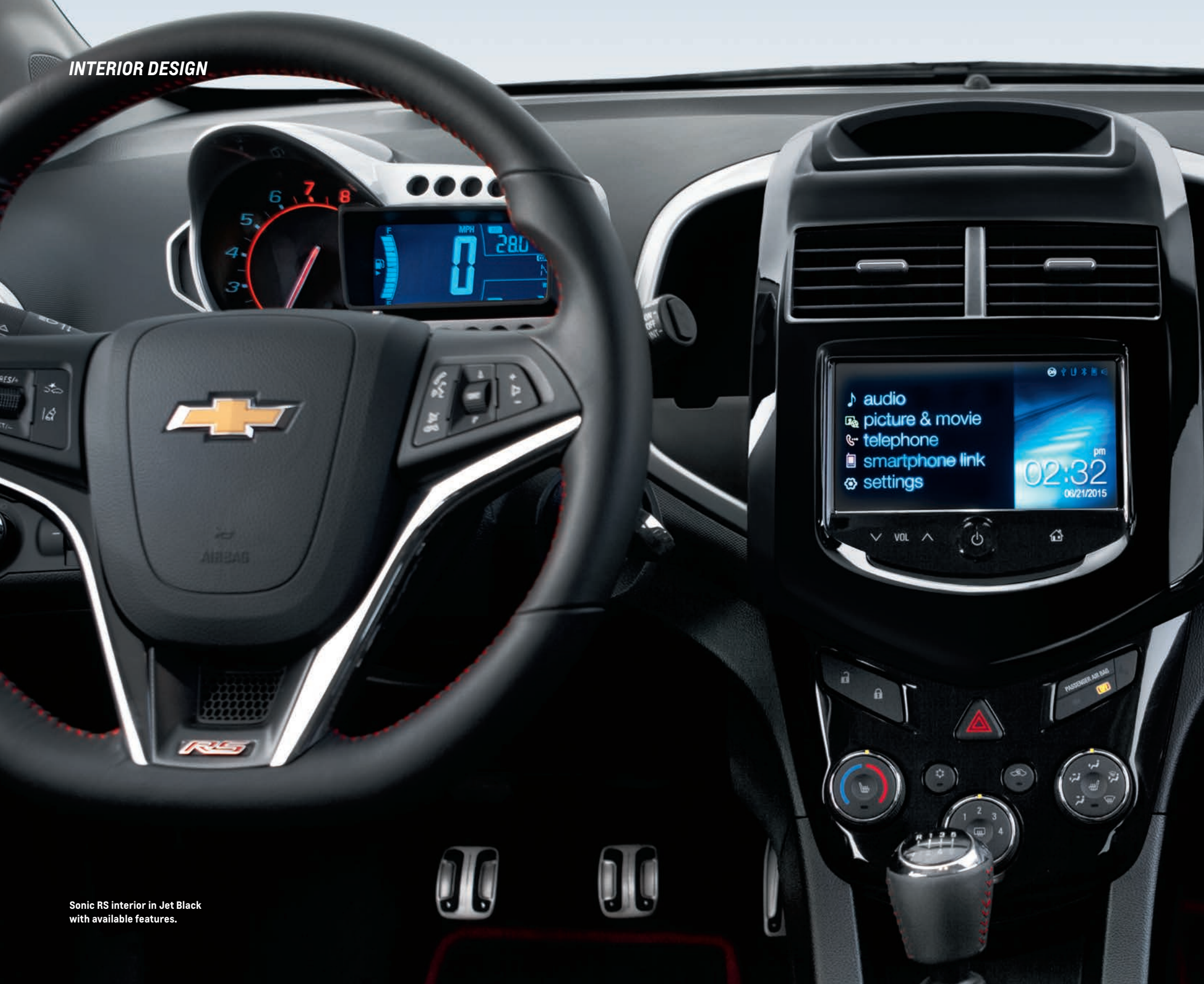
Sonic RS interior in Jet Black with available features.