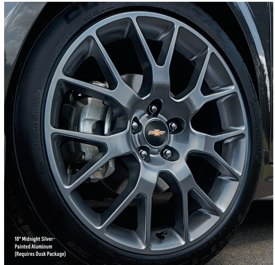
18" Midnight Silver-Painted Aluminum (Requires Dusk Package)