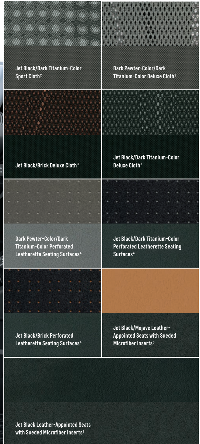
Jet Black Leather-Appointed Seats with Sueded Microfiber Inserts 1