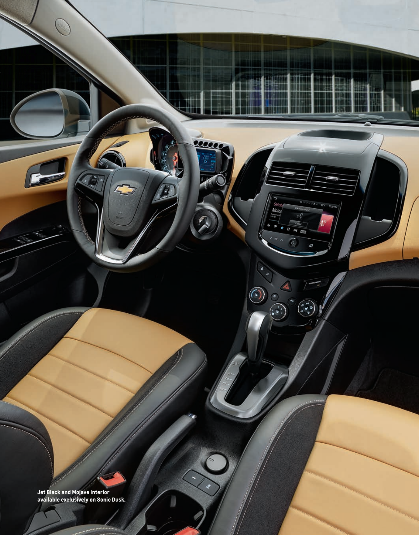
Jet Black and Mojave interior available exclusively on Sonic Dusk.