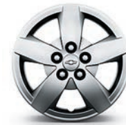
15" Steel with Bolt-On Wheel Cover (Standard on LS)