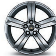
17" Midnight Silver-Painted Aluminum (Standard on RS)