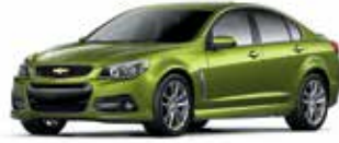
JUNGLE GREEN METALLIC