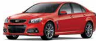
RED HOT 2