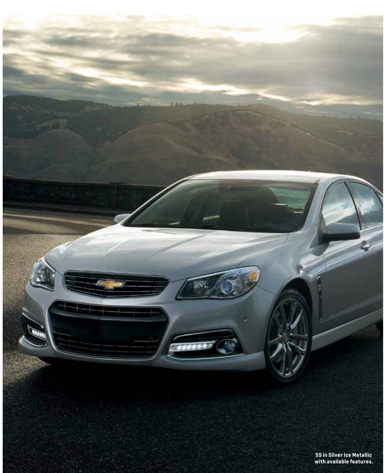
SS in Silver Ice Metallic with available features.

1 Do not use summer-only tires in winter conditions, as it would adversely affect vehicle safety, performance and durability. Use only GM-approved tire and wheel combinations. Unapproved combinations may change the vehicle's performance characteristics. For important tire and wheel information, go to gmaccessorieszone.com or see your dealer.