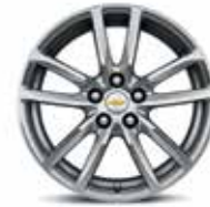
19" Polished Forged-Aluminum 1 (Standard)