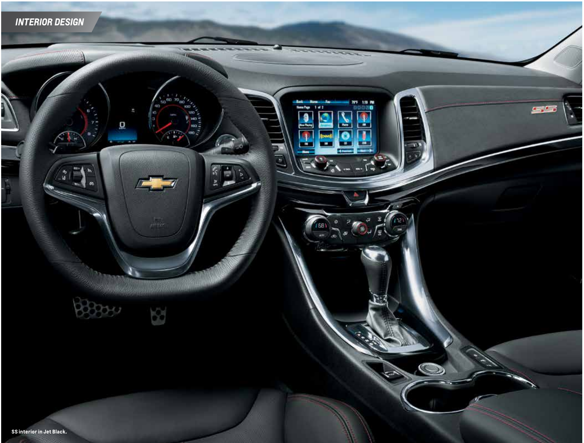
SS interior in Jet Black.