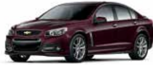
ALCHEMY PURPLE METALLIC