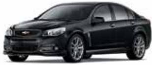
PHANTOM BLACK METALLIC