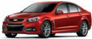
SOME LIKE IT HOT RED METALLIC