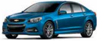
PERFECT BLUE METALLIC