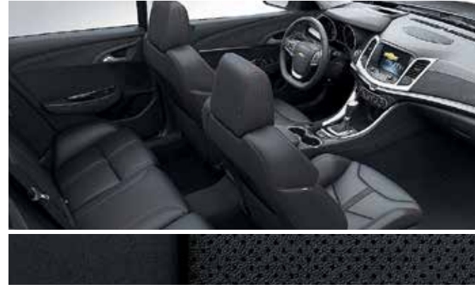
Jet Black Leather Appointments with Red Accent Stitching