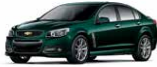
REGAL PEACOCK GREEN METALLIC