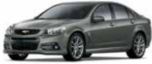
MYSTIC GREEN METALLIC