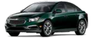
RAINFORREST GREEN METALLIC 1,3