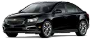
BLACK GRANITE METALLIC 1