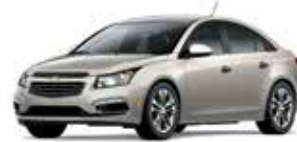
CHAMPAGNE SILVER METALLIC 3