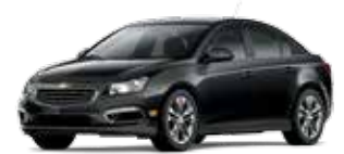
TUNGSTEN METALLIC 3