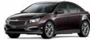
AUTUMN BRONZE METALLIC 1,3,4