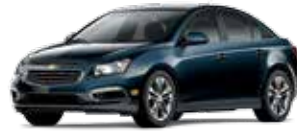
BLUE RAY METALLIC 2