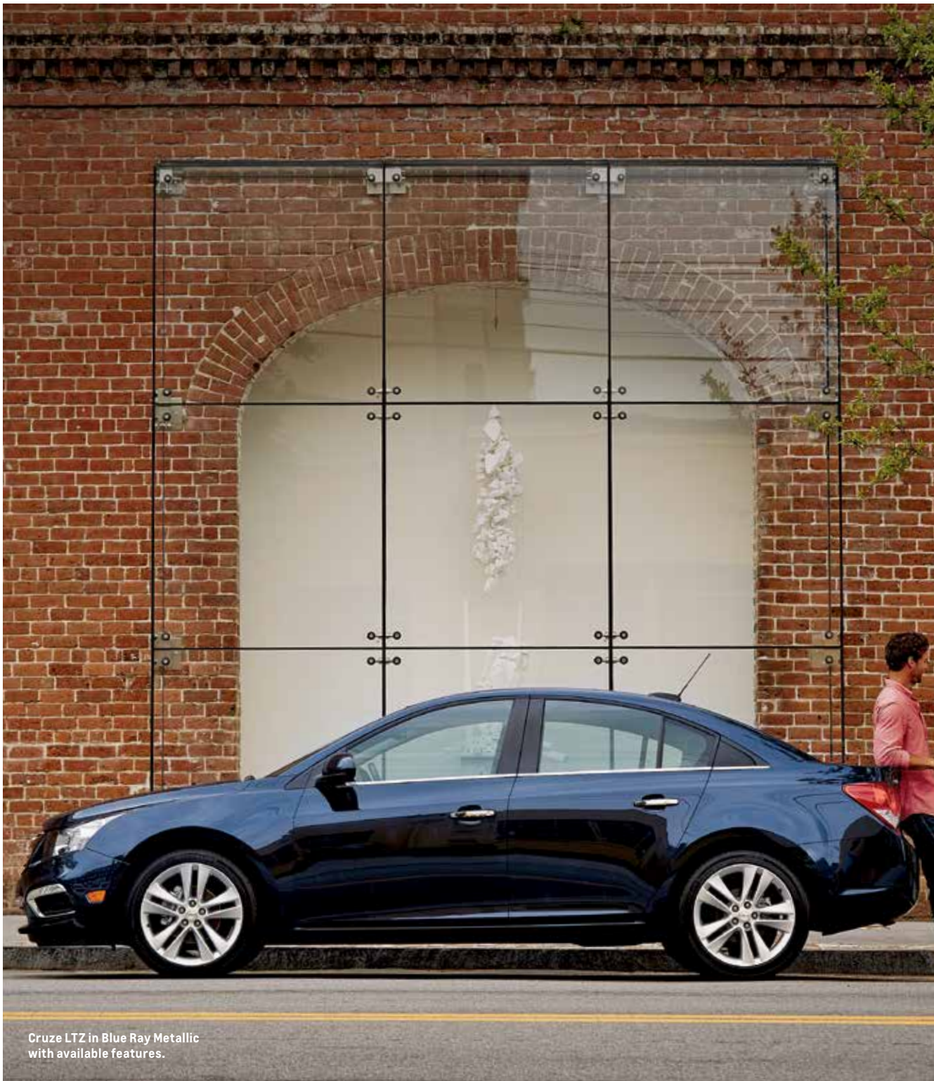
Cruze LTZ in Blue Ray Metallic with available features.