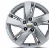
17" Aluminum (Standard on Diesel)