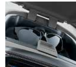
Convenient in-dash storage area.