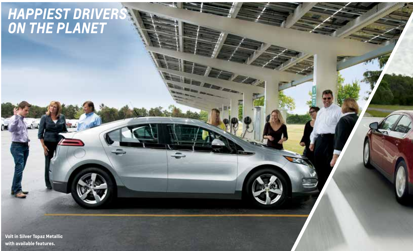
Volt in Silver Topaz Metallic with available features.