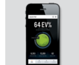
Chevrolet Volt Driver Challenge mobile app (VoltDC) 7

CHEVROLET MYLINK 1 The 7-inch diagonal color display touch-screen of Chevrolet MyLink 1 Radio is your direct source to an array of entertainment options. Use touch controls or voice commands to access Pandora ® Internet Radio 2 and Stitcher SmartRadio. ™2 Enjoy commercial-free music with SiriusXM Satellite Radio. 3 Organize your music library with Gracenote. ® With the available navigation system, easily plan and navigate trips. You can also keep track of real-time traffic reports with three trial months of available SiriusXM NavTraffic. 3 Volt also comes with Turn-by-Turn Navigation, which enables you to download directions from MapQuest ® through eNAV, standard for three years with the OnStar ®4 Directions & Connections ® Plan.