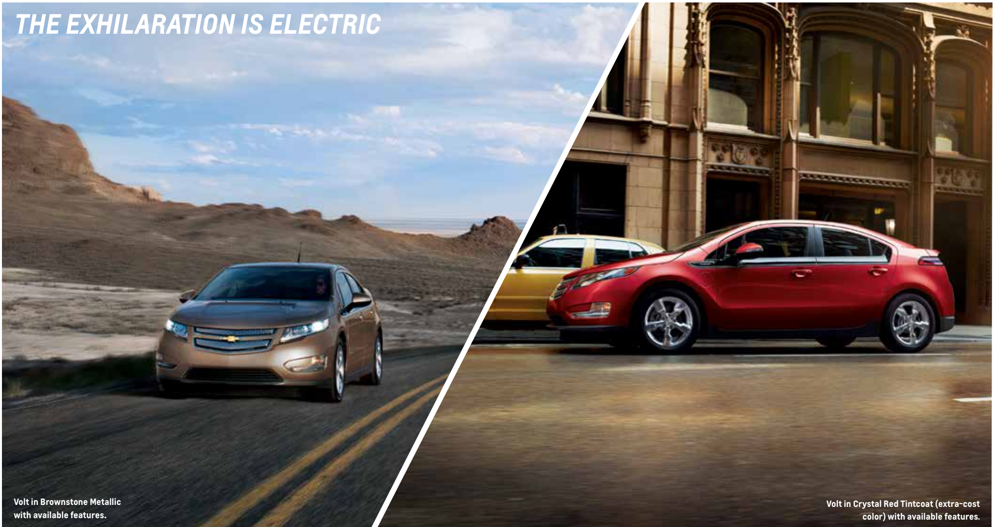
Volt in Brownstone Metallic with available features.