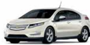
WHITE DIAMOND TRICOAT 1