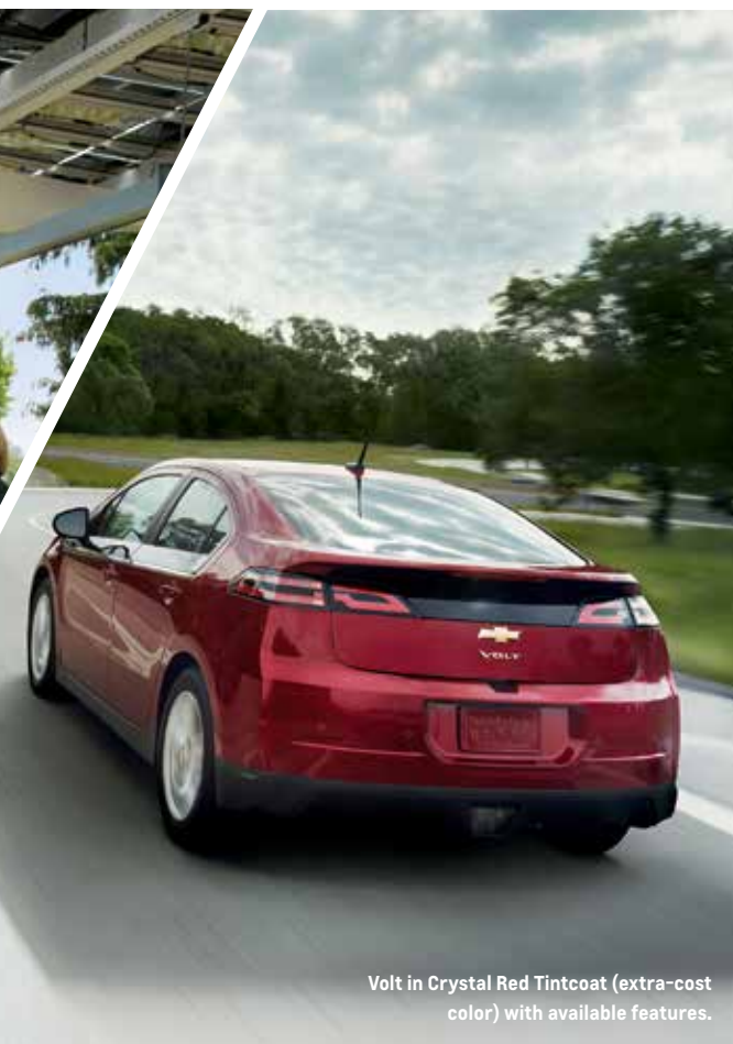
Volt in Crystal Red Tintcoat (extra-cost color) with available features.

There are miles of reasons why Volt owners quickly become Volt enthusiasts. By charging regularly, they are averaging about 900 miles between fill-ups! What's not to love?