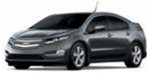
ASHEN GRAY METALLIC