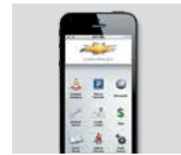
myChevrolet 5 mobile app.