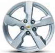
17" Painted-Aluminum (Standard)