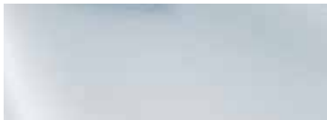
Ceramic White Accompanies Available Jet Black Leather Appointments with Ceramic White Accents