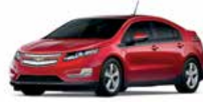
CRYSTAL RED TINTCOAT 1