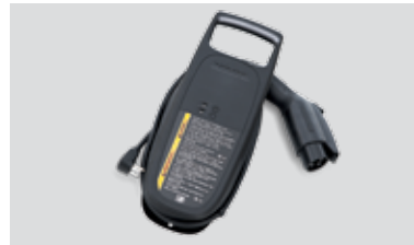
Extra Battery Charging Cable