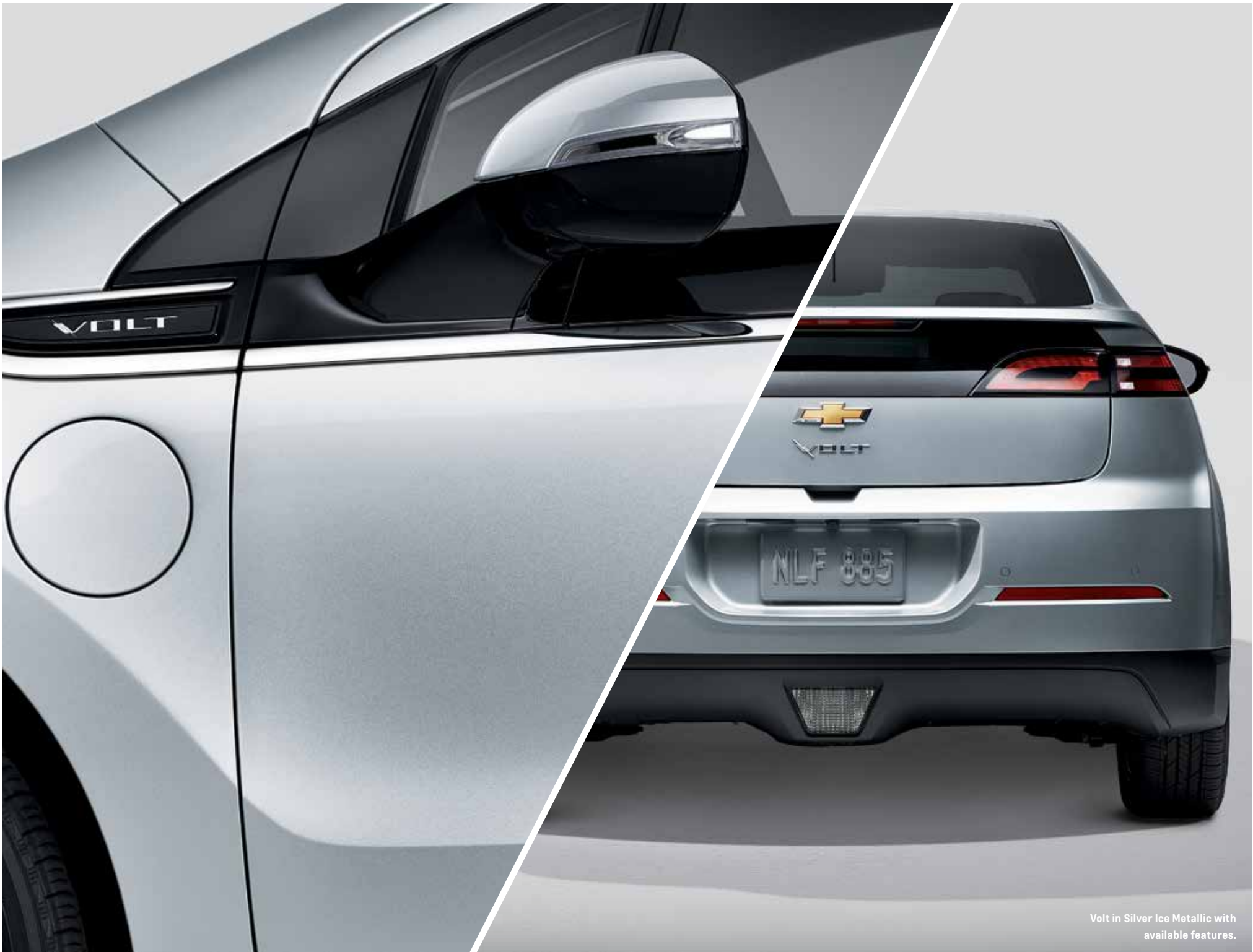
Volt in Silver Ice Metallic with available features.