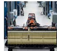
Uncovered look at the 288-cell lithium-ion battery pack.