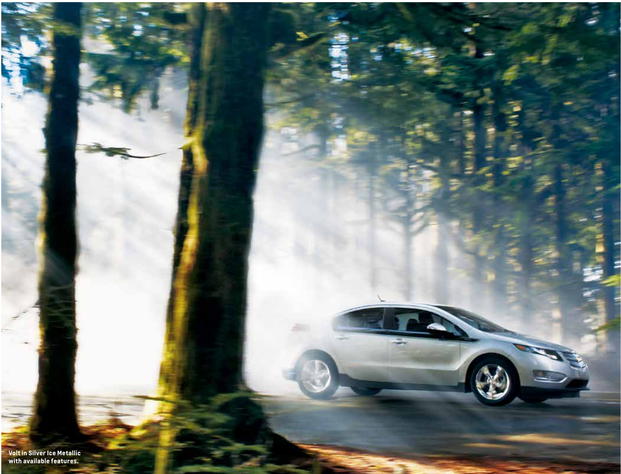
Volt in Silver Ice Metallic with available features.