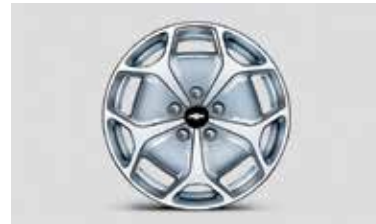
Painted Wheel Inserts (Available in two colors: Cyber Gray Metallic and Silver Ice Metallic – shown)