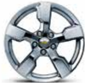
17" Polished-Aluminum (Available)