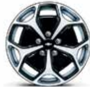
17" Sport Alloy with Black Inserts (Available)