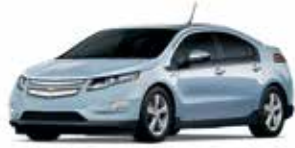
SILVER TOPAZ METALLIC