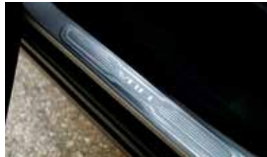
Door Sill Plate