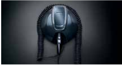
Available 240-Volt Fast-Charging Station.

The Chevrolet home charging provider, Bosch, ® offers Volt owners a one-stop shopping experience for a variety of charging stations and installation options, as well as information on special programs and incentives. Visit pluginnow.com/go/volt or call 877-805-EVSE (3873) for more information.