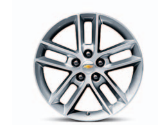
18" Machined-Face Aluminum Wheel (standard on LTZ)