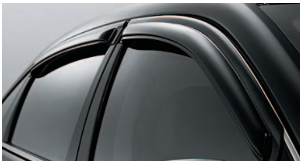
Side Window Weather Deflectors