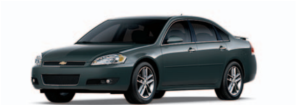
Ashen Gray Metallic