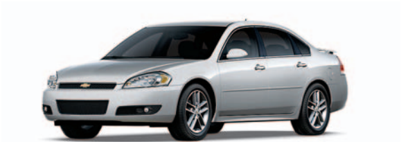
Silver Ice Metallic 3