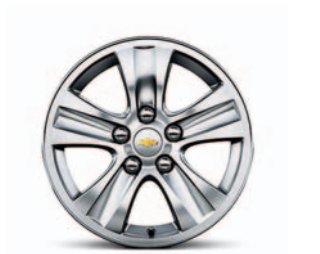
16" Aluminum Wheel (standard on LS)