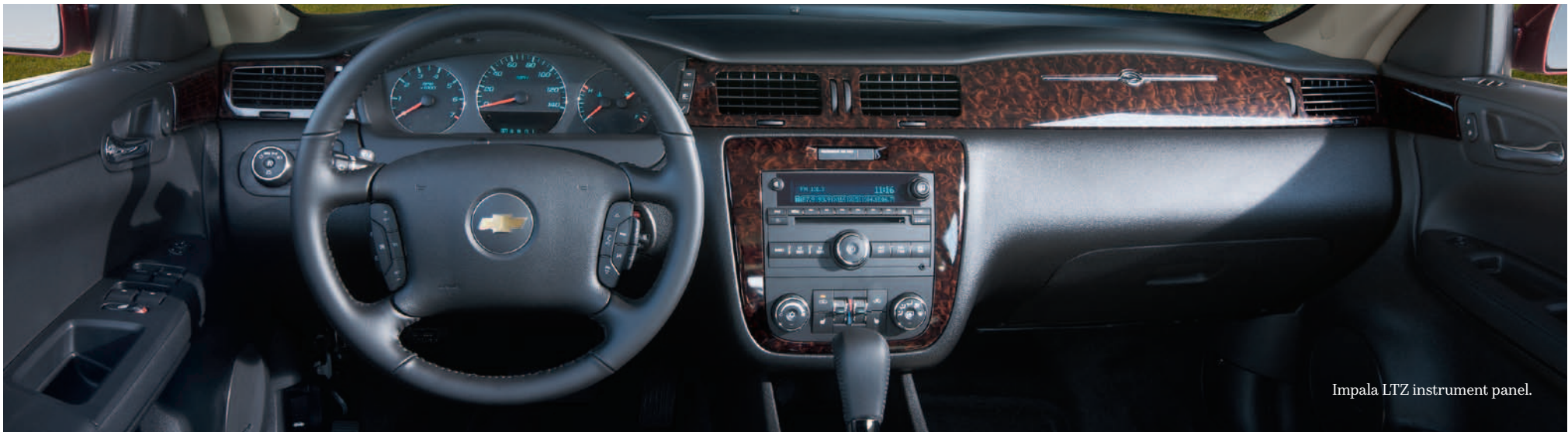
Impala LTZ instrument panel.