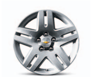
17" Machined-Aluminum Wheel (standard on LT)