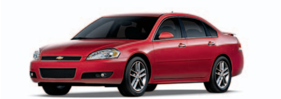
Crystal Red Tintcoat 1,2