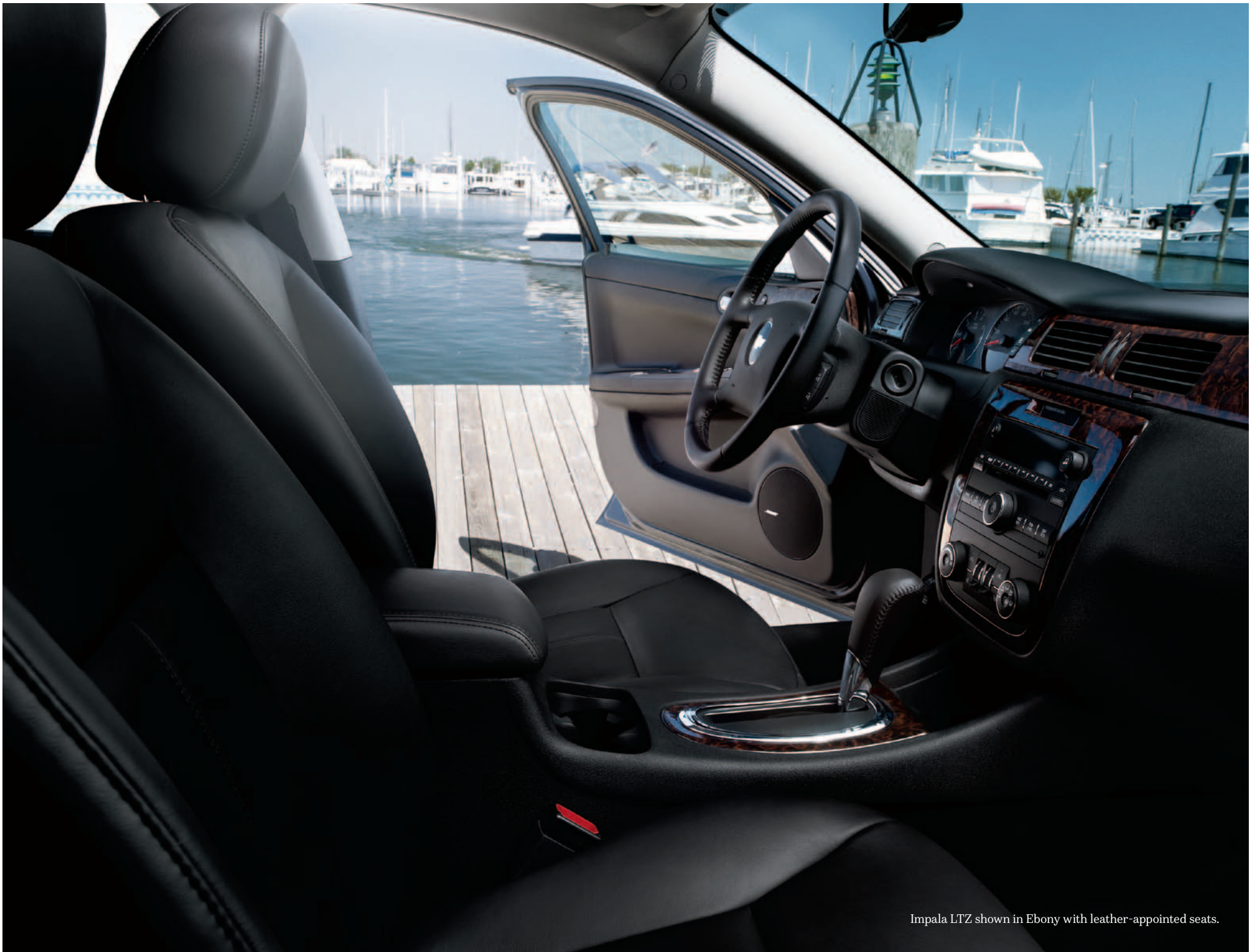
Impala LTZ shown in Ebony with leather-appointed seats.