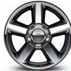
20" Chrome Aluminum Wheel 8