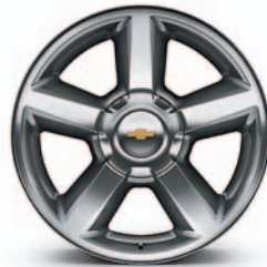
20" Polished-Aluminum Wheel 7