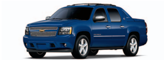
Blue Topaz Metallic 1