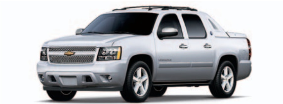
Silver Ice Metallic