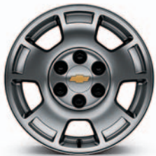
17" Aluminum Wheel with Rectangular Pockets 4,5