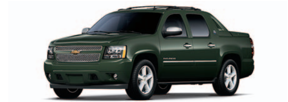
Fairway Metallic 2