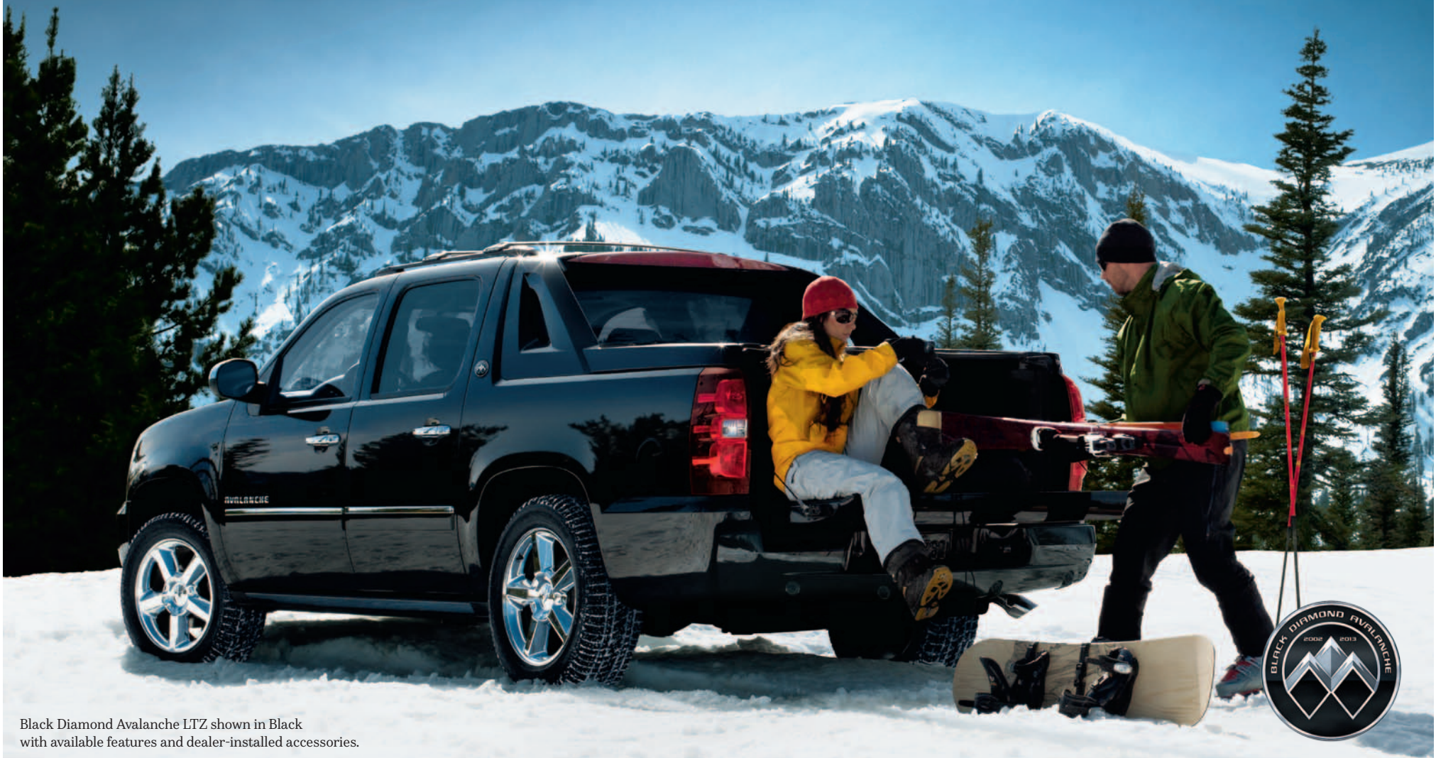
Black Diamond Avalanche LTZ shown in Black with available features and dealer-installed accessories.

In addition to exclusive Black Diamond badging, the 2013 Avalanche has gained ground with upscale standard appointments such as a remote vehicle starter system, body-color exterior components, a rear vision camera, Rear Park Assist, foglamps and power-adjustable pedals. This Black Diamond Avalanche is a fitting tribute to Avalanche, whose 12-year production comes to an end this year, commemorating the best and last of its kind.