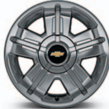
18" Aluminum Wheel 6