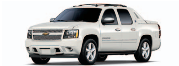
White Diamond Tricoat 1,2,3