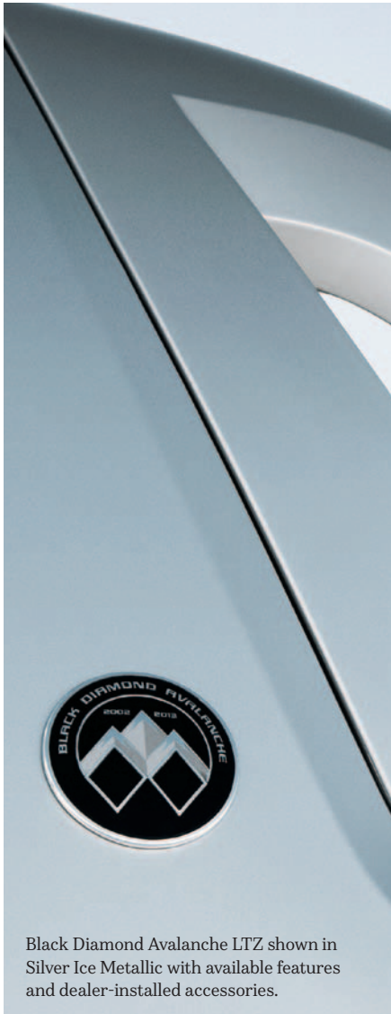
Black Diamond Avalanche LTZ shown in Silver Ice Metallic with available features and dealer-installed accessories.

The latest technology goes along for the ride too. SiriusXM Satellite Radio 2 with NavTraffic 2,3 is available for a three-month trial and provides endless entertainment, traffic and weather updates while you're driving. OnStar ®4 with Directions & Connections ® Plan is standard for the first six months and includes Automatic Crash Response. In most crashes, built-in sensors can send an alert to an OnStar Advisor who is immediately connected into your vehicle to help – even if you're unable to respond. Bluetooth ® wireless technology 5 for select phones and a USB port 6 are also standard. The 2013 Black Diamond Avalanche is ready for adventure. No matter how it unfolds.