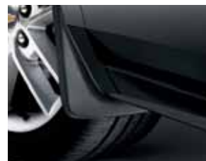
Molded front splash guards