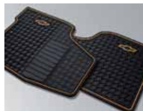
All-weather front floor mats