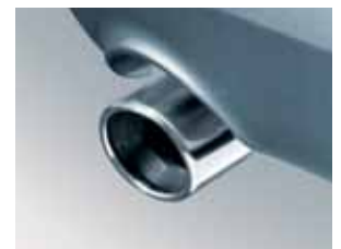
Polished stainless steel exhaust tip

1 Extra-cost color. Not available on LS.