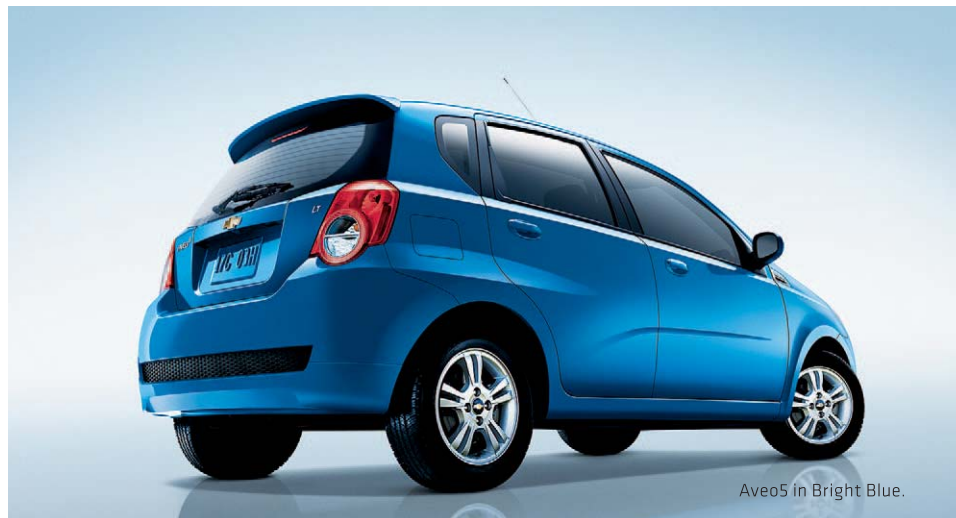
Aveo5 in Bright Blue.

For details about standard features, options and pricing, visit chevy.com/aveo .