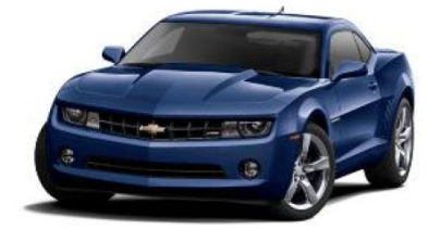
IMPERIAL BLUE METALLIC Not available on SS