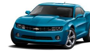
AQUA BLUE METALLIC Not available on SS