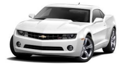
SUMMIT WHITE Interim availability