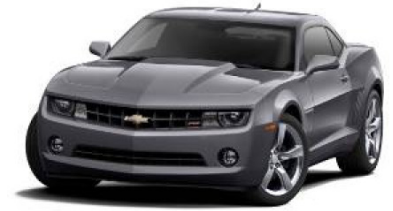
CYBER GRAY METALLIC