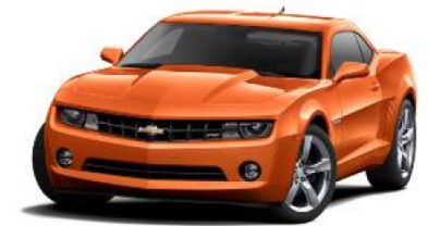
INFERNO ORANGE METALLIC