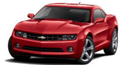
RED JEWEL TINT COAT Extra-cost color