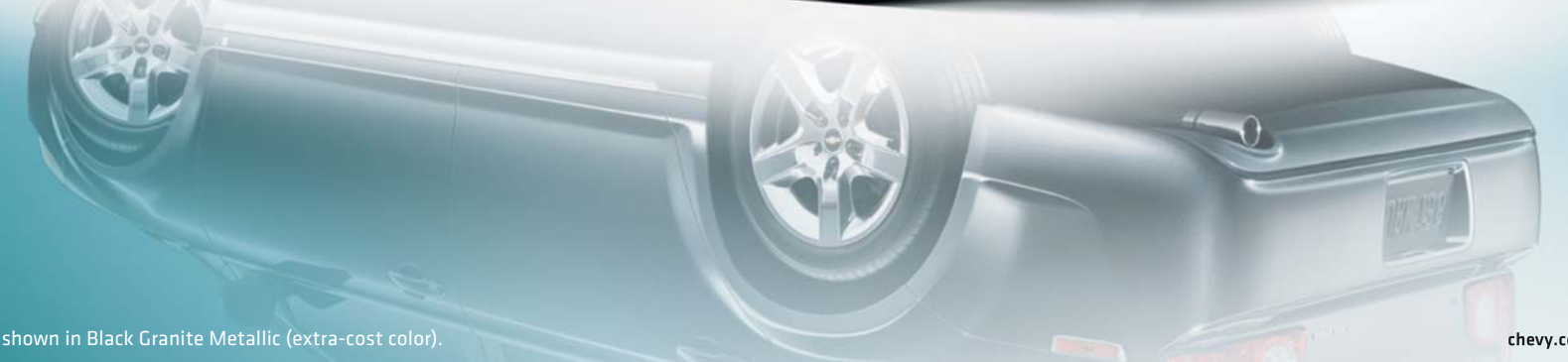
Malibu 1LT shown in Black Granite Metallic (extra-cost color).