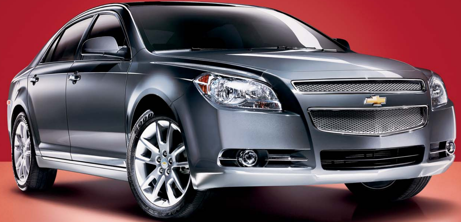
Malibu LTZ shown in Dark Gray Metallic.

A distinctive sail panel design is incorporated into the rear profile to further accentuate the roof line.