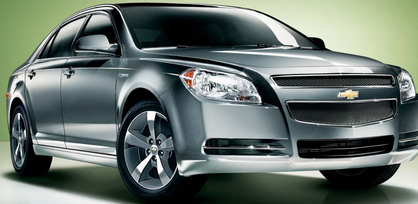
Malibu Hybrid in Dark Gray Metallic.

While you're stopped in traffic, the AUTO STOP message in the Driver Information Center informs you that the engine has shut down and that the vehicle is running on full electric power, helping you save fuel. When you lift your foot off the brake and step on the accelerator pedal, the engine is instantaneously turned back on. The electric motor and drive belt allow for smooth, seamless starts.