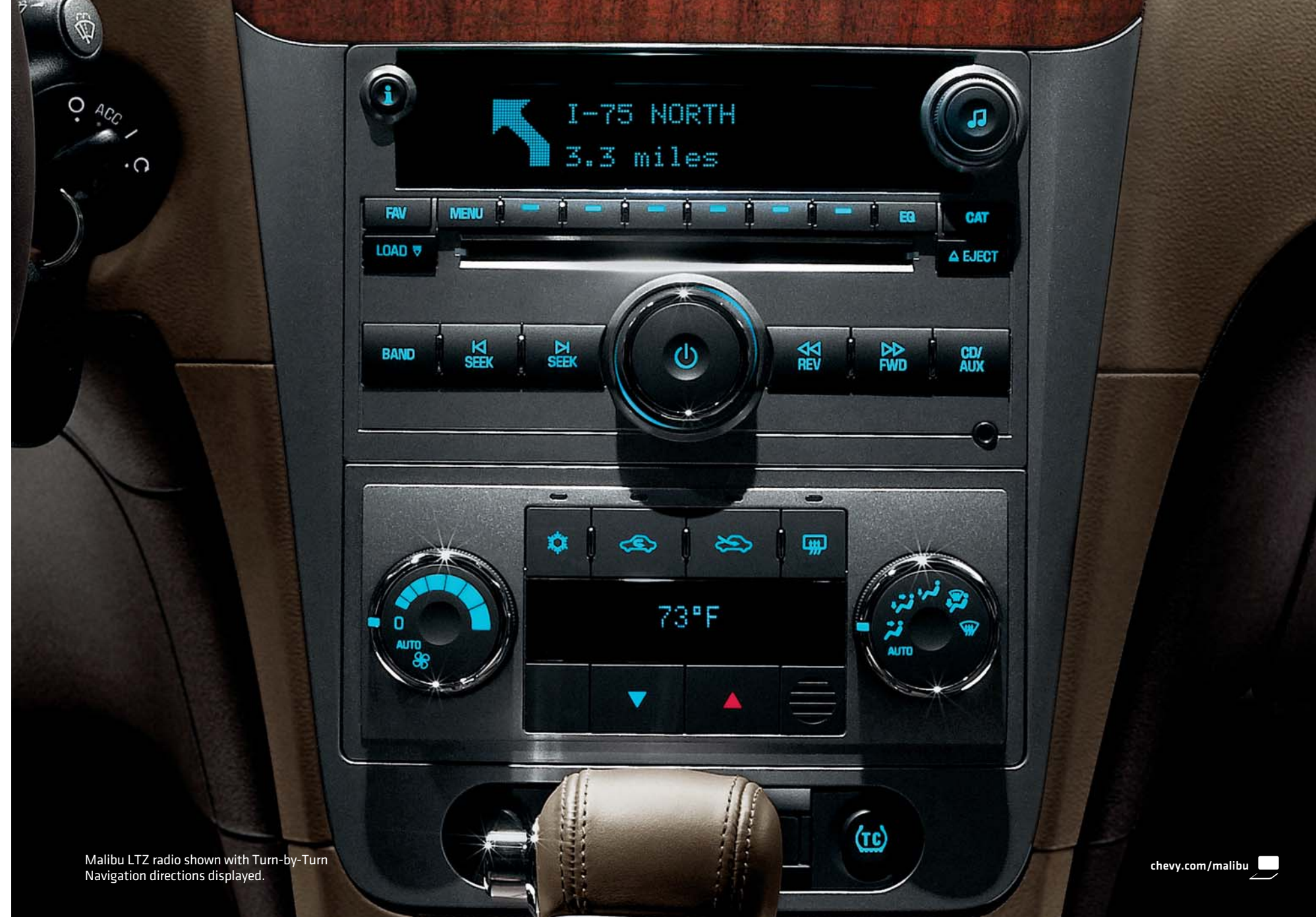
Malibu LTZ radio shown with Turn-by-Turn Navigation directions displayed.