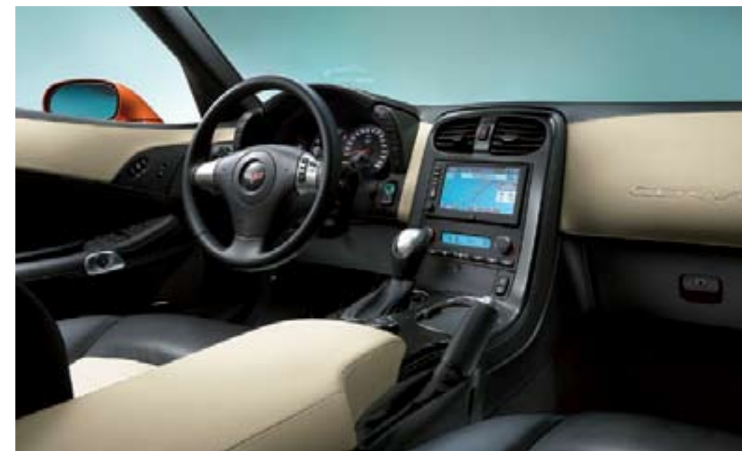
The available Custom Leather-Wrapped Interior Package includes two-tone seats, instrument panel, door panel uppers and console cover, all with contrasting stitching, plus an elegant Bias-pattern console trim plate. 4LT shown with available features.