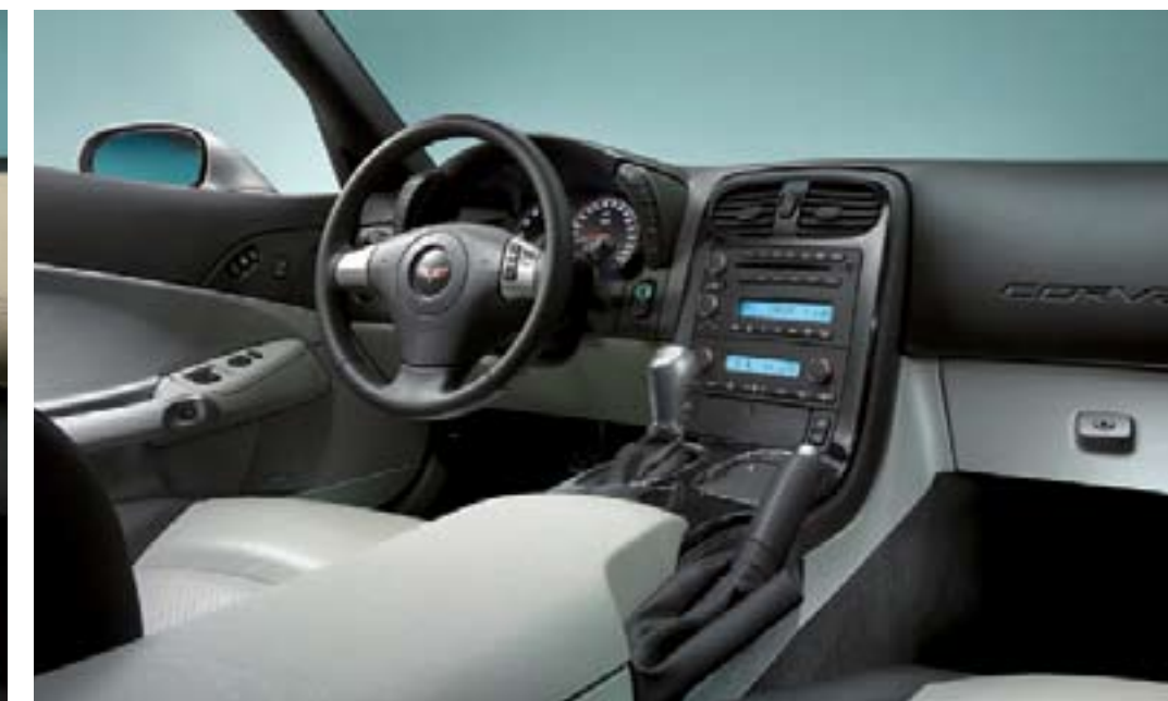
The standard interior for all models includes a new Cyber-pattern console trim plate with contrasting stitching and the option of two-tone leather seating surfaces on 2LT and 3LT models. 3LT shown with available features.