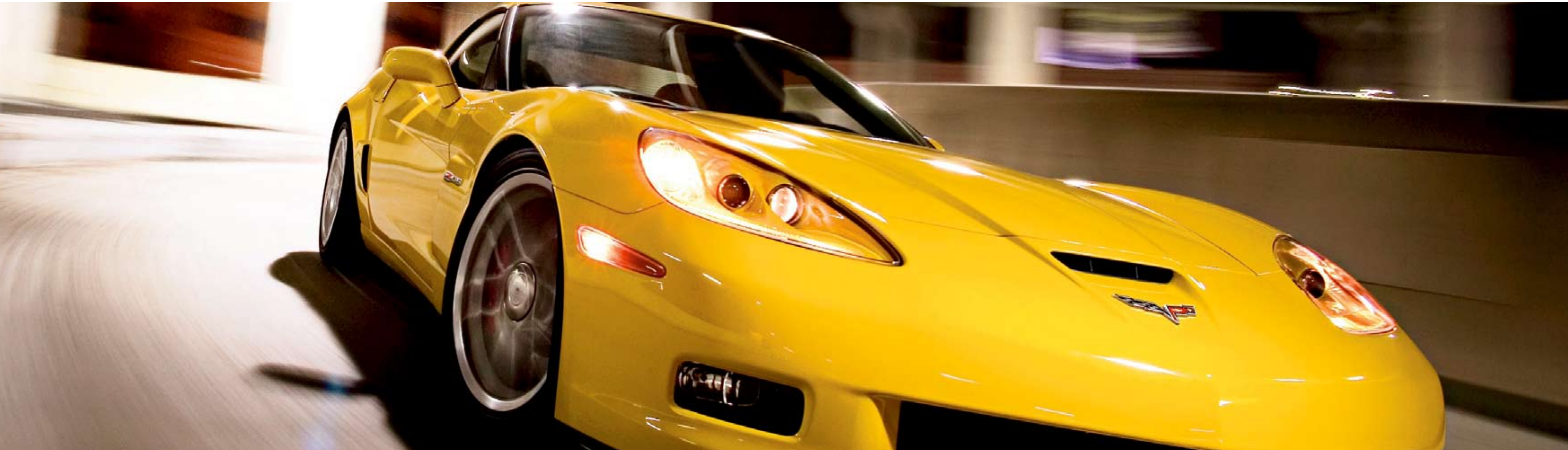
Corvette Z06 in Velocity Yellow Tintcoat, an extra-cost color, with available Polished Aluminum wheels.