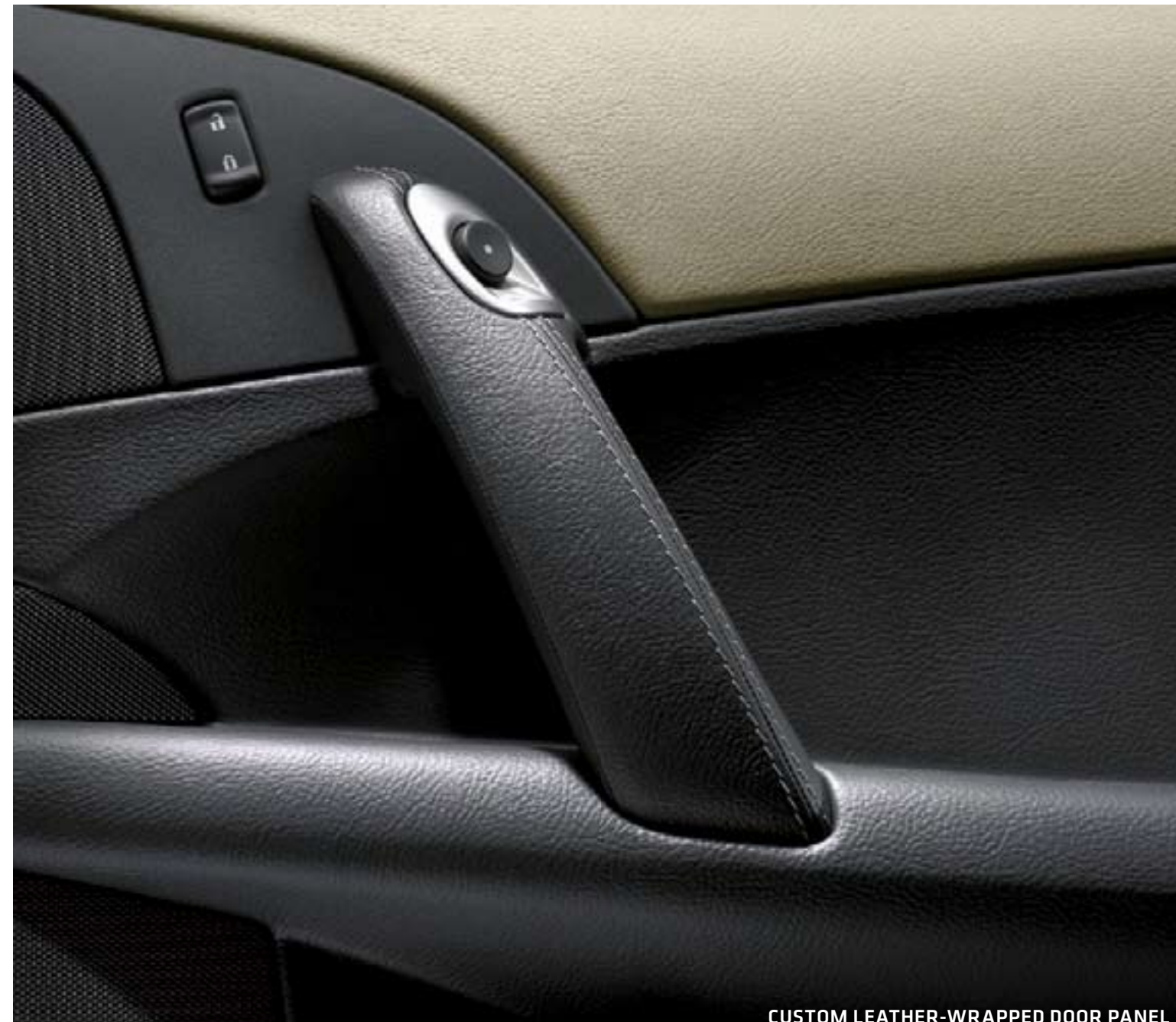
CUSTOM LEATHER-WRAPPED DOOR PANEL