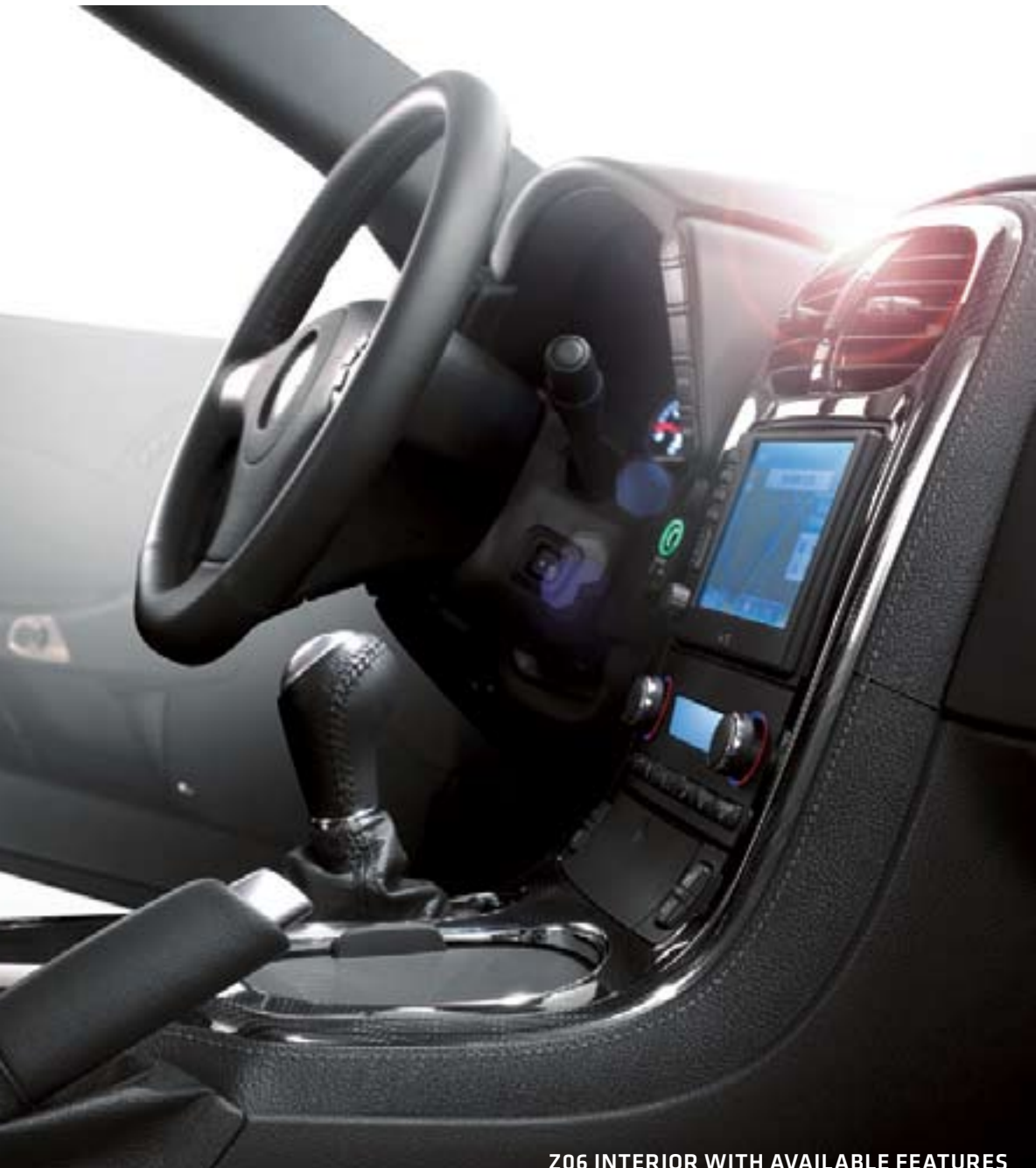
Z06 INTERIOR WITH AVAILABLE FEATURES