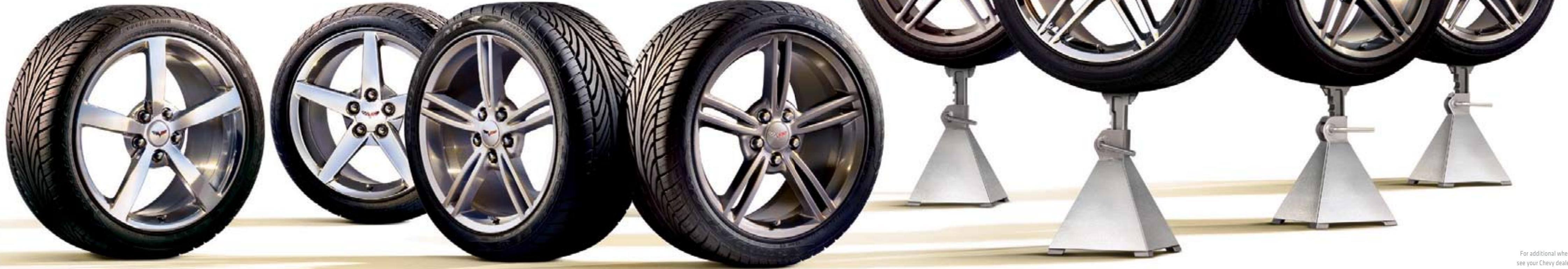
Available Z06 Polished Aluminum

For additional wheel styles, see your Chevy dealer or visit chevrolet.com/corvette/accessories .