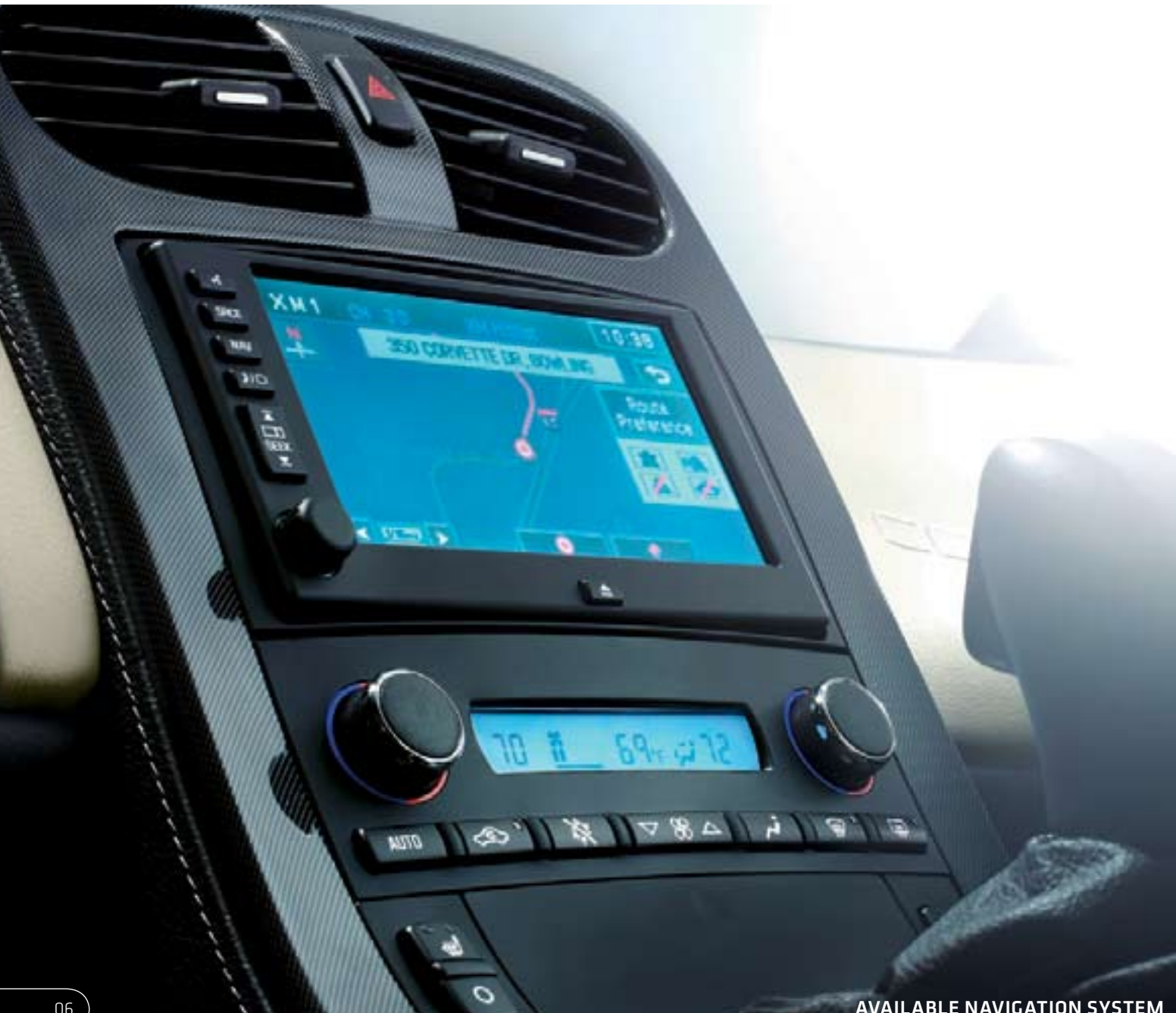
AVAILABLE NAVIGATION SYSTEM