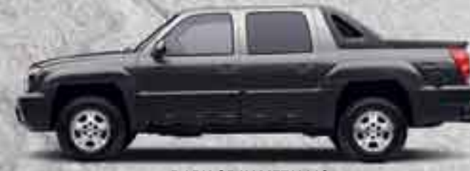
DARK GRAY METALLIC