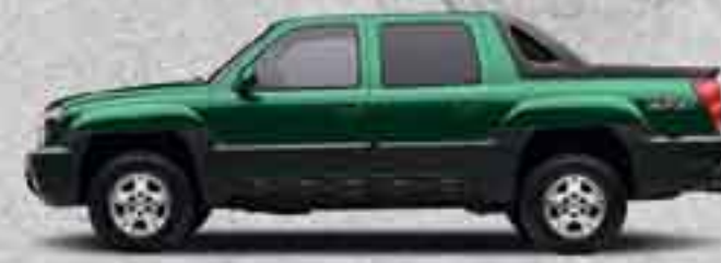
DARK GREEN METALLIC