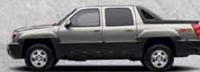
LIGHT PEWTER METALLIC