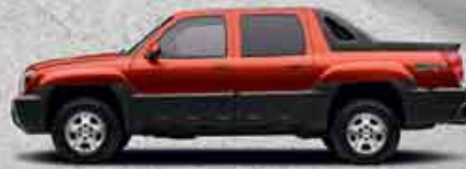
SUNSET ORANGE METALLIC

NOTE: Medium Sage Green Metallic (not shown) is available on the North Face Edition only until Dec. 2002.