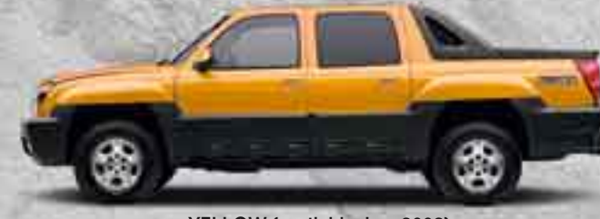
YELLOW (available Jan. 2003)