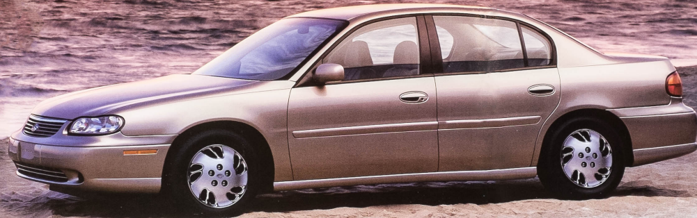
Malibu Sedan in Sandrift Metallic.

You asked for excellence in a new sedan. Malibu is the car you knew America could build.