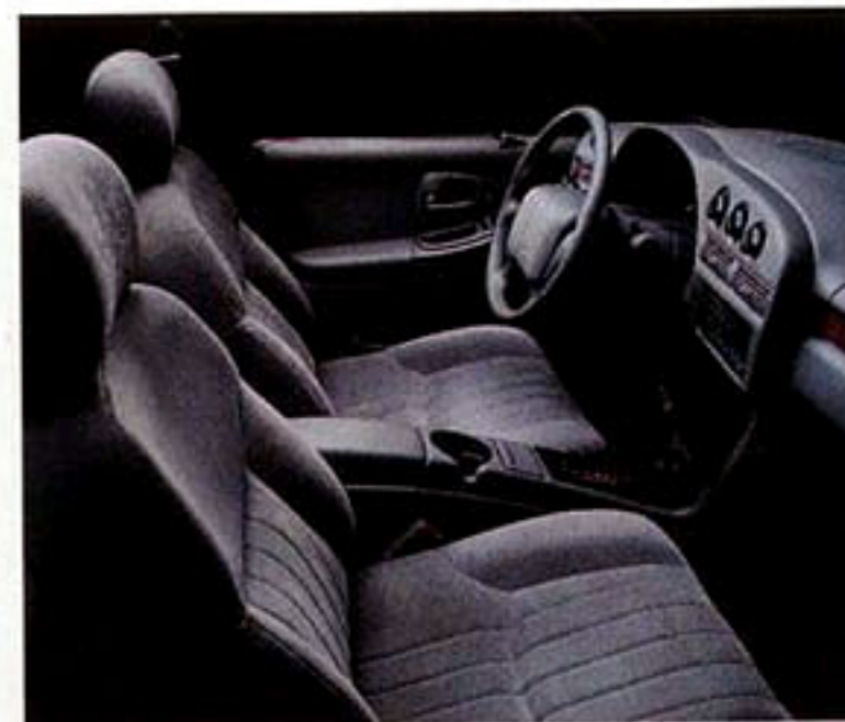
Lumina LS Custom Cloth interior with optional front bucket seats.

Lumina LS Sedan seats six in comfort with the standard 60/40 seating arrangement (includes center storage armrest). Or you can opt for 40/40 reclining front bucket seats and center console (shown below). Either way, you get newly contoured chair-high seats, cup holder, and power windows with a driver's Express-Down feature. Optional: a remote keyless entry system that allows you to lock or unlock doors, or unlock the trunk from up to 30 feet away.