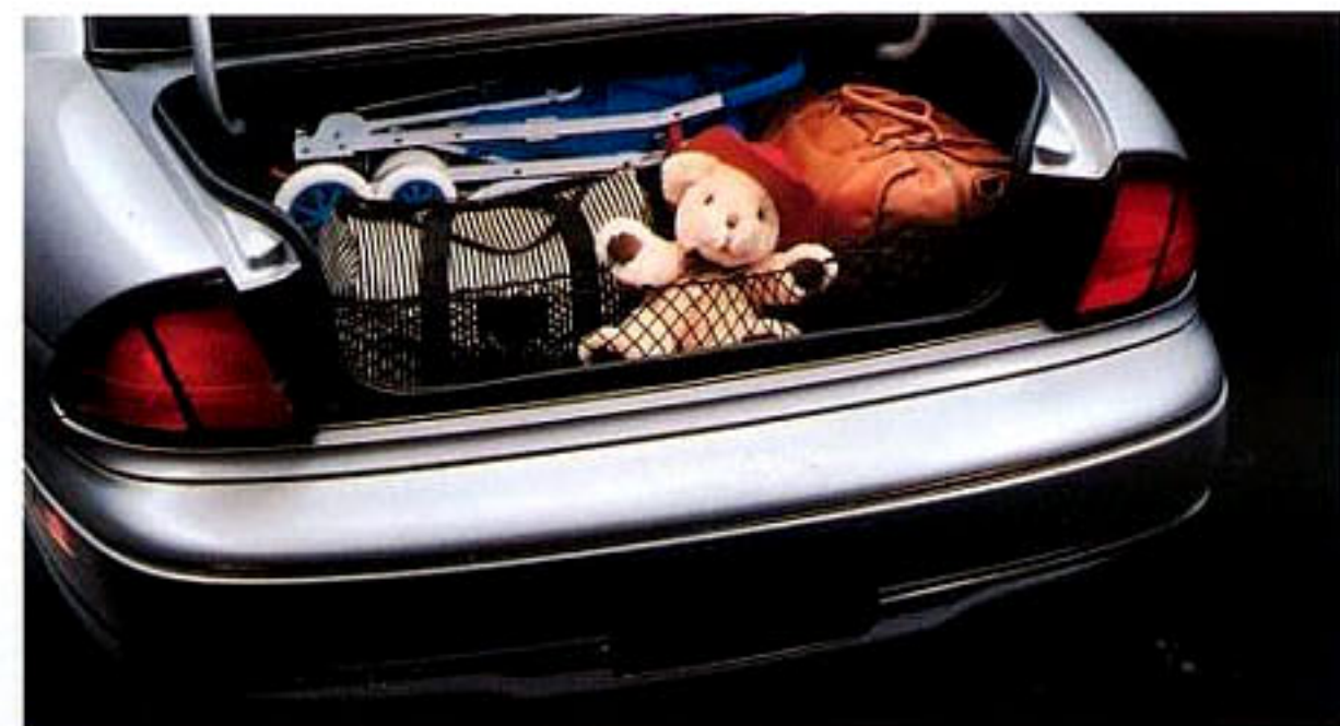
IMPRESSIVE CARGO SPACE. The large 15.7-cu.-ft. trunk features a low lift-over height for added loading convenience. The optional cargo retaining net, shown here, is designed to help keep small packages secure.

The newly designed 60/40 front seat with full-foam construction offers exceptional comfort and the added convenience of a center armrest with storage compartment and cup holder. Nighttime "theatre lighting" is a new standard feature for 1995. It starts out bright when you get in the car, then gradually dims as you prepare to drive away.