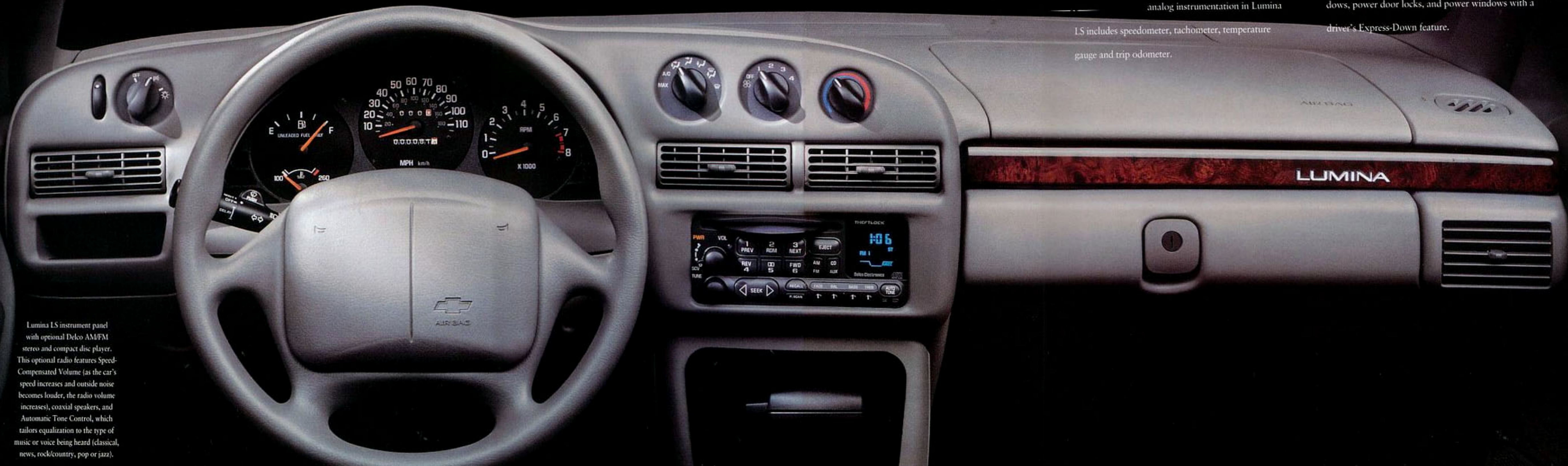
Lumina LS instrument panel with optional Delco AM/FM stereo and compact disc player. This optional radio features Speed-Compensated Volume (as the car's speed increases and outside noise becomes louder, the radio volume increases), coaxial speakers, and Automatic Tone Control, which tailors equalization to the type of music or voice being heard (classical, news, rock/country, pop or jazz).

The first thing you'll notice is the quality. The soft-feel steering wheel and control knobs. The way everything seems to wrap around you. Then you'll see how this instrument panel design makes driving easier. The easy-to-see, easy-to-read analog instrumentation in Lumina LS includes speedometer, tachometer, temperature gauge and trip odometer. Convenience features include a cup holder, a spacious lockable glove compartment, in-door storage pockets and courtesy lighting for reading maps at night. Other reasons driving is more pleasurable in a Lumina LS include a standard Tilt-Wheel™ Adjustable Steering Column, Soft-Ray™ tinted glass for all windows, power door locks, and power windows with a driver's Express-Down feature.