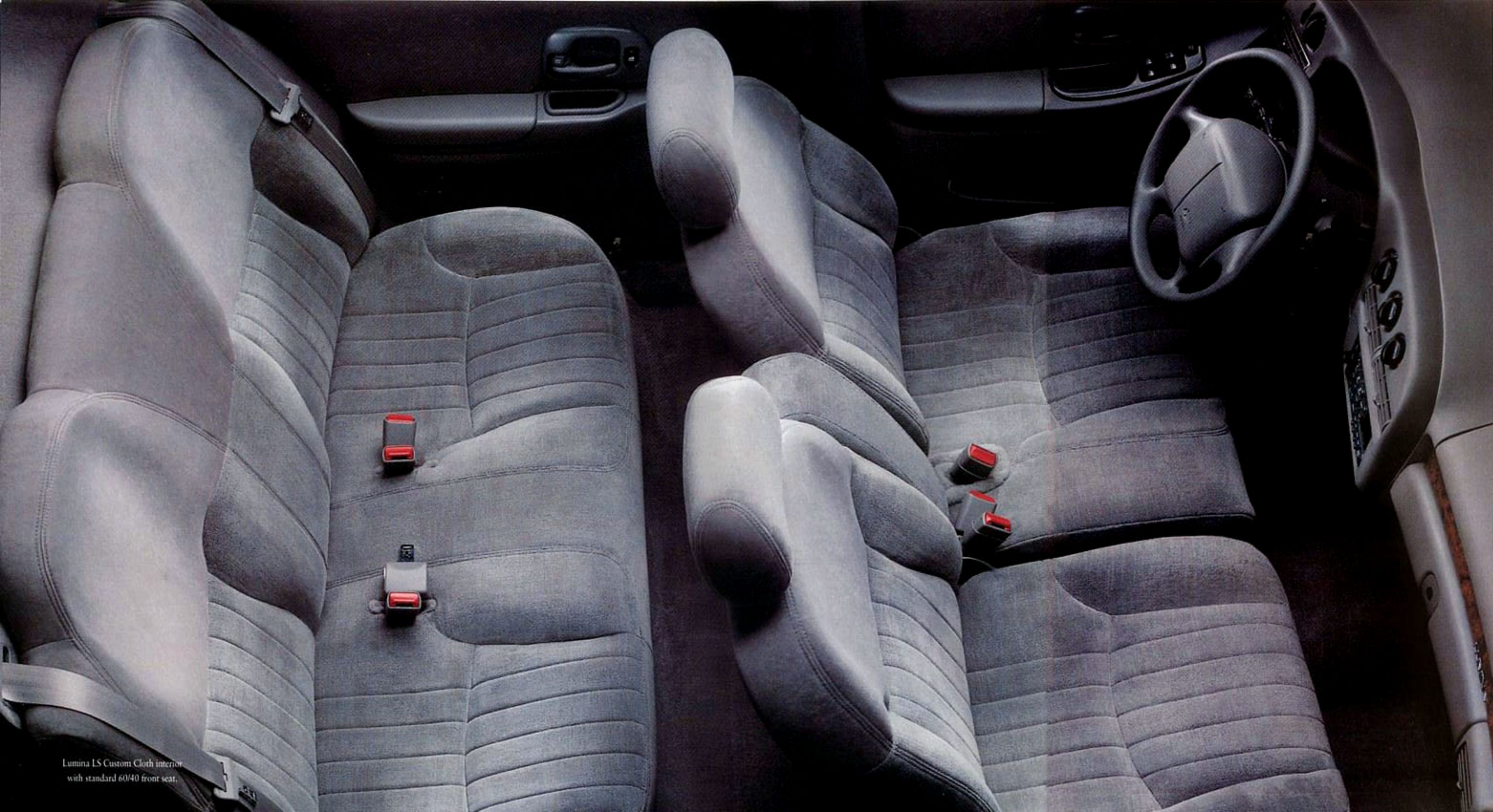
Lumina LS Custom Cloth interior with standard 60/40 front seat.

You want a car that can handle everyday life. You want the room for friends, family and groceries. You want to take that summer vacation — and you want to be able to take your luggage, too. LUMINA LS. ALL THE ROOM AND COMFORT YOU ASKED FOR. That's why Lumina LS Sedan