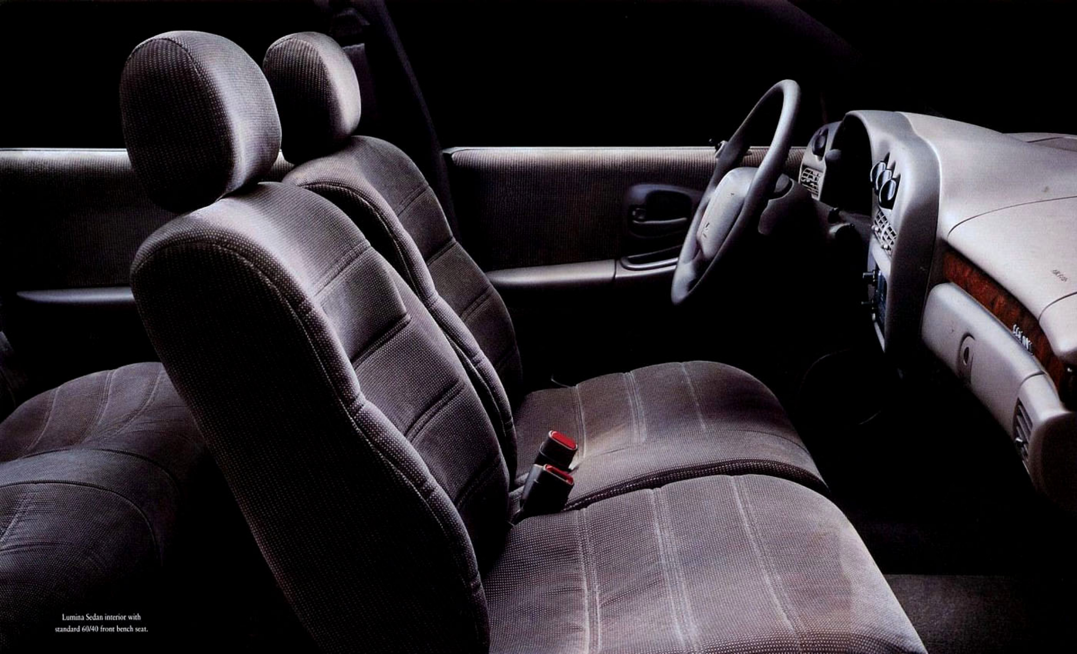
Lumina Sedan interior with standard 60/40 front bench seat.

Here's something you don't see every day: a spacious six-passenger interior in a truly affordable mid-size car.