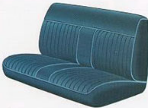
Custom Vinyl bench seat.

Seating for up to nine (including optional second and third bench seats) leaves you space for up to 40.8 cu. ft. of cargo.