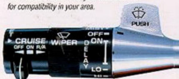
Optional electronic speed control with resume and accelerate features.

*Receives C-Quam® stereo broadcasts. Most AM stereo stations across the country broadcast in C-Quam but some do not. Check with your local stations for compatibility in your area.