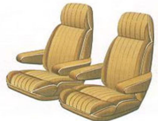
Custom Cloth reclining bucket seats.