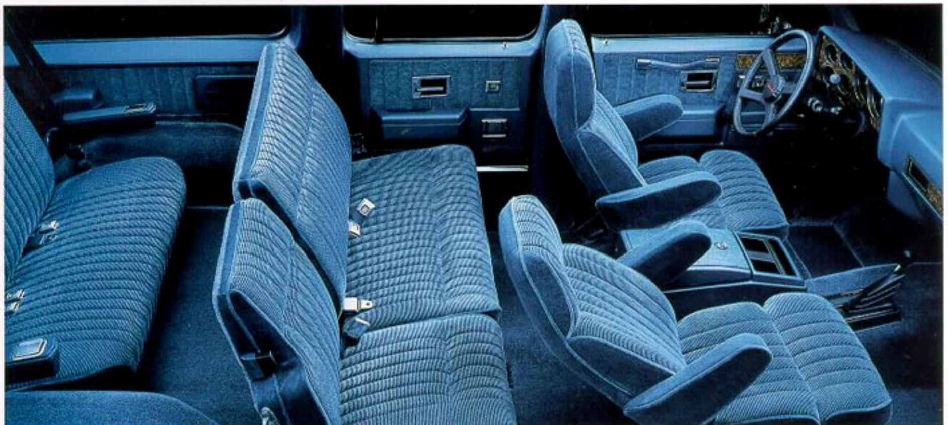
Suburban interior with optional Silverado trim and optional seating for eight passengers.