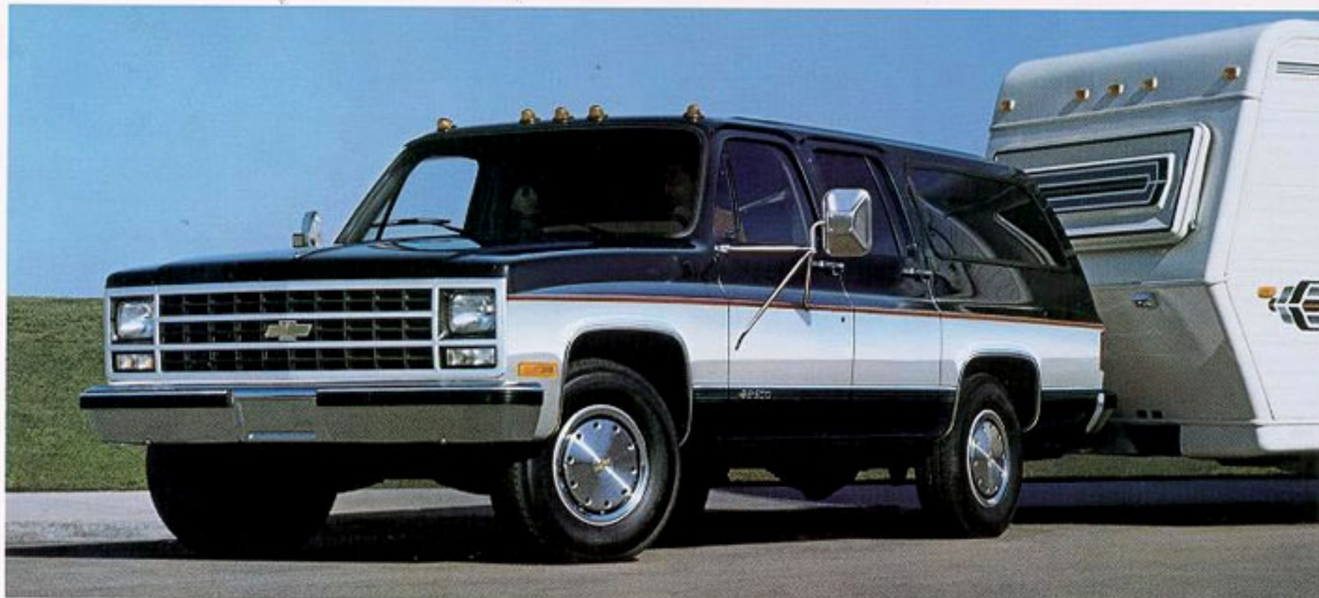
R2500 Suburban with standard Scottsdale trim.