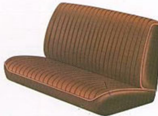
Deluxe Cloth bench seat.