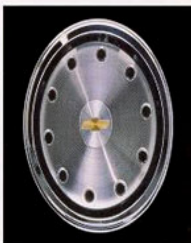
Full wheel covers.