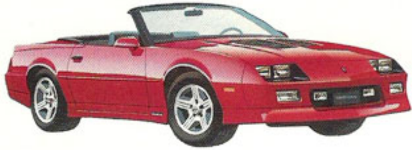
Camaro IROC-Z Convertible.