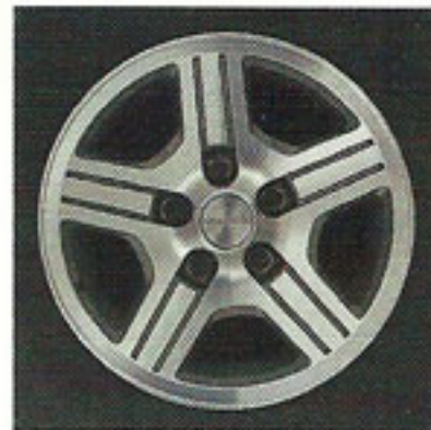
IROC-Z 15" cast-aluminum wheel (with silver or gold accents). Optional IROC-Z 16" cast-aluminum wheel also available (with gray or gold accents).