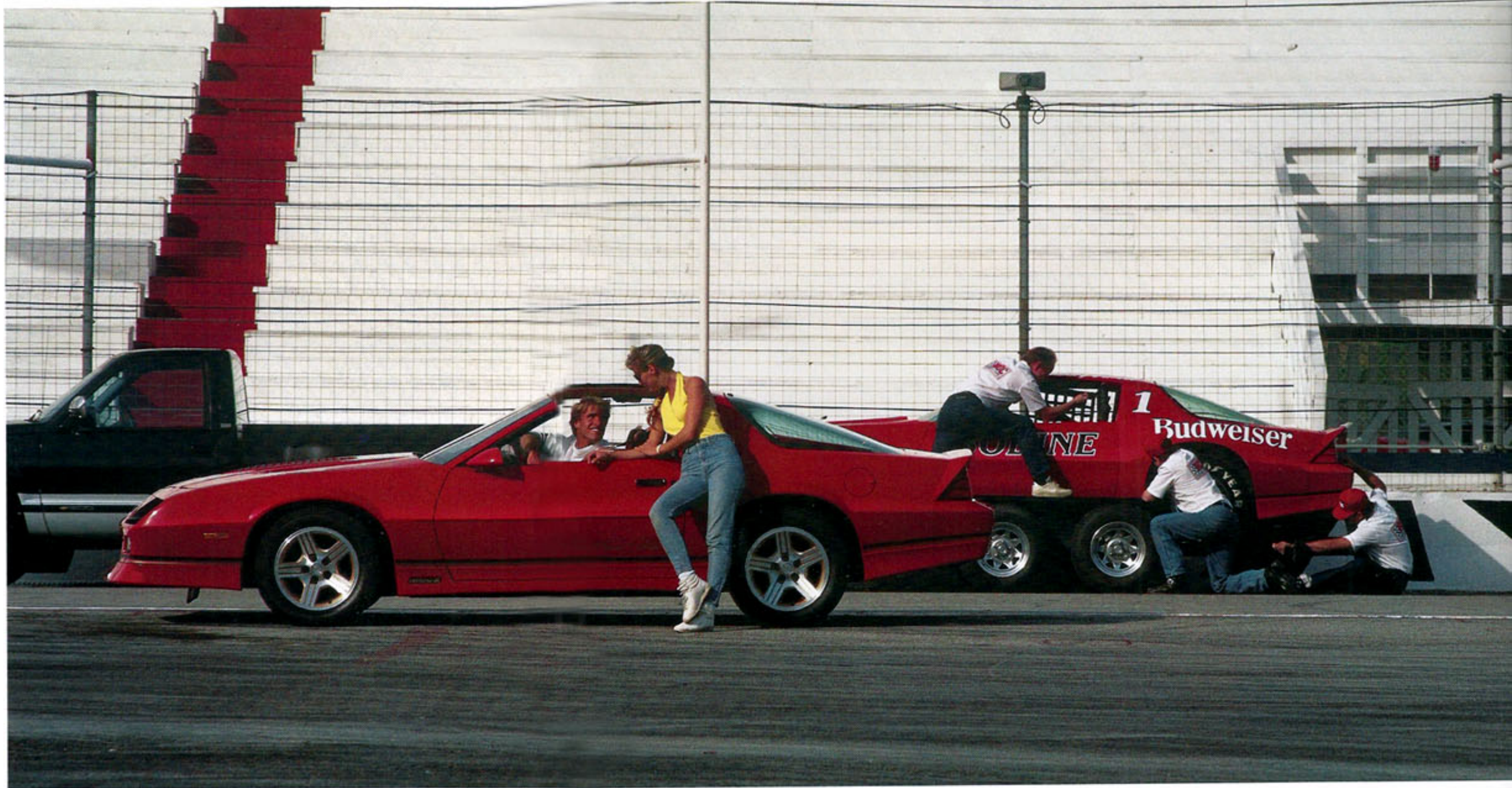
Camaro IROC-Z Coupe with optional removable roof panels and 16" cast-aluminum wheels.

Fast-ratio power steering, larger stabilizer bars front and rear, and grippy 15" Eagle GT tires are all part of the competition-proven suspension. For the ultimate in IROC-Z appearance, 16" aluminum wheels and Eagle unidirectional tires are optional.