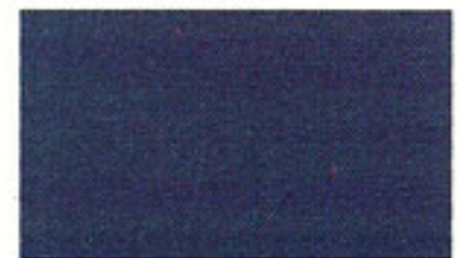
Bright Blue Metallic