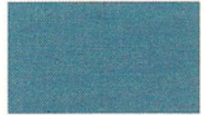
Light Blue Metallic*