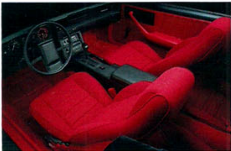
Camaro RS interior.