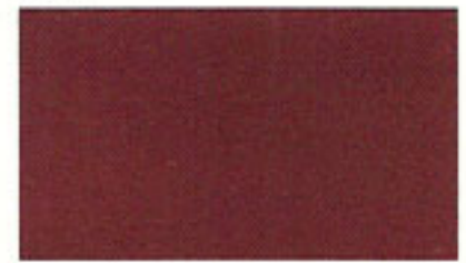
Dark Red Metallic