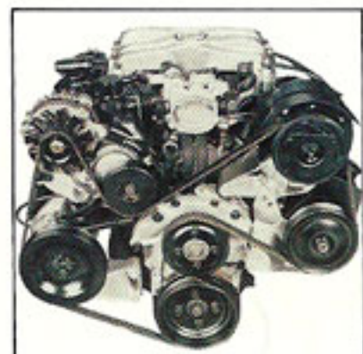
2.8 Liter V6 with Multi-Port Fuel Injection (standard on Camaro RS Coupe).

S—Standard. O—Optional. NA—Not Available. EFI—Electronic Fuel Injection. MFI—Multi-Port Fuel Injection. TPI—Tuned-Port Fuel Injection. *Produced in USA, Canada and Mexico. †Required option.