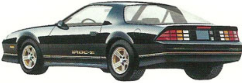
Camaro IROC-Z Coupe.