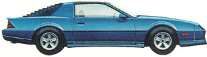
Camaro RS Coupe with optional rear window louvers.