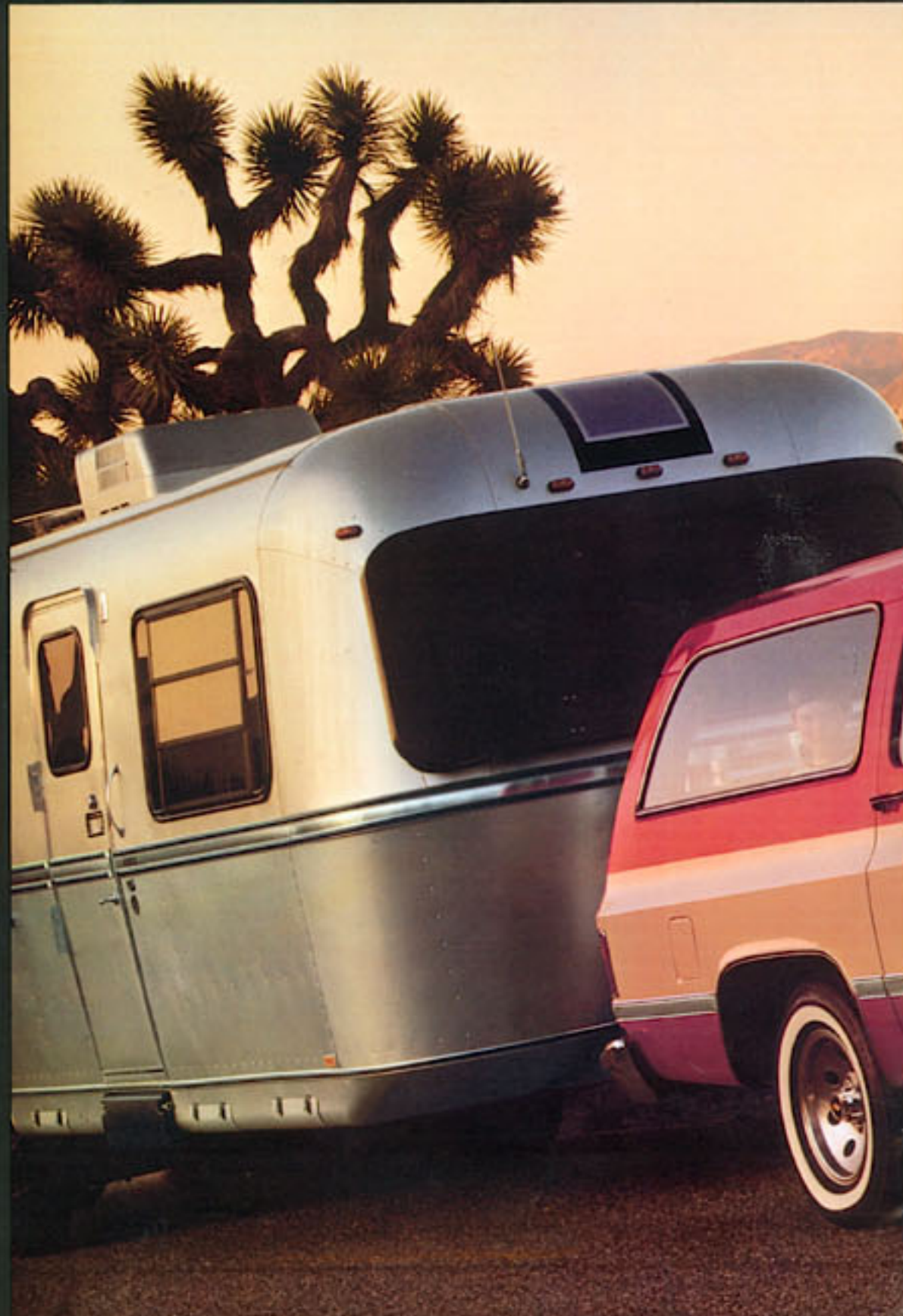
C10 Suburban Silverado with Exterior Decor Package in Apple Red and Doeskin Tan.