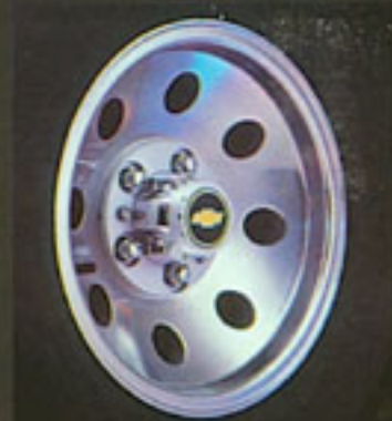
Cast aluminum wheels