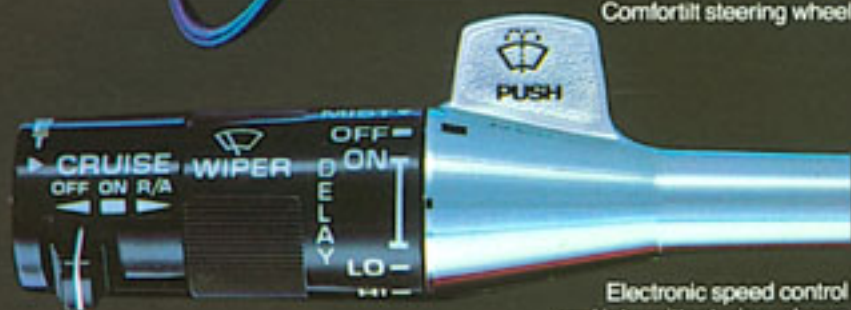
Electronic speed control and intermittent wiper shown on standard multi-function switch.