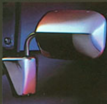
Below Eyeline mirror