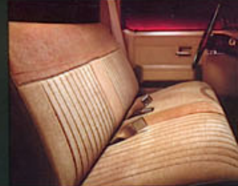
Scottsdale trim in Saddle Tan Custom Cloth.