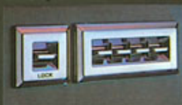
Power door locks Power windows