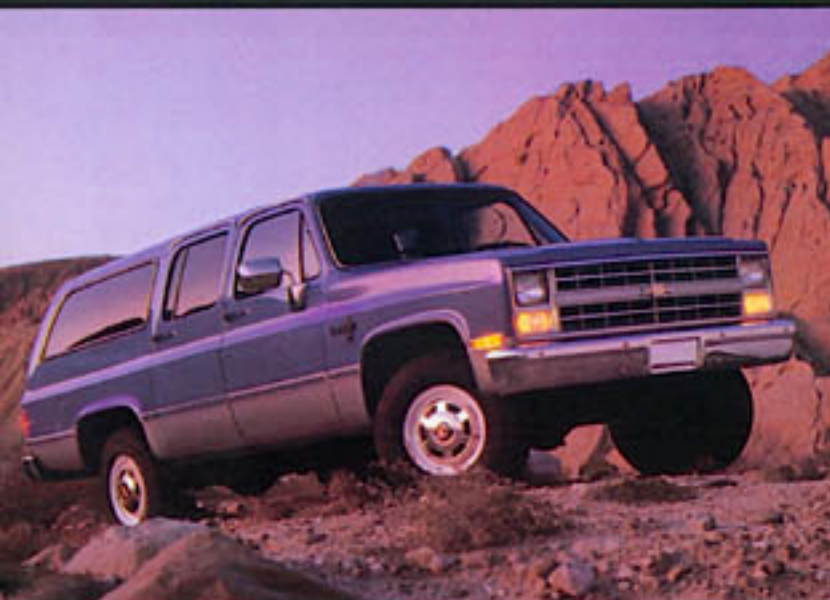
K20 Suburban Scottsdale Special Two-Tone in Light Blue and Silver.

*See Trailering Chart, page 8 for details.