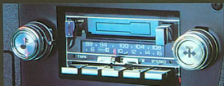
GM-Delco AM/FM stereo radio with cassette deck