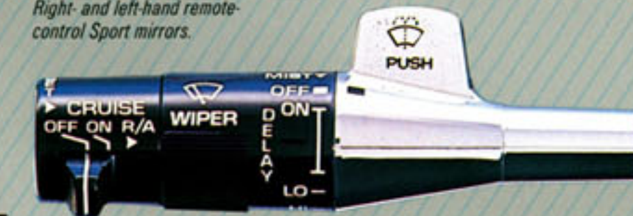
A multi-function dimmer/wiper/washer/turn signal lever is new for 1984. Optional electronic speed control has resume feature and a new fingertip speed adjustment.

Caprice Classic and Impala are available with a wide variety of options. So you don't have to pay for equipment you don't want.