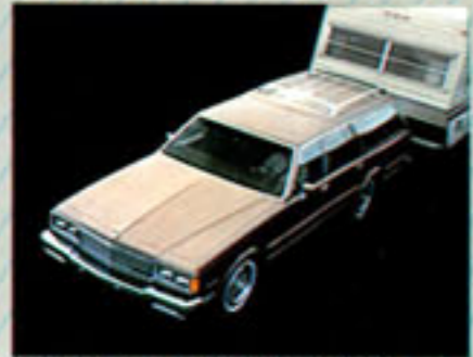
Caprice Classic Wagon can be equipped to be a powerful towing vehicle. See the Chevy Recreation & Trailering Guide for details.

Here's how to get even more of a good thing. Choose Caprice Classic Station Wagon. Get the ride, comfort and luxury of a Caprice. Plus, roomy accommodations for up to eight passengers with the standard third seat. Plus, 87.9 cubic feet of cargo capacity with rear seats down. These two