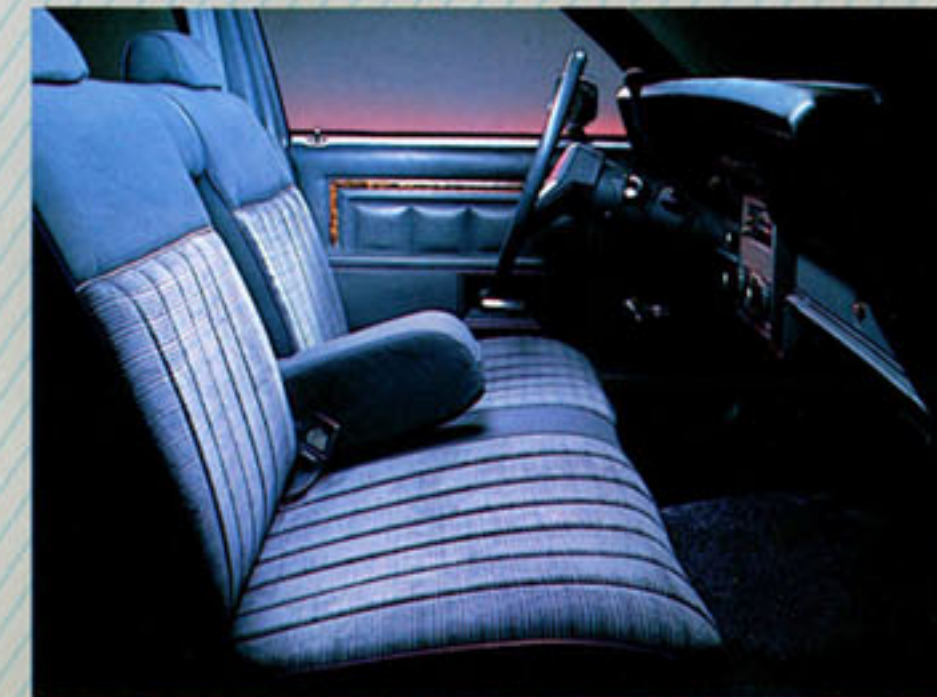
Impala standard cloth bench seat with fold-down center armrest.

Impala. Full-Size in Every Way but Price. Even More Comfort Than Before.