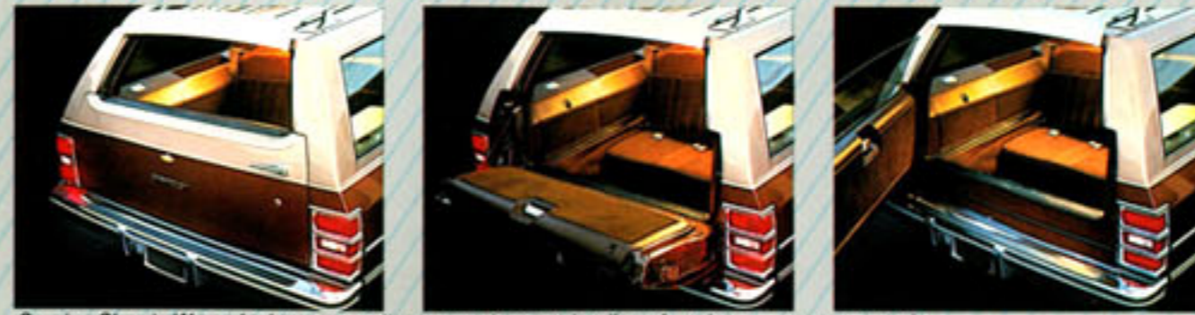
Caprice Classic Wagon's three-way tailgate permits easy loading of packages, cargo or people.