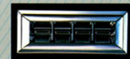
...and power windows are among the many options available.