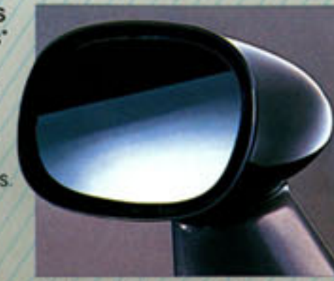
Right- and left-hand remote-control Sport mirrors.

Engine oil: 12 months or 7,500 miles* Oil filter: 12 months or 7,500 miles; every 15,000 miles thereafter* Spark plugs†: Up to 30,000 miles Chassis lubrication: 12 months or 7,500 miles Automatic transmission fluid change: Every 100,000 miles. *5,000 miles with diesel. †Except diesel. See Owner's Manual for conditions requiring more frequent intervals.