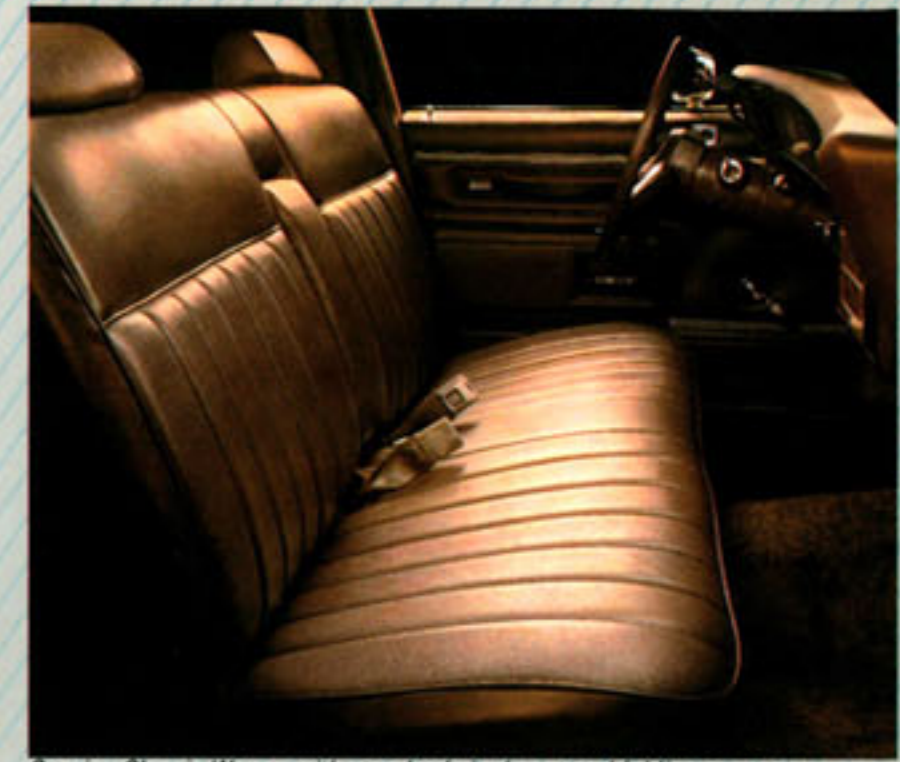
Caprice Classic Wagon with standard vinyl seat and folding armrest.