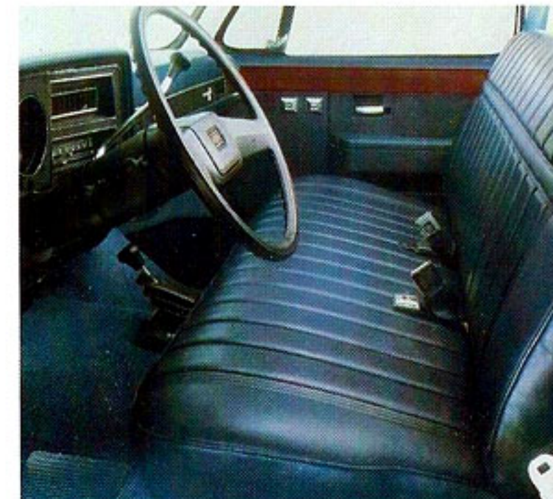
Scottsdale interior shown in Blue.