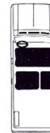
Optional second seat added.