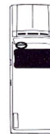
Suburban with standard front seat.

The Suburban's available 4-wheel drive system features automatic locking front hubs. Even with 4WD, the Suburban's entry height is a convenient 21.6 to 23.6 inches, depending on model, with over a full 7.0 inches of ground clearance.