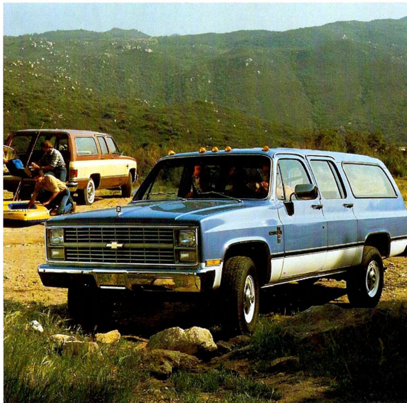
K20 Suburban Silverado in Light Blue Metallic and Frost White.

People and cargo choices. With its optional second and third seats, the Suburban moves up to nine people with plenty of leg and elbow room.