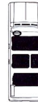
Optional second and third seats for nine-passenger seating.