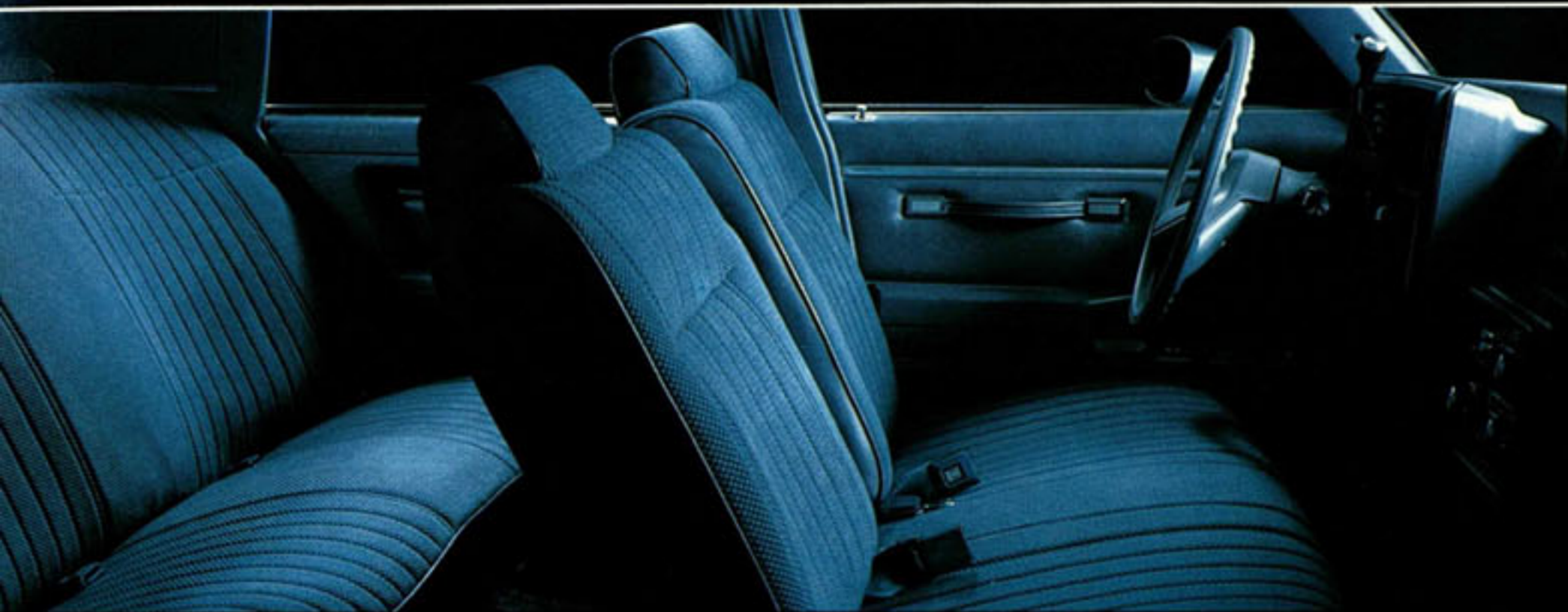
Malibu CL Custom Interior with notchback bench seat and folding center armrest.

impressive list of standard features and an attractive Chevrolet price. Malibu. A great way to meet your family's needs — and do it with style.