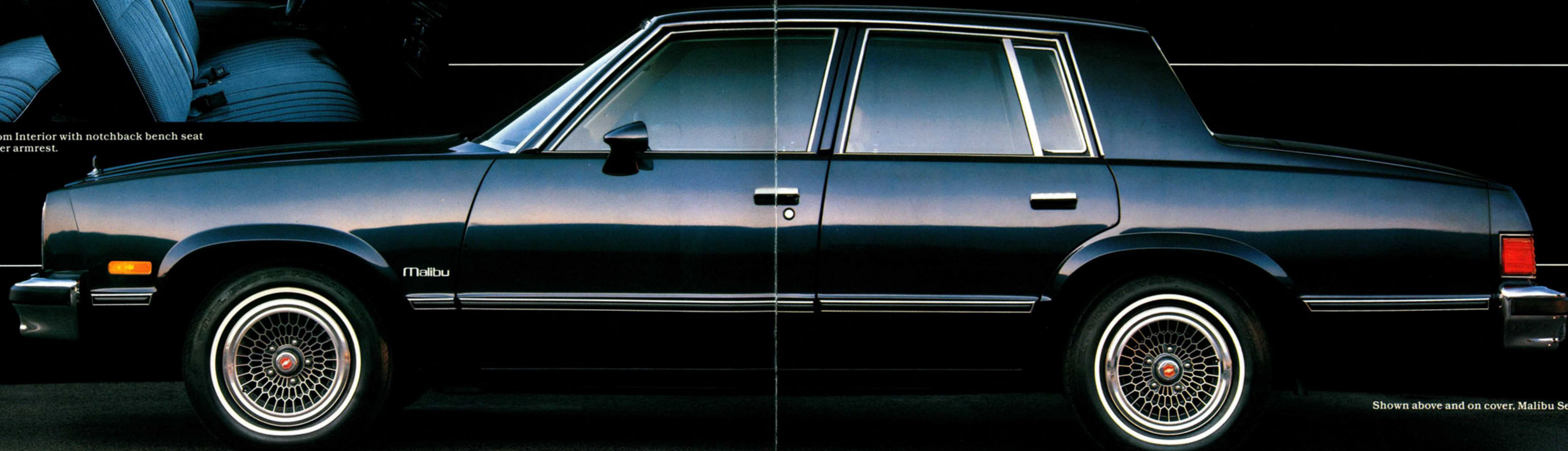
Shown above and on cover, Malibu Sedan.

Important: A word about this catalog. We have tried to make this catalog as comprehensive and factual as possible. However, since the time of printing, some of the information may have been updated. Also, some of the equipment shown or described throughout this catalog is available at extra