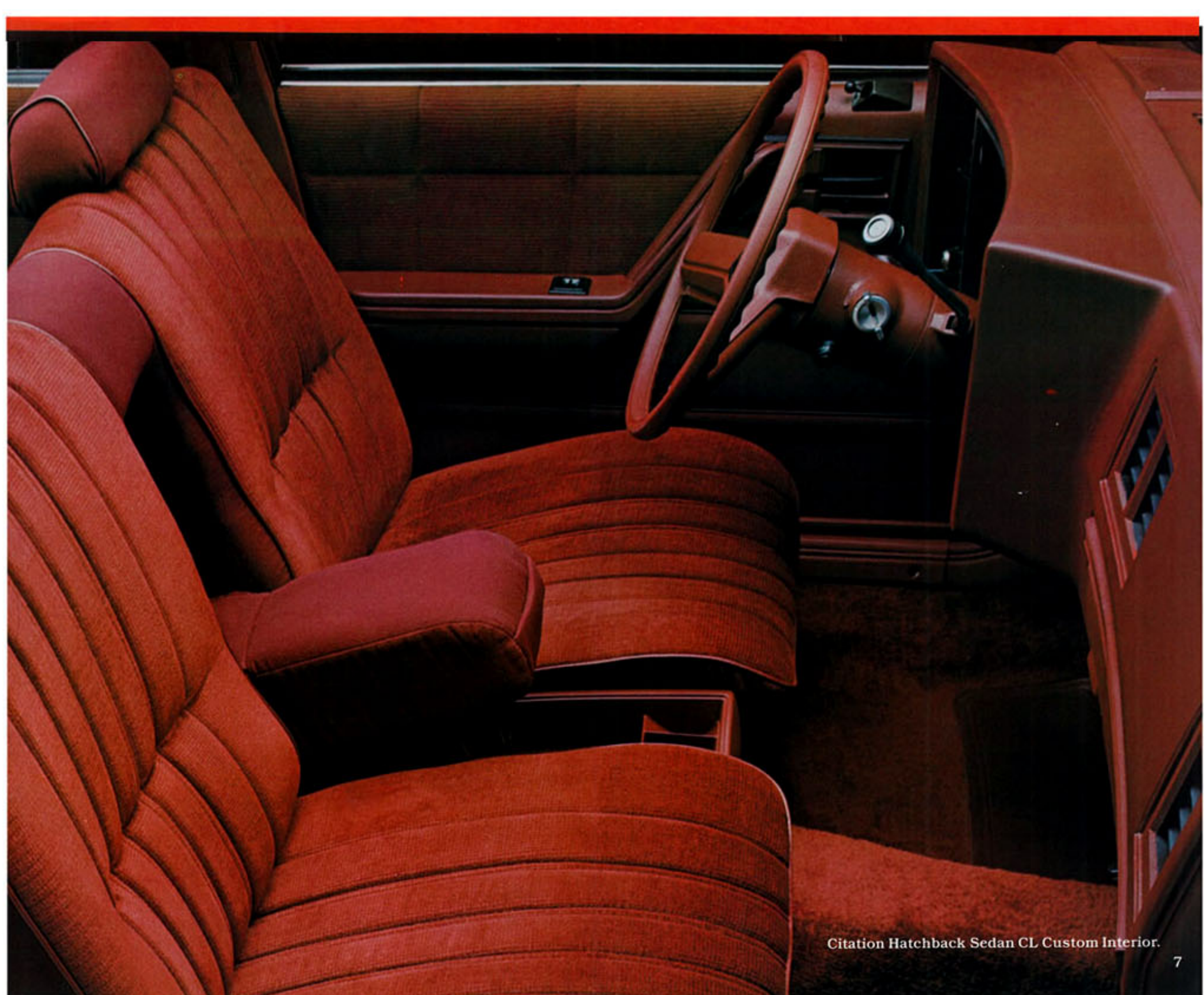
Citation Hatchback Sedan CL Custom Interior.

Sit back in deep, foam-cushioned comfort. Relax and enjoy the view from this roomy interior.