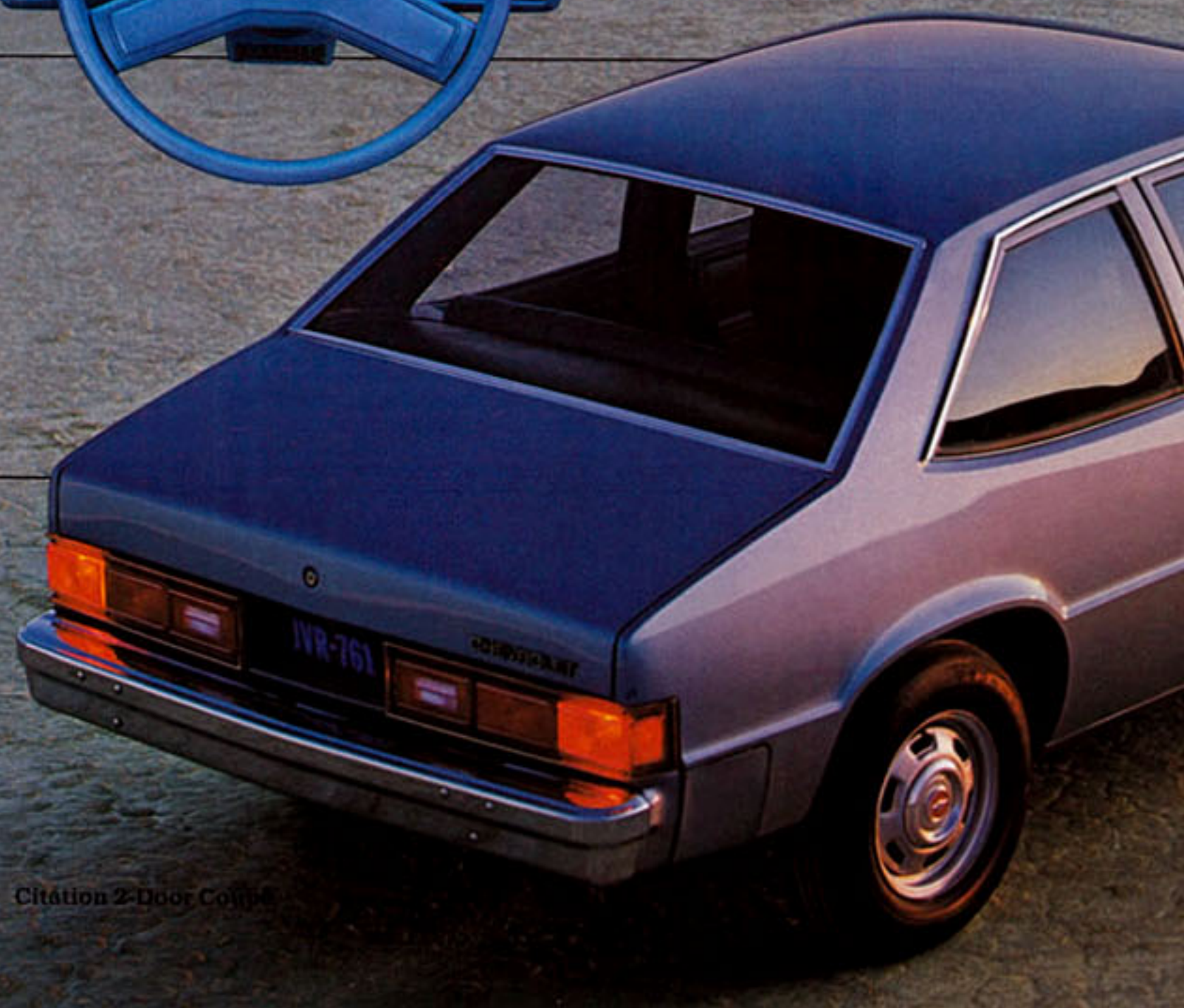
Citation 2-Door Coupe

Some additional options, as illustrated, are: