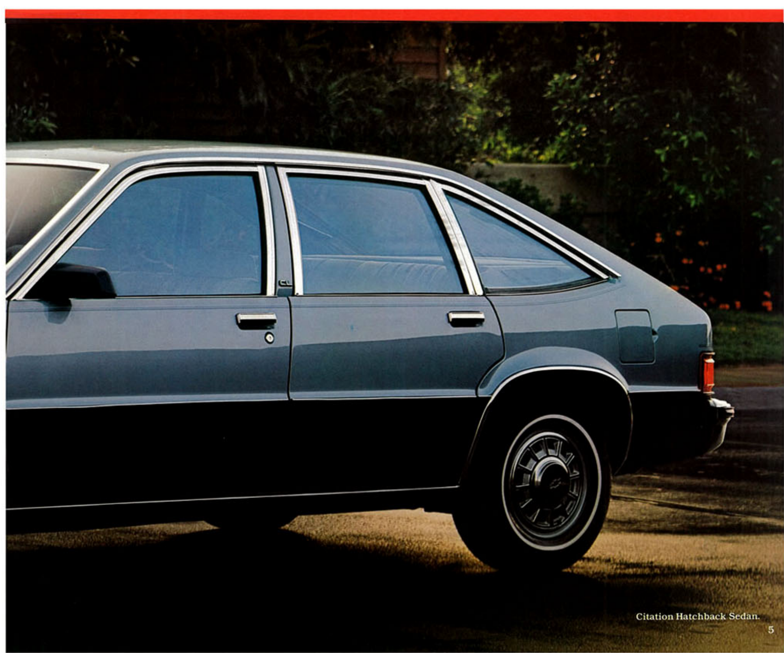
Citation Hatchback Sedan.

P ortrait of a winner. Less than 15 feet bumper to bumper, Citation's compact size gives you great maneuverability in tight traffic or parking situations.