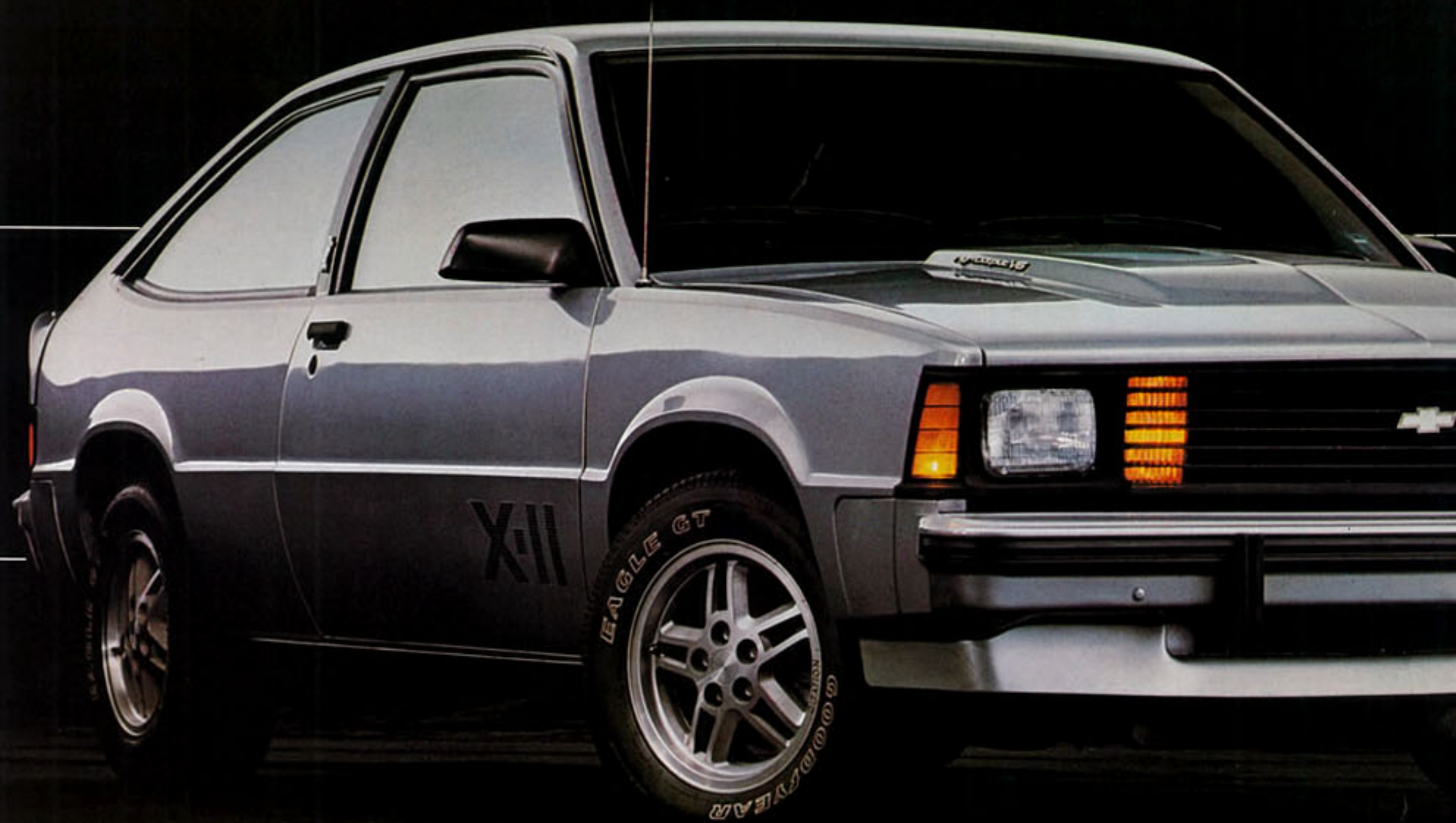
Citation X-11 Hatchback Coupe.

front-wheel drive and rack-and-pinion steering. Other features include power brakes and rear deck spoiler. X-11 makes an aggressive-looking package