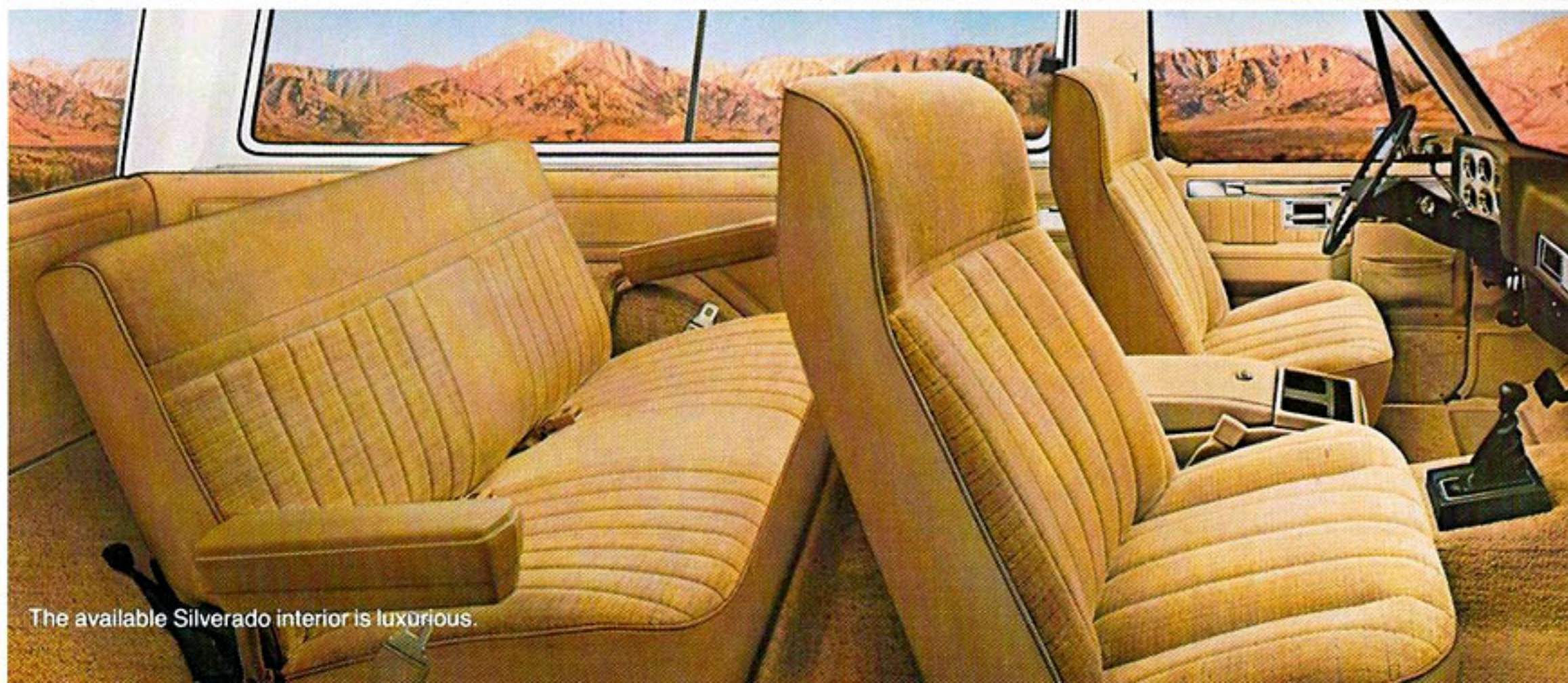
The available Silverado interior is luxurious.

Diesel V8 available. An available 6.2 Litre (379 Cu. In.) V8 Diesel engine was created specifically for truck use. No other sport utility vehicle offers a V8 diesel engine*. Its fuel economy is impressive. Rated at 130 SAE Net HP, it has the low-speed torque needed to get you through off-road situations. Properly equipped, a diesel-powered 4WD Chevy Blazer can move up to 11,000 lbs.,