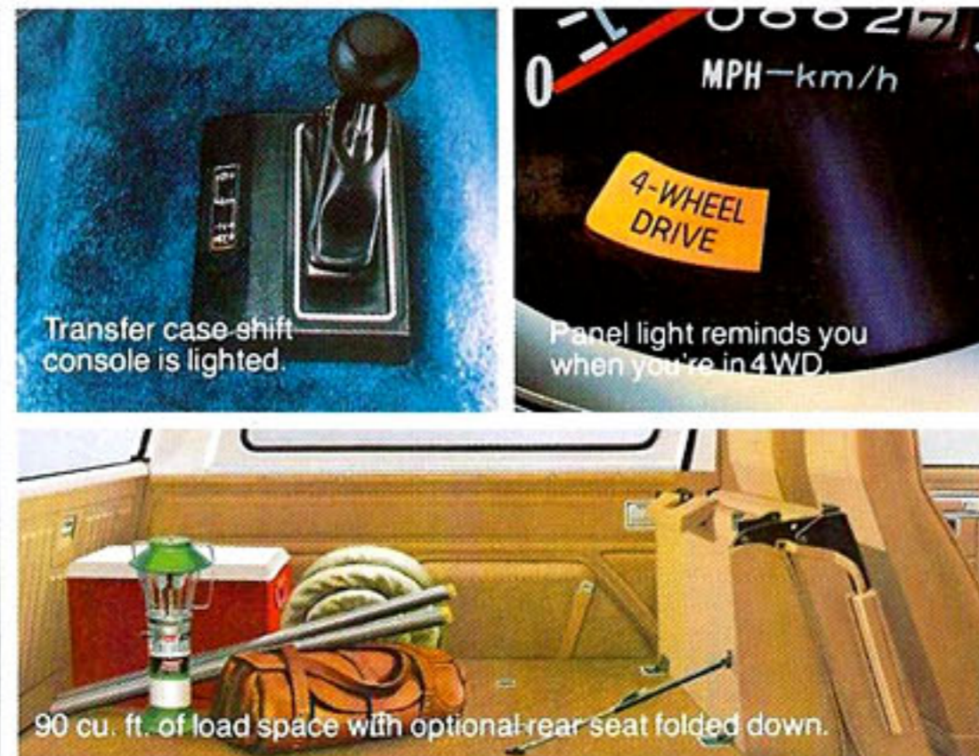
Transfer case shift console is lighted.