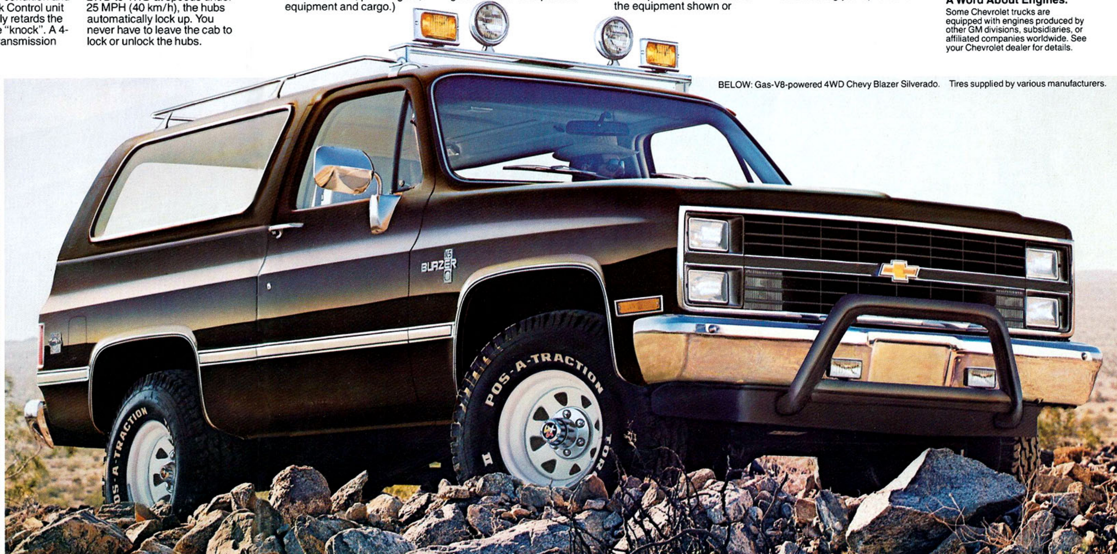
BELOW: Gas-V8-powered 4WD Chevy Blazer Silverado. Tires supplied by various manufacturers.

Some Chevrolet trucks are equipped with engines produced by other GM divisions, subsidiaries, or affiliated companies worldwide. See your Chevrolet dealer for details.