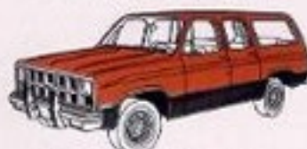
Available Special Two-Tone