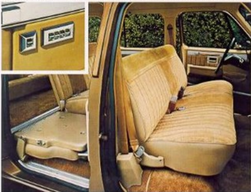
Sierra Classic custom velour cloth upholstery, available folding center seat, and rear third seat—our most luxurious interior. Shown with available equipment.

Available Sierra Classic —Our most luxurious. Includes High Sierra items plus deluxe instrument panel with full-gauge instrumentation; floor carpeting with extra-thick insulation; visor mirror; custom steering wheel; choice of custom cloth or custom vinyl upholstery; special trim panels on doors, rear sidewalls, cowl sides, and rear door or tailgate; carpet trim on lower side and rear door panels; bright shift lever with manual transmission on C-2500 model; extra insulation. Second and third seats are available to seat a total of nine.