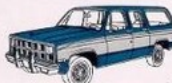
Available Exterior Decor Package