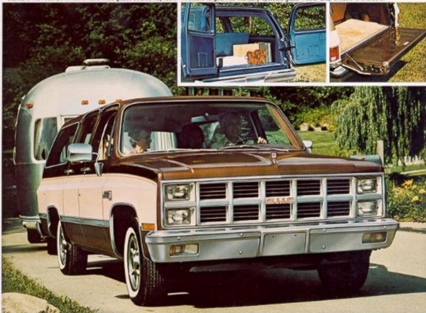
Suburban Sierra Classic with available equipment

Standard rear dual panel doors have fixed glass, outside key lock. Available tailgate has manually operated glass. Power drop window is available.