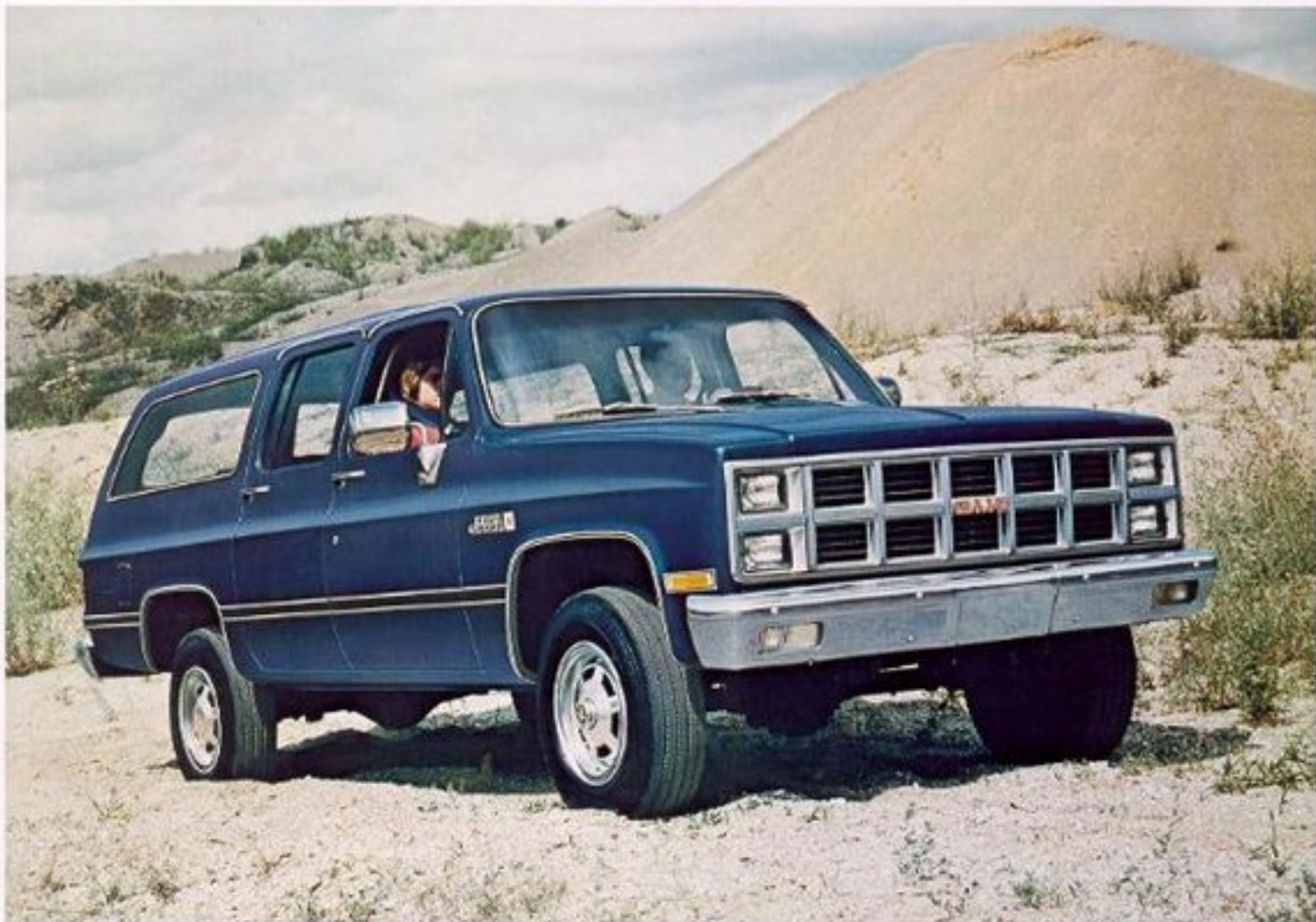
Sierraban 4-WD model with available equipment.