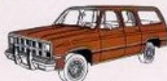
Standard Solid Paint Scheme

ESC—Electronic Spark Control ††Required with diesel engine †††Required with diesel engine (see A53 rear seat) ††††Required with diesel engine and A53 rear seat