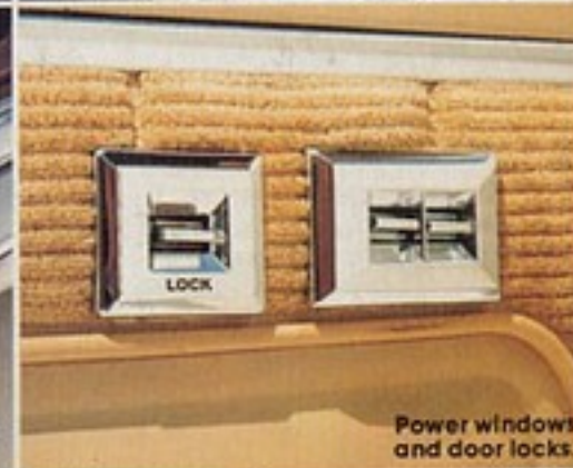
Power windows and door locks.