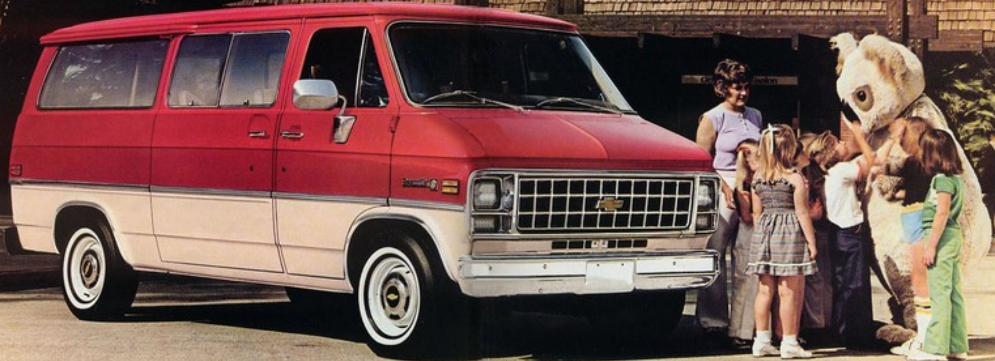
Chevy Beauville Sportvan shown here and on cover.