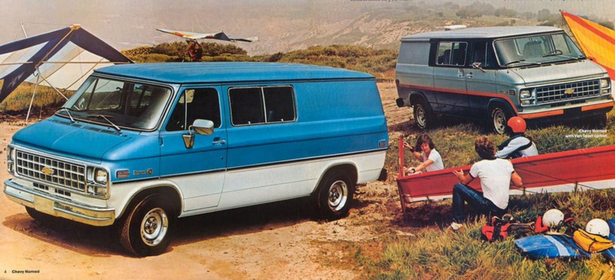
Chevy Nomad with Van Sport color