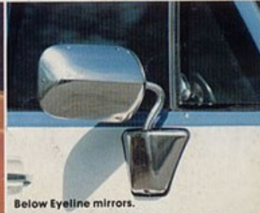
Below Eyeline mirrors.