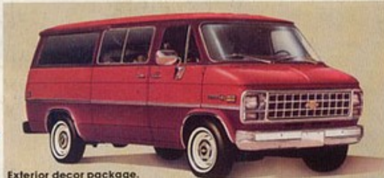
Exterior decor package.