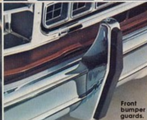
Front bumper guards.