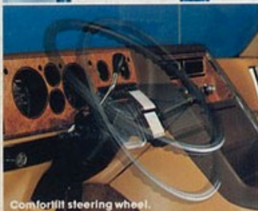
Comfort steering wheel.