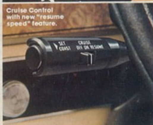
Cruise Control with new "resume speed" feature.