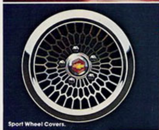
Sport Wheel Covers.