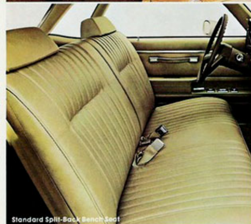
Standard Split-Back Bench Seat