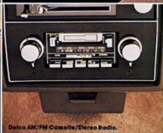
Delco AM/FM Cassette/Stereo Radio.