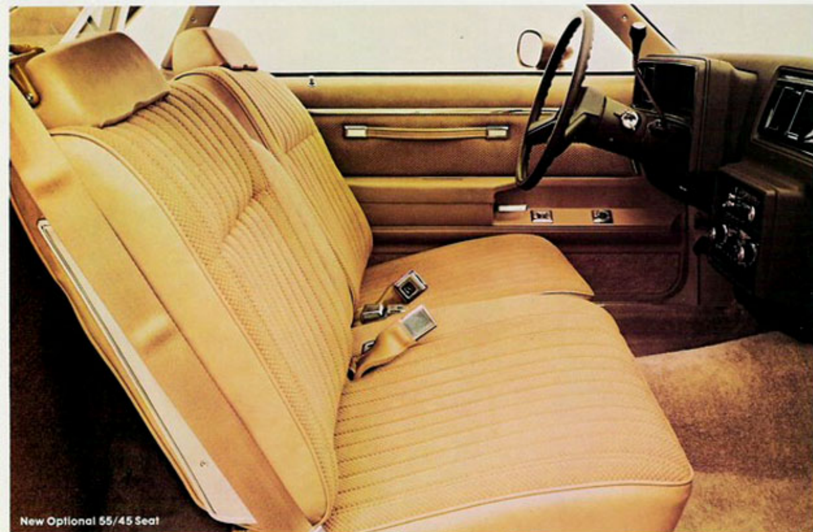
New Optional 55/45 Seat

For 1981 Chevy El Camino's interior elegance has been significantly improved. New, convenient pull straps grace the doors; the seats are trimmed with luxurious fabrics. For your comfort and convenience, power steering is a standard feature. There are three types of seating to choose from (each is available in knit cloth or textured vinyl). The standard full foam cushioned bench seat has a handy split back. For even more style, roomy contoured bucket seats are optional (with or without the center console/integral transmission shift lever). Or you may choose El Camino's brand-new 55/45 split seat option (with 45% of the seat area on the driver's side and a single folding arm rest). Whichever you choose—it'll be a pleasure.