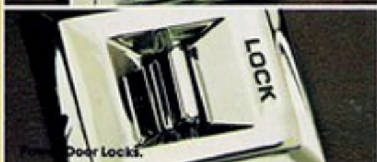
Power Door Locks.