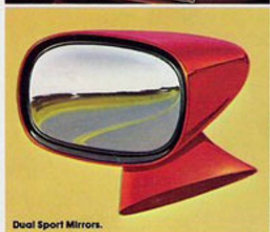
Dual Sport Mirrors.