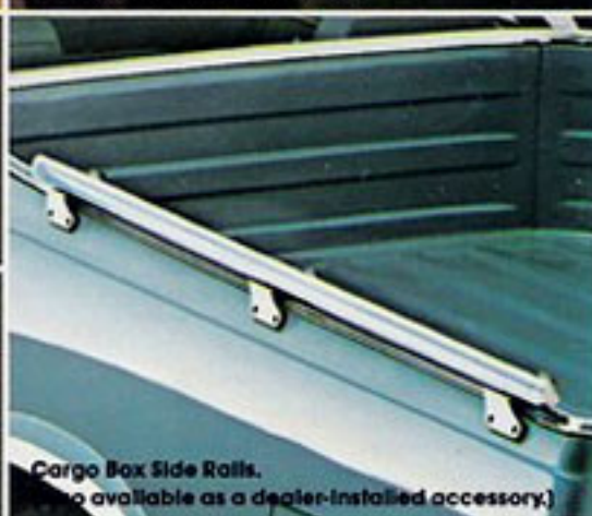
Cargo Box Side Rolls. (Also available as a dealer-installed accessory.)