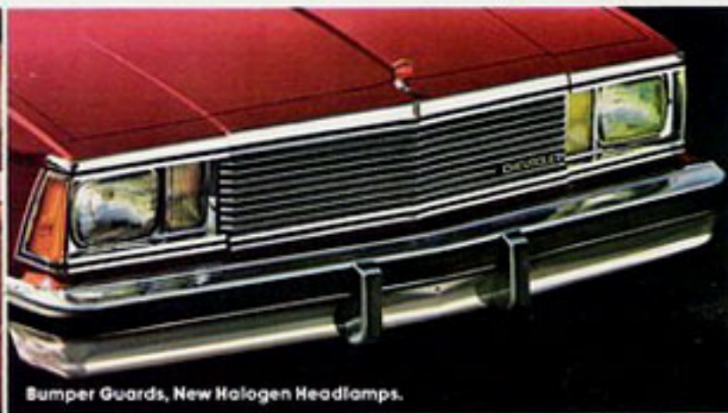
Bumper Guards, New Halogen Headlamps.