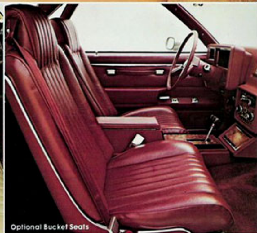
Optional Bucket Seats