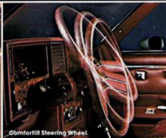
Comfortall Steering Wheel.