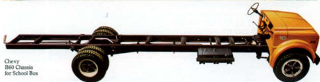
Chevy B60 Chassis for School Bus

A big bus needs a rugged base and Chevy's got it: the B60 chassis. The B60 comes in six available wheelbases — 149," 189," 218," 235," 254" plus there's an extended 274" wheelbase. These chassis will accommodate a wide range of bus bodies available from various manufacturers with capacities up to 72 passengers. Tough ladder-type frames, I-beam front axles and variable-rate springs are significant features of the B60. And for 1981, there's a redesigned cowl with the vent eliminated to help eliminate a source of water leaks into the body.