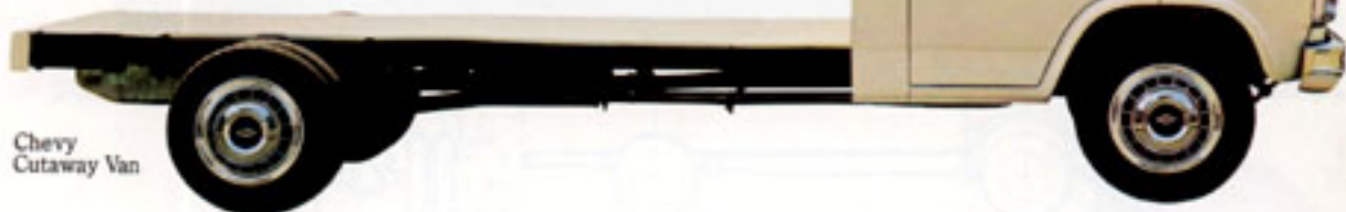
Chevy Cutaway Van

Chevy cutaway van chassis model CG31303 with a 125" wheelbase is available for small bus applications by specifying School Bus Chassis Equipment Option B3D and using compact, specially designed bus bodies which are adaptable to the chassis. This vehicle can be completed to accommodate up to 20 students or 16 adults. It's available with an 8900-lb. or 10,000-lb. Gross Vehicle Weight Rating.