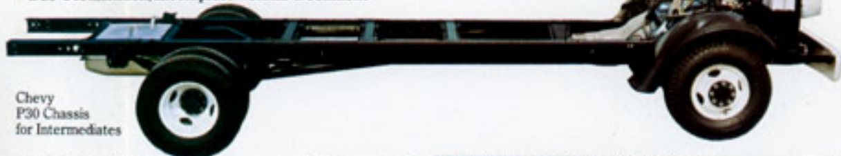
Chevy P30 Chassis for Intermediates