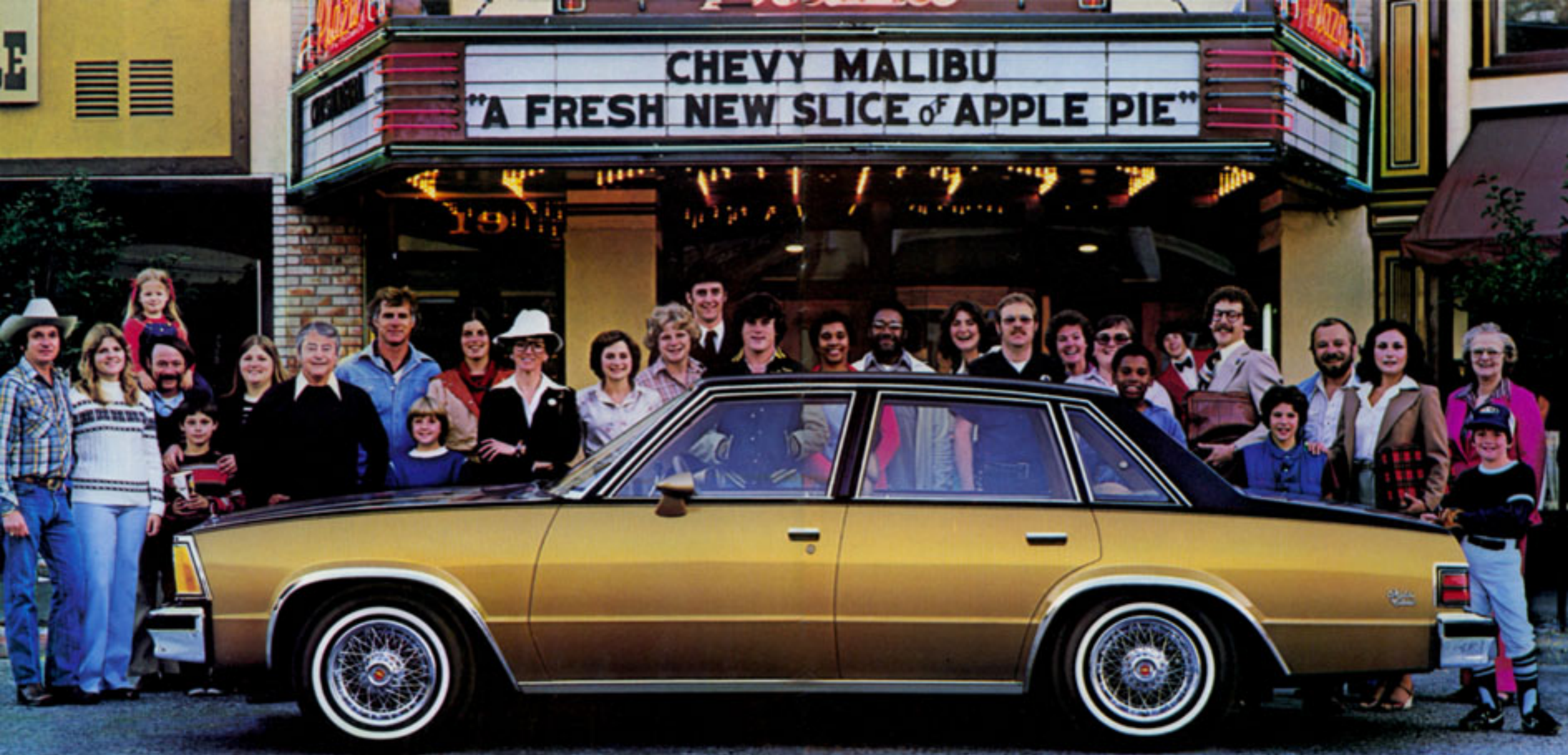
On cover and above, Malibu Classic Sedan shown in available Custom Two-Tone black and lightmetal metallic with available Sport mirrors, bumper rub strips and guards, wire wheel covers, white-stripe tires and other available options.

Room. Looks. Size. Ride. And an incredible amount of value. That's what makes the 1980 Malibu the impressive car it is. And why we say it's got it all.