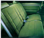
Malibu Classic standard cloth interior shown in green.