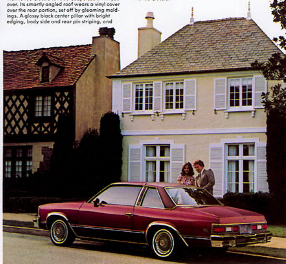
Malibu Classic Landau Coupe shown in dark claret metallic with available electric rear window defogger, Sport mirrors, deluxe body side moldings, bumper rub strips and guards, wire wheel covers and white-stripe tires.

Nice ideas, all, that aptly demonstrate the worth — and pleasure — that can be yours with Malibu Classic.