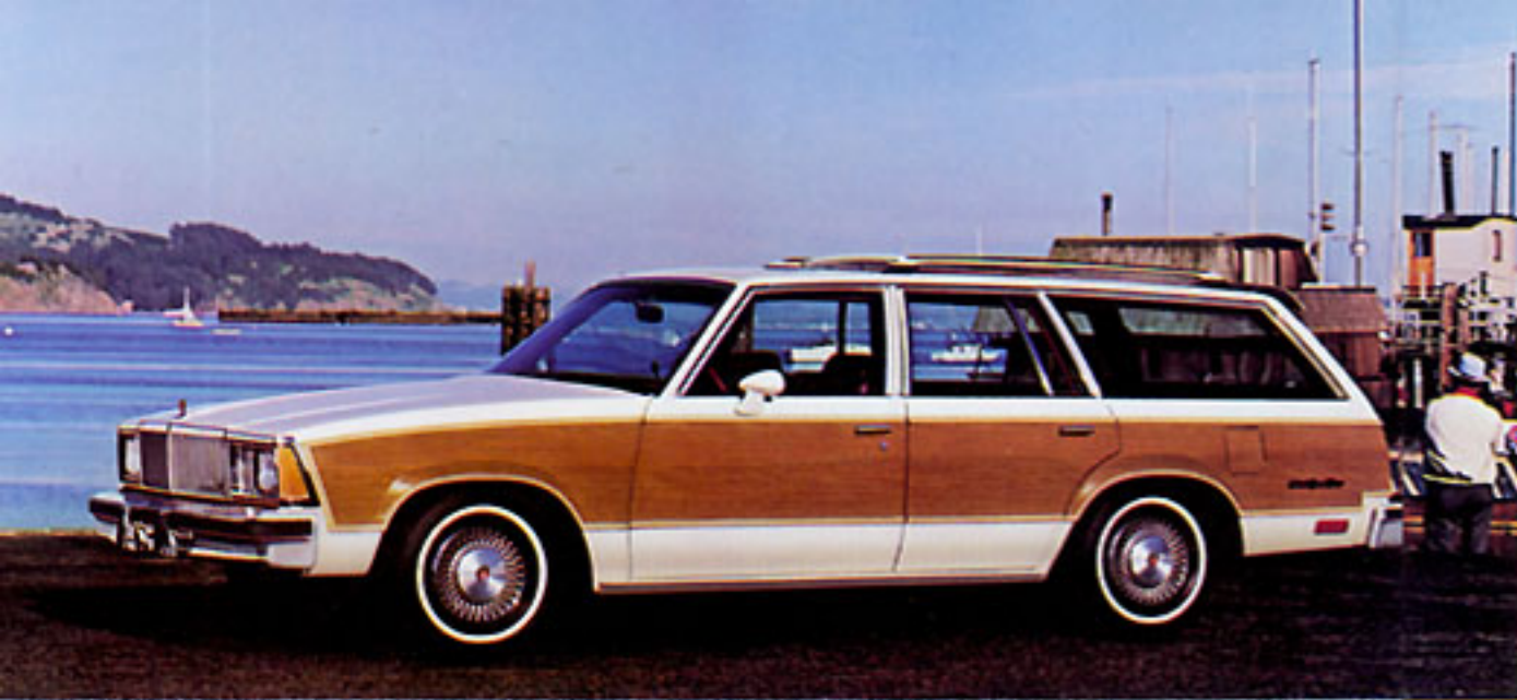
Malibu Classic Wagon shown in white with available Estate equipment, roof carrier, rear window air deflector, electric rear window defogger, tinted glass, Sport mirrors, bumper rub strips and guards and white-stripe tires.