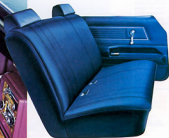
Malibu standard cloth interior shown in dark blue.