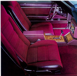
Malibu Classic standard cloth interior shown in claret. Bucket seats and console are among the available options shown.

The Malibu interior, clearly, is an inviting place to spend your road time.