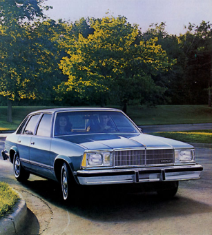
Malibu Sedan shown in light blue metallic with available tinted glass, deluxe body side moldings, wheel opening moldings, bumper rub strips and guards, full wheel covers and white stripe tires.