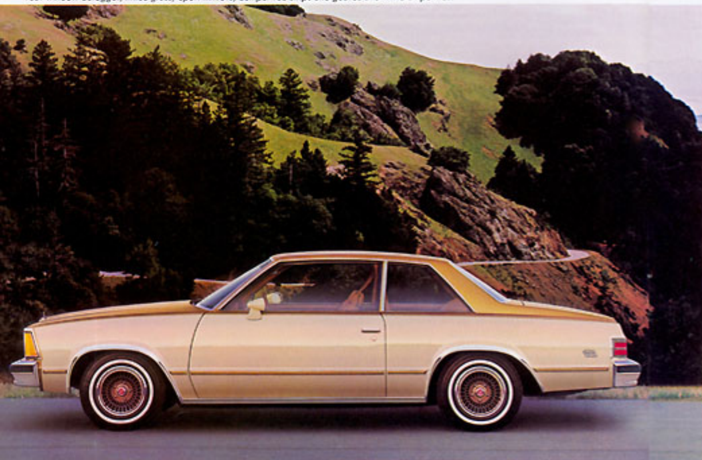
Malibu Classic Sport Coupe shown in available Custom Two-Tone light camel metallic and beige with available Sport mirrors, deluxe body side moldings, bumper rub strips, sport wheel covers and white-stripe tires.