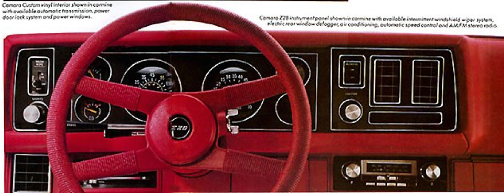
Camaro Z28 instrument panel shown in camino with available intermittent windshield wiper system, electric rear window defogger, air conditioning, automatic speed control and AM/FM stereo radio.