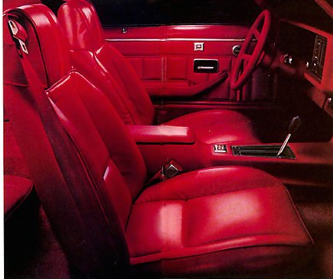
Camaro Custom vinyl interior shown in camino with available automatic transmission, power door lock system and power windows.