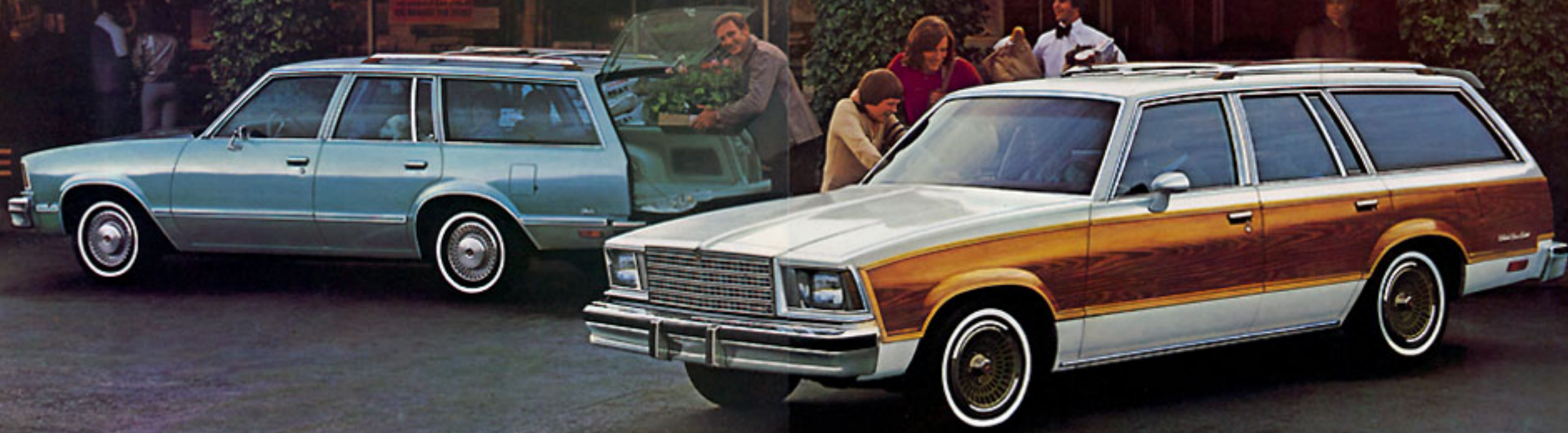
Malibu Station Wagon shown in light blue metallic with available roof carrier, deluxe body side moldings and white stripe tires.