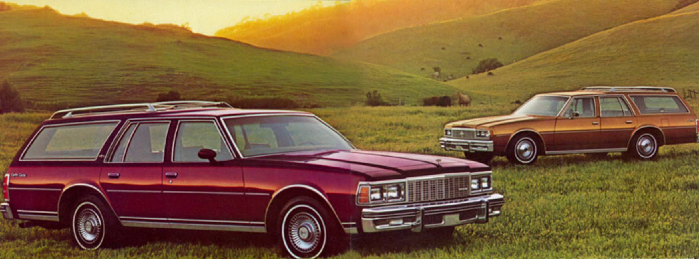
Caprice Classic Station Wagon shown in available dark camrine and camrine metallics with available roof carrier, sport mirror, body side moldings, tinted glass, white stripe tires, bumper rub strips and guards.