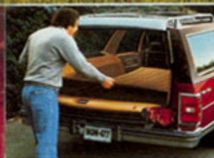
87 cu. ft. capacity. 28 7-inch-high by 48 2-inch-wide opening into an 87-cubic-foot cargo area with the rear seat down. There are four feet between wheelhousings and a 7.6-foot floor length with the rear seats down.