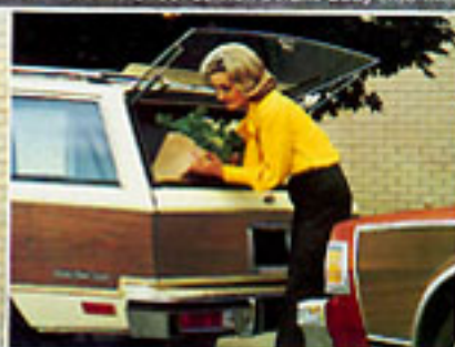
Independent top window. Use the top window independently. It swings up on gas cylinder-assisted hinges to allow easy access. Especially helpful in tight parking places.