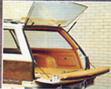
Versatile hatchgate. First, the top window half comes up like a hatchback. The bottom gate drops down to give you wide-open access to the cargo area.