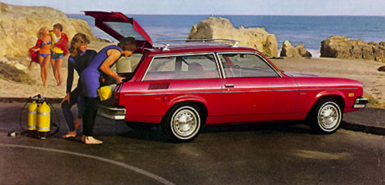
Monza Station Wagon shown in red with available roof carrier.