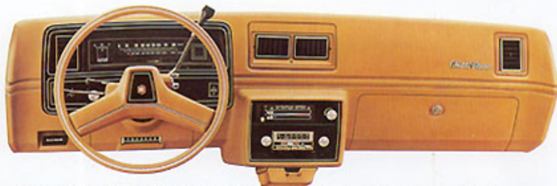
Malibu Classic instrument panel with available air conditioning, Delco AM/FM radio, rear window defogger control and intermittent windshield wiper system.

camel. The Malibu Classic offers a selection of optional cloth upholstery in blue, camel or carmine as well as the standard vinyl in black, blue, camel and carmine.