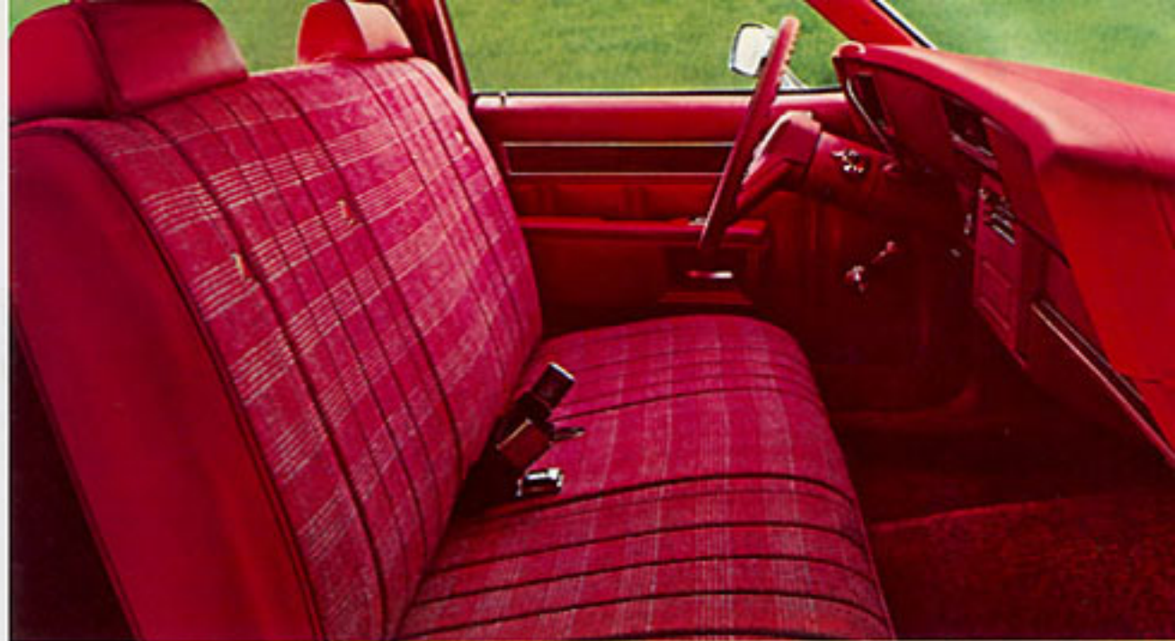
Impala interior shown in carmine with available sport cloth upholstery, power door locks, air conditioning and remote control mirror.