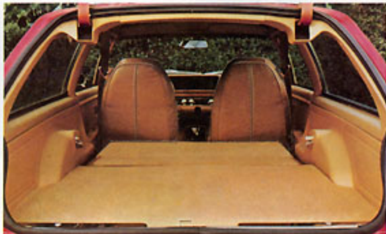
Rear seat folds flat for access to 46.6 cubic feet of cargo space.

It's sporty enough to be named after a race track and sensible enough to be a Chevy.