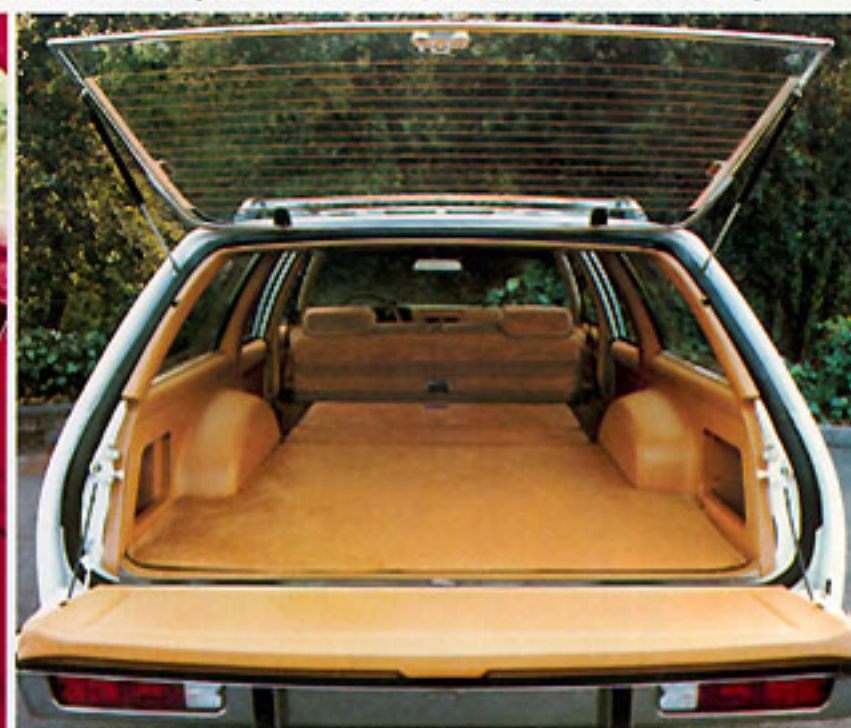
Rear seat folds flat to provide 71.8 cubic feet of usable cargo area for the Malibu Classic and 72.4 cubic feet for the Malibu shown with available roof carrier, deluxe load floor carpeting and electric rear window defogger.