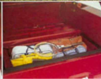
Lockable underfloor storage space. Then there's a much larger lockable area under the rear cargo floor. There are 8 cubic feet in 2-Seat and 4.5 more cubic feet in 3-Seat models.