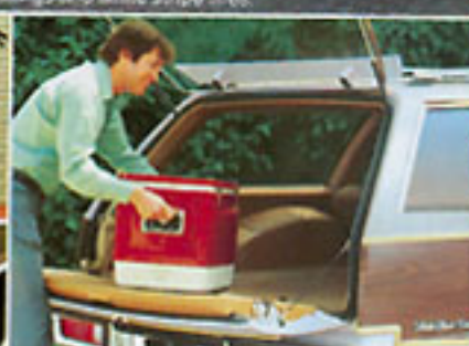
Drop-down bottom gate. You have a full 27.8-inch-high opening into the cargo area. The door-gate provides a 22.7-inch extension to the 81.2-inch-long floor with rear seat down.