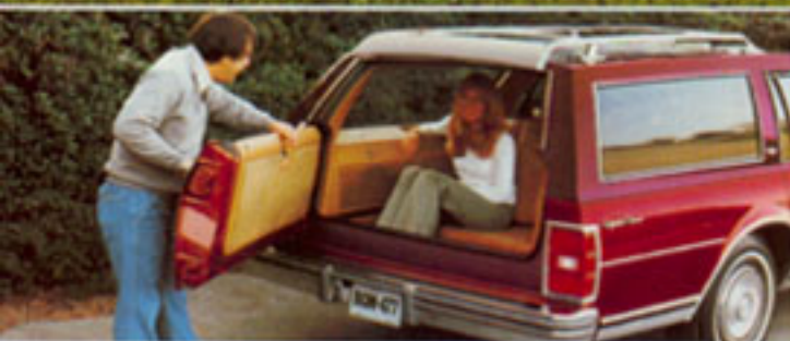
Three-way door-gate. Swings open like a regular door, or the glass slides down for a reach-in window. The rear door also folds down like a tailgate.