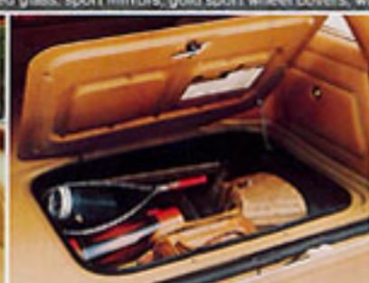
Available Security Package. An available Security Package makes the concealed floor compartment lockable and puts locking doors on the side storage bins.