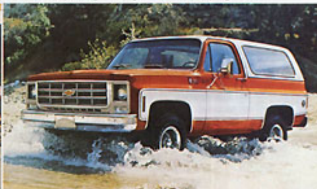
Chevy K10 Blazer shown in special Two-Tone red and white with available Below Eyeline mirrors, Rally wheels, full-time 4-wheel drive.