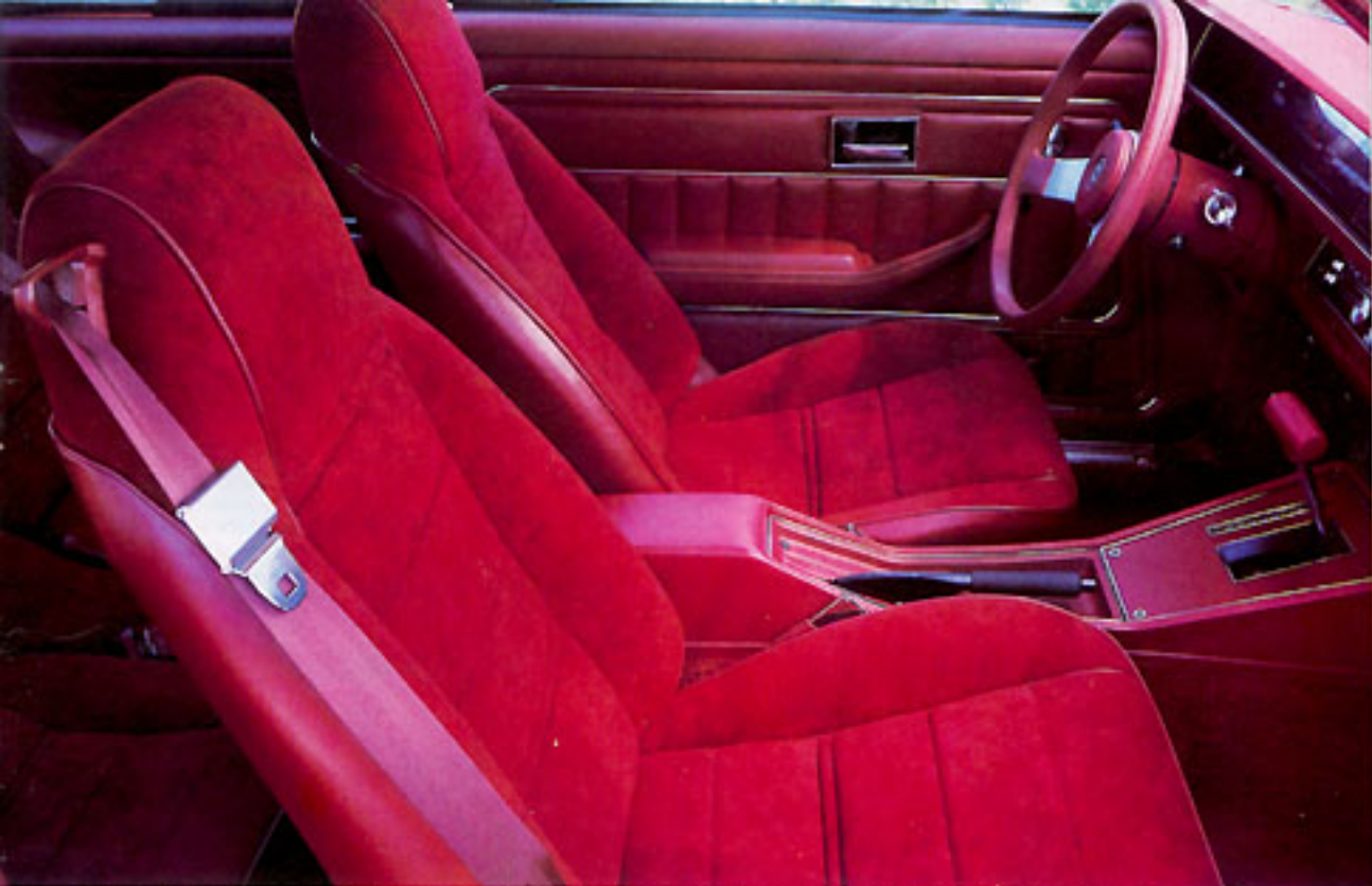
Monza Station Wagon custom interior shown in carmine with available custom cloth upholstery and automatic transmission.