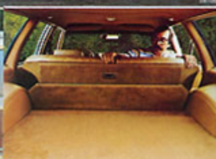
Easy seat conversion. The second seat is a snap. It lowers with the use of a convenient, easy-to-use handle, and all you do is glide it down into the flat position.