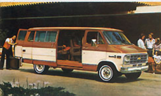
Chevy G20 Sportvan shown in special Two-Tone yellow with available Below Eyeline mirrors and third passenger seat.