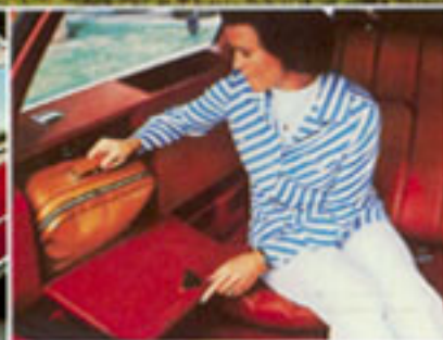
Lockable storage area and utility trays. Left-rear compartment has two cubic feet of secure area. There are also built-in utility trays on rear sides.