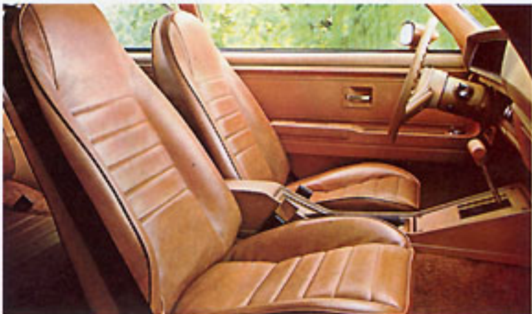
Monza Station Wagon standard vinyl interior shown in camel with available automatic transmission and remote control sport mirror.

If this isn't enough for your kind of Monza, check out the long list of available options on pages 18 and 19 of this brochure. There is everything you might want.