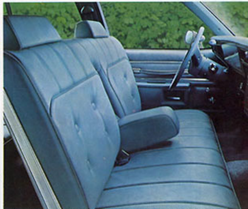
Caprice Classic standard vinyl interior shown in blue with available air conditioning and remote control sport mirror.