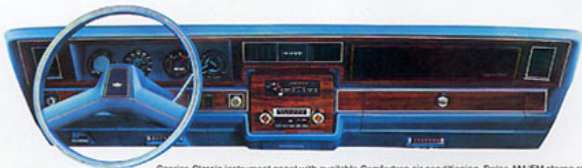
Caprice Classic instrument panel with available Comfortron air conditioning, Delco AM/FM stereo radio, digital clock, Gage Package and rear window defogger control.

dard vinyl upholstery. There's full one-piece cut-pile carpeting under your feet in the passenger compartment. And a formed, soft, one-piece headliner over your head. And a lot more.