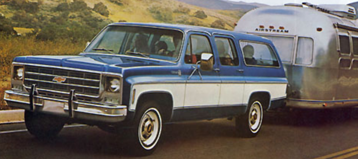
Chevy C20 Suburban shown in special Two-Tone blue with available Below Eyeline mirrors, 9-passenger seating and chromed bumper guards.

Blazers can be ordered with an available three-passenger folding rear seat which increases carrying capacity to five.