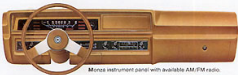
Monza instrument panel with available AM/FM radio.

Monza interiors are designed around full foam-cushioned and body-contoured front bucket seats and the people who sit in them. These are big high-backed buckets that put you in command behind the wheel and put your passenger at ease.