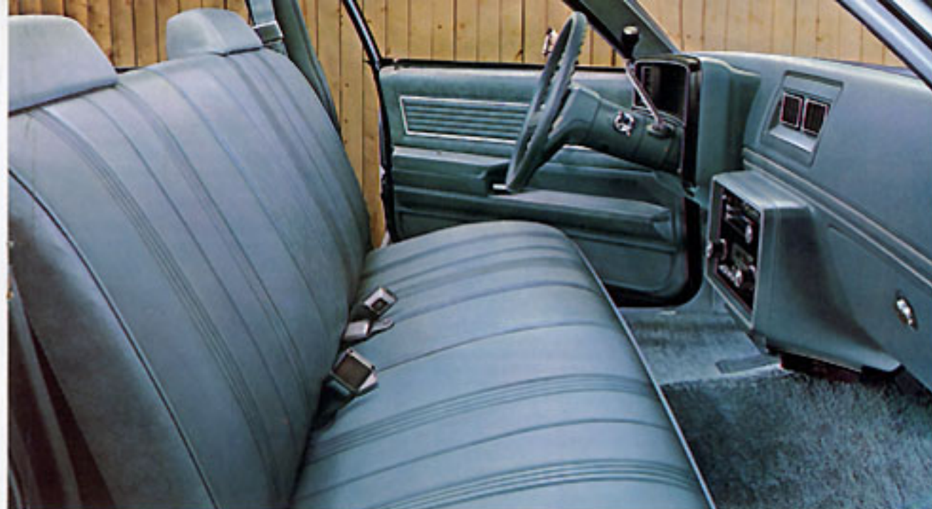
Malibu standard vinyl interior shown in blue with available Deluxe color-keyed seat and shoulder belts, Delco AM/FM radio and air conditioning.