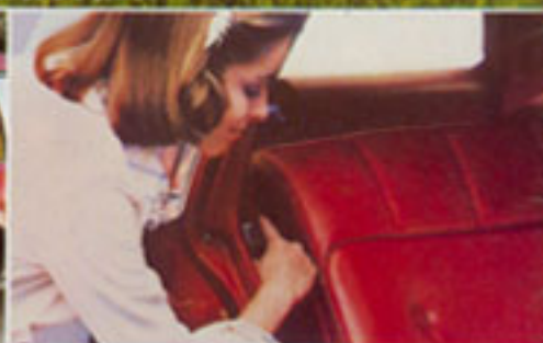
Fingertip seat conversion. Second seat releases at a touch of a button-type latch and you glide it down. A fingertip control in right rear trim area lowers the available third seat.