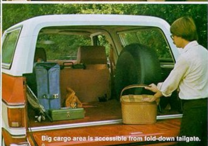
Big cargo area is accessible from fold-down tailgate.

After all sheet metal parts are cleaned and dried, they are primed by immersing the entire body, along with doors and tailgate, in a prime paint emulsion that is electrically charged opposite to the body which coats the metal evenly and completely as it is electromagnetically drawn into the corners and seams of the metal surfaces inside and out. Potentially vulnerable joints are sealed against gathering moisture through the use of sealing compounds. A long-lasting acrylic enamel is used for finish painting. For added protection in certain enclosed areas, an alumi-