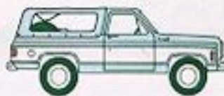
Two-Tone Paint with Available Soft Top

All 1978 Jimmy models include the following General Motors Safety Items as standard equipment. FOR OCCUPANT PROTECTION: Seat belts with push-button buckles at all passenger positions, combination seat and inertia-reel shoulder belts for driver and right front passenger (with reminder light and buzzer), energy absorbing steering column, passenger guard door locks, safety door latches and stamped