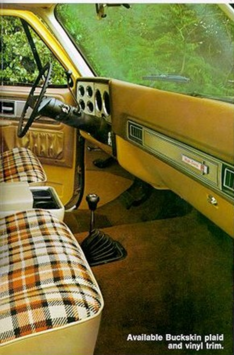
Available Buckskin plaid and vinyl trim.

driving conditions change. All 4-wheel drive controls are conveniently located inside the cab. With Jimmy's full-time system there's a combination of balanced traction and driving power delivered to both axles that lets you operate on paved and unpaved roads under varying conditions and off road as well — all without having to change back and forth between 2-wheel and 4-wheel drive.