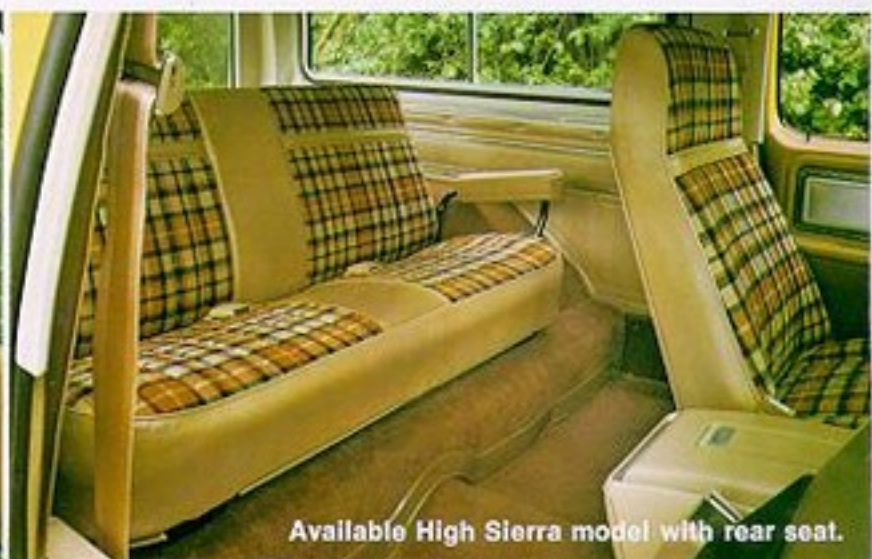
Available High Sierra model with rear seat.