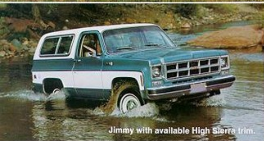
Jimmy with available High Sierra trim.