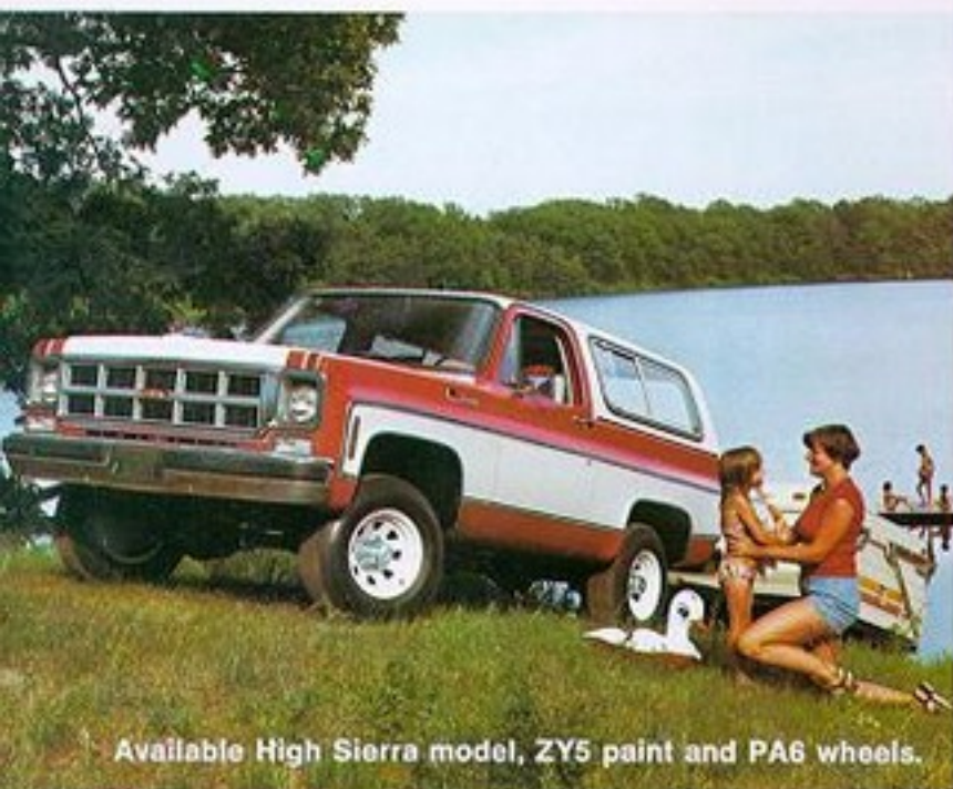
Available High Sierra model, ZY5 paint and PA6 wheels.

interior, shown below, includes new high back bucket-type seats in handsome Saddle custom cloth and vinyl trim. (All-vinyl open high-grain trim also is available.) Both custom cloth and vinyl and all-vinyl seats come in Blue, Buckskin and Red colors with Red being a new offering for the cloth and vinyl trim. Mandarin Orange is also available for the all-vinyl trim. The wall-to-wall floor covering is color keyed and extends to the rear, including wheelhousings, when the new available fold-up rear passenger seat is ordered.