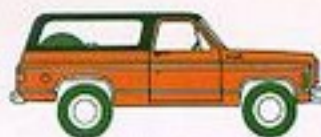
Solid Paint with Black Hardtop