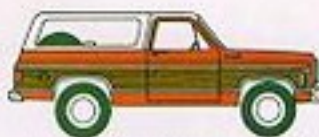
Available Wood-grain Trim