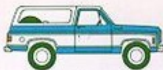
Two-Tone Paint with White Hardtop