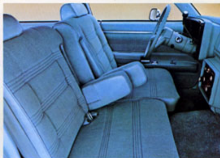
Malibu Classic interior with available 50/50 front seat with dual fold-down armrests.

A new power operated steel Sky Roof is also available to let the sun shine in on all Malibu Coupes this year (slightly reduces headroom).