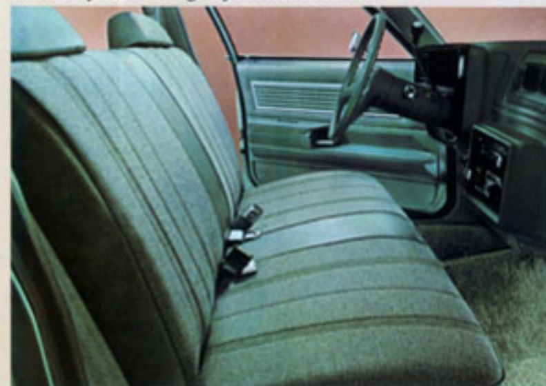
Standard Malibu interior with cloth upholstery.

an impressive ride and greater manageability in city traffic. To provide inside comfort, Malibu features new shell-type seat design and forced air ventilation. Soft cloth bench seats are offered in black, blue, green or camel (coupes and sedans only). A one-piece carpet covers the entire floor. The headlight dimmer switch has been relocated on the directional signal lever. There are 14 paint colors to choose from and five available Custom Two-Tone combinations. You can also add an available vinyl roof in your choice of seven colors. Your Chevy dealer can give you all the details.