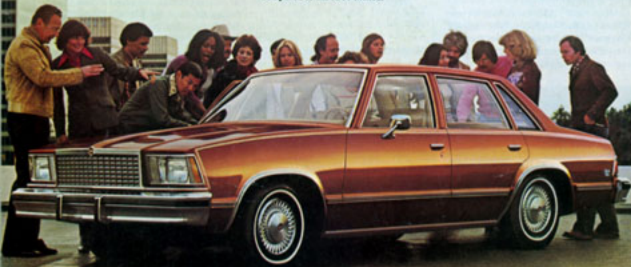
Malibu Classic 4-Door Sedan.