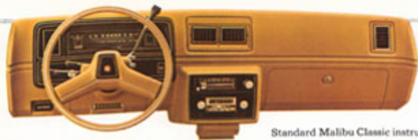
Standard Malibu Classic instrument panel.

That sense of room and luxury in the new-size Malibu is not an illusion. There are important gains in head, knee and leg room in both Coupes and Sedans over last year's mid-size Malibu. And the luxury is self-evident. You are surrounded by picture windows. A new one-piece carpet is below your feet; a new one-piece headliner is above your head. You sit in comfort on newly designed shell seats. A sense of quiet surrounds you. It's a comfortable and comforting place to be.