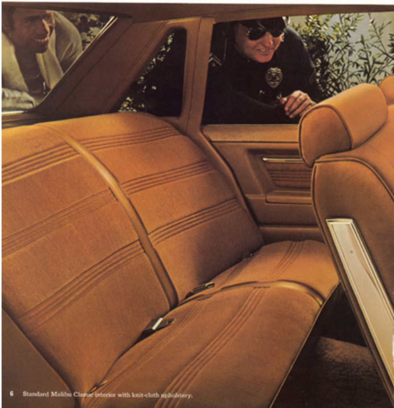
6 Standard Malibu Classic interior with knit-cloth upholstery.