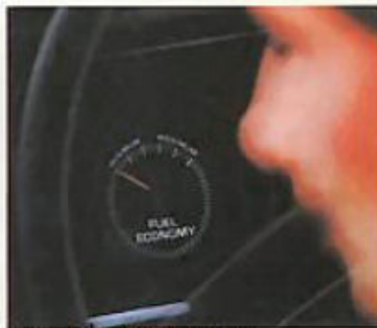
Econominder Gauge Package.