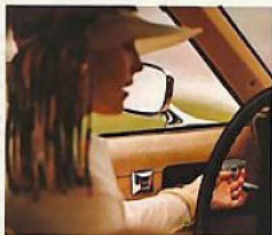
Remote-control outside rearview mirror.