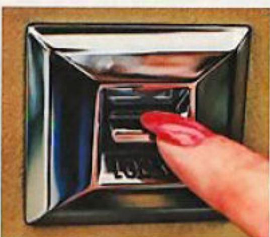
Power door lock system.