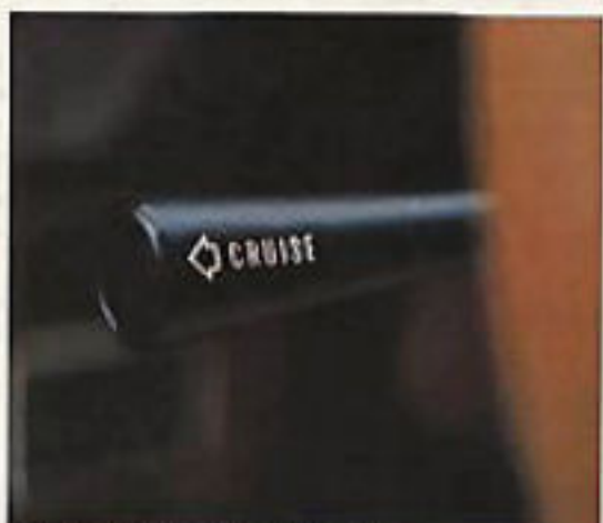
Cruise-Master speed control.