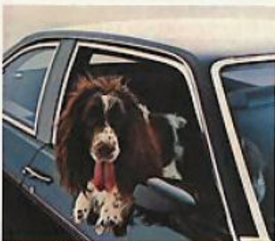
Exterior Decor Package.