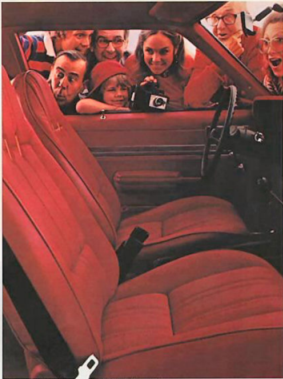
Custom vinyl bucket seat interior and available console.

Chevrolet offers a wide selection of available options to personalize your new Nova. Availability often depends on the model and other equipment selected. Your Chevrolet dealer can answer any questions.