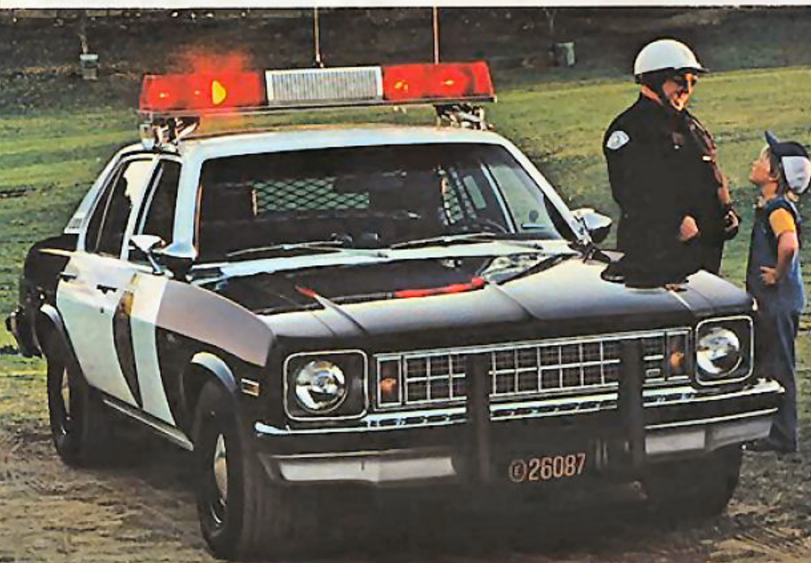
Nova 4-Door Sedan with special police equipment.