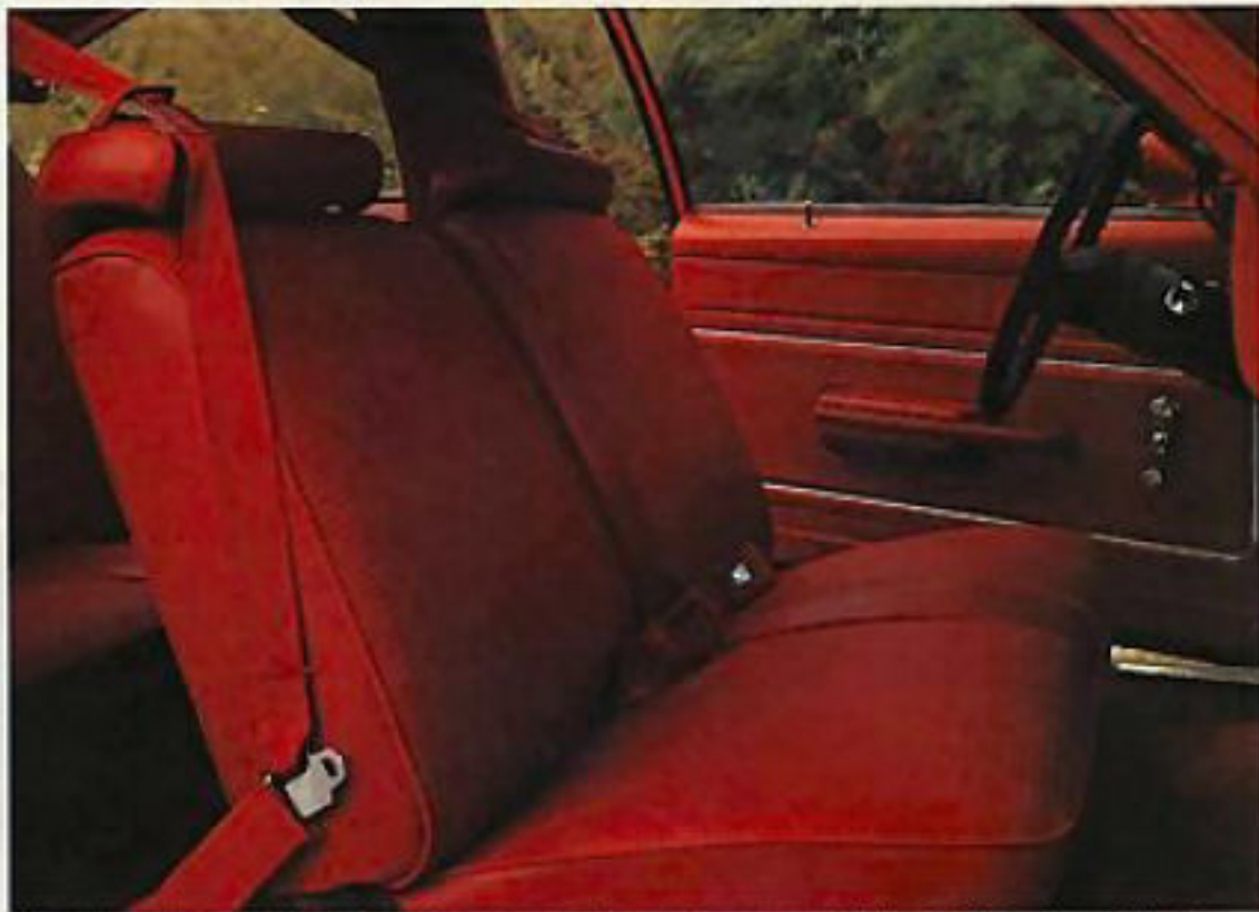
Nova's interior features standard all-vinyl trim, as shown, or available plaid cloth-and-vinyl.