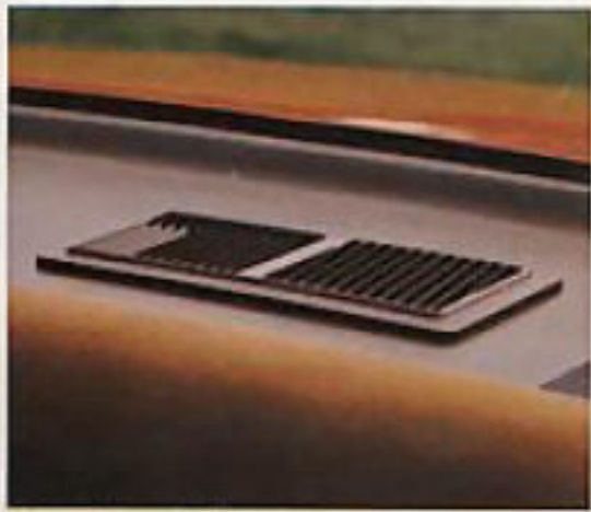
Rear window defogger.