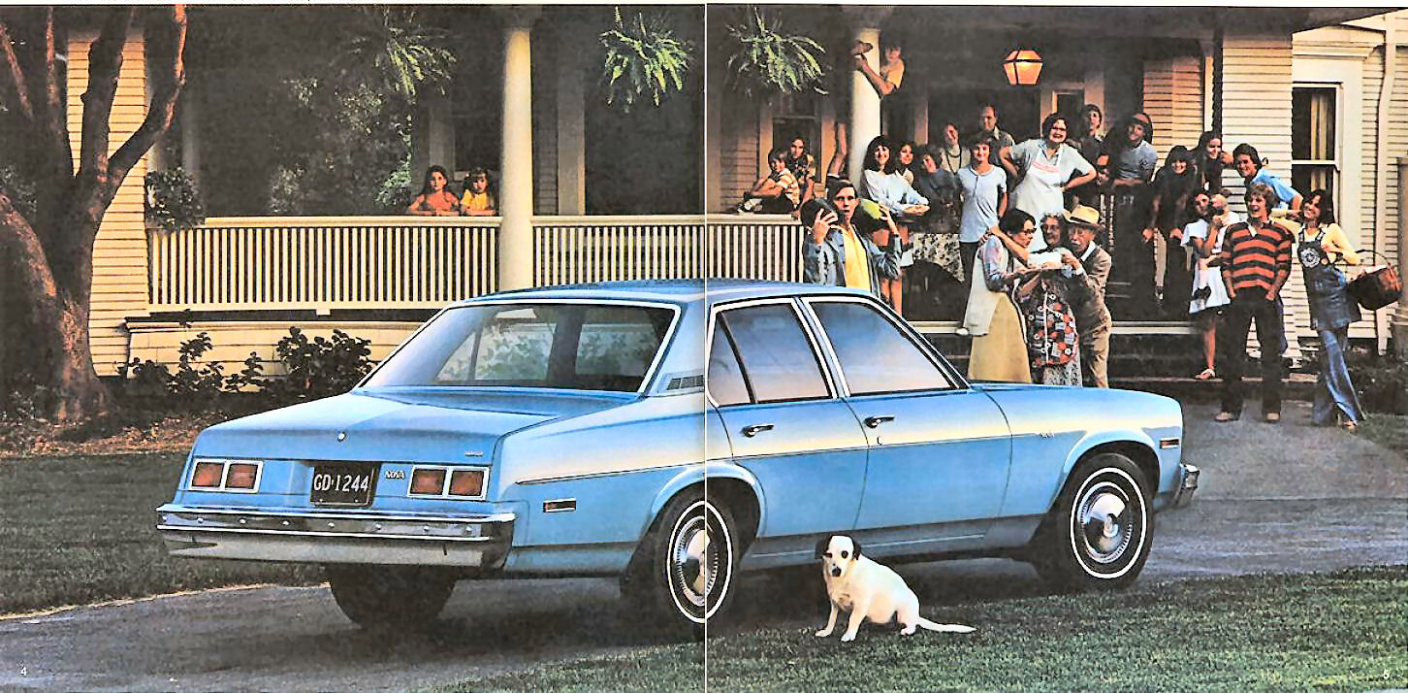
Nova 4-Door Sedan. Shown with available Exterior Decor, wheel strip trim and full wheel covers.