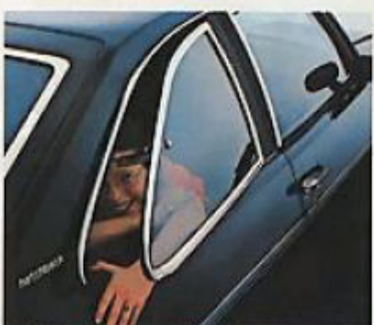
Swing-out rear side windows.