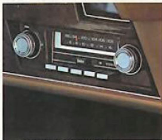
Delco-GM AM/FM stereo radio.