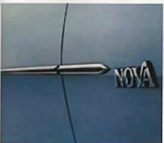
Body side molding.