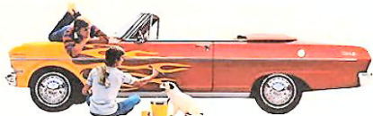
1972 Nova Convertible.

In fact, we've made improvements in virtually every single area of the car. To bring you 15 years of thinking and refining that none of Nova's current competitors can offer.