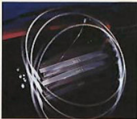
Comfortilt steering wheel.