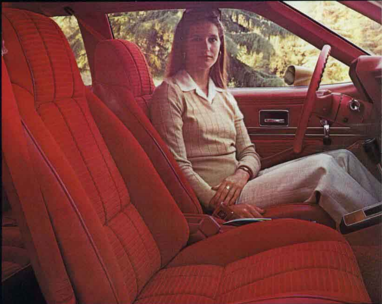
Special Custom Interior. Available for 2+2. Also for Towne Coupe with Sport Equipment.