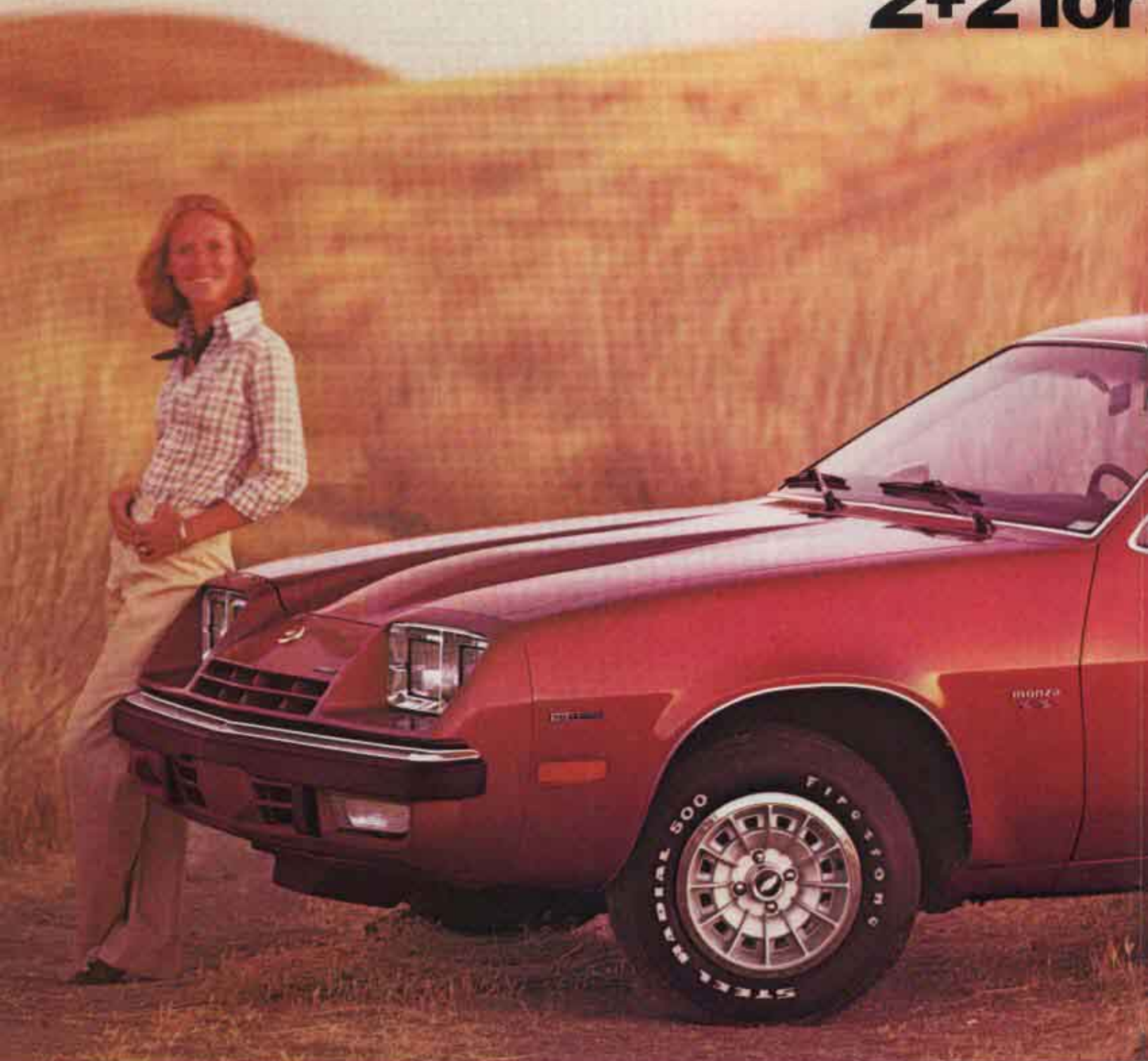
Monza 2+2 Hatchback. Shown with available tinted glass, 5.0-litre V8, white lettered tires and wheel opening moldings.

You can think the 55-mph speed limit lessens the pure joy of driving, or you can think Monza 2+2. Think Monza. Because sheer speed isn't what puts the joy in driving. It's precision, aerodynamics, romance, confidence. The Chevy Monza 2+2. For the road.