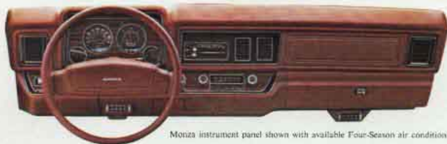
Monza instrument panel shown with available Four-Season air conditioning, AM/FM radio and electric clock.

When you judge a car for value, you have to consider what you get as standard equipment. For 1977, Monza offers a good long list.