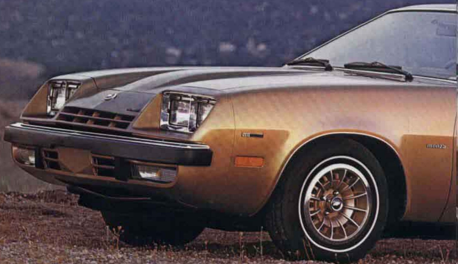
Monza Towne Coupe. Shown with available Sport Equipment, Sport Front End Appearance, 5.0-litre V8, white stripe tires and wheel

There are two kinds of driving: just plain getting-where-you're-going driving, and Monza Towne Coupe driving. You'll know the difference. A Monza Towne Coupe works with the road. It gives you a feeling of excitement that the getting-where-you're-going driving doesn't give you. It's got smart, sporty styling that says a lot about Monza's character, and yours.