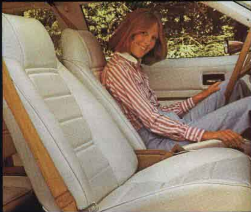
2+2 available knit cloth. Also for Towne Coupe with Sport Equipment.