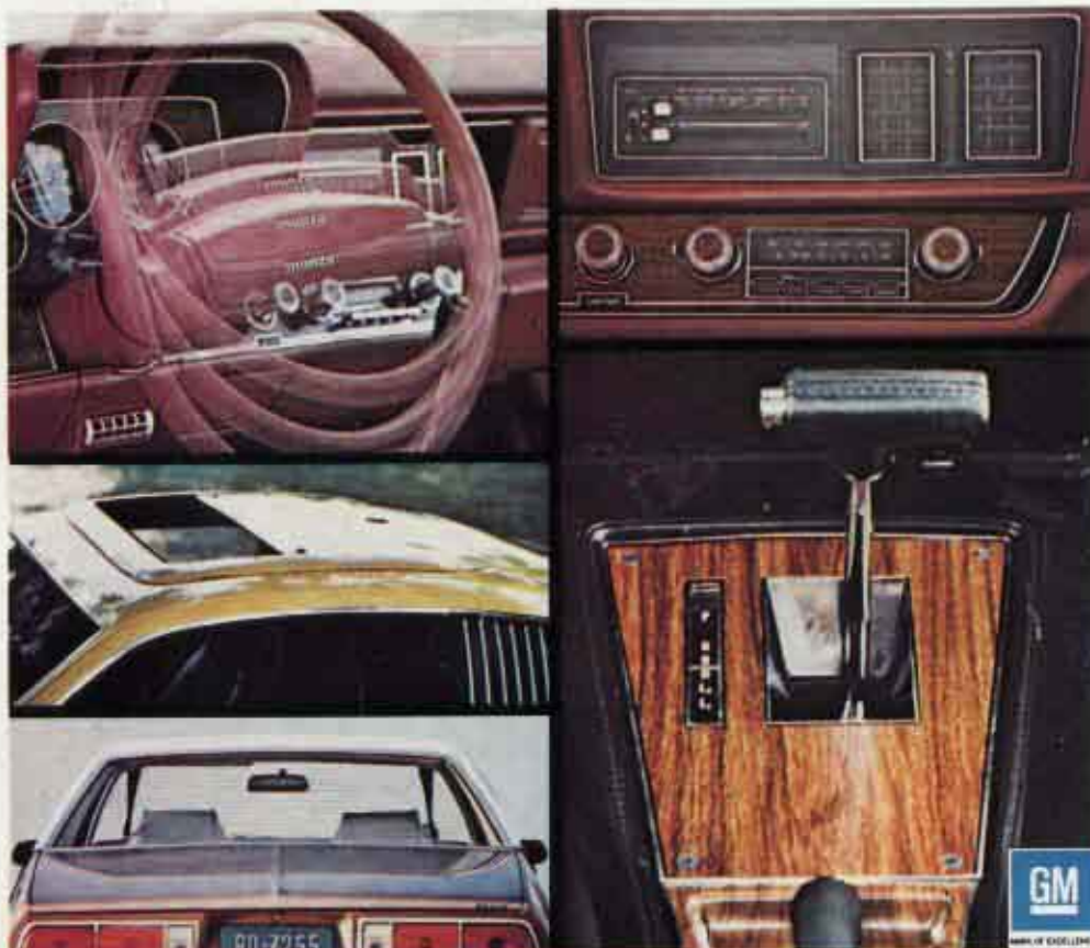
Illustrated: Comfortilt steering wheel, Sky Roof, Electro-Clear defogger, Four-Season air conditioning, AM/FM radio, full center console with Turbo Hydra-matic transmission.