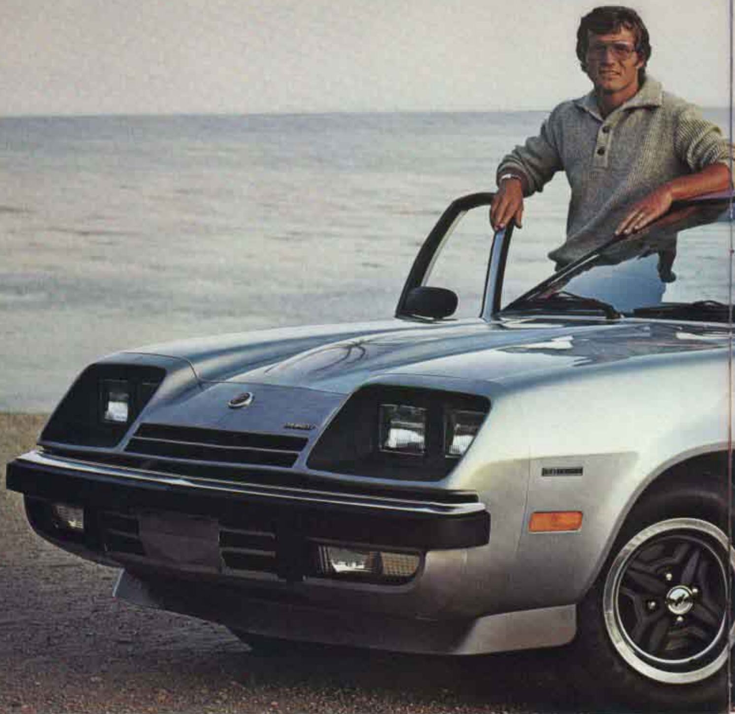
Monza 2+2 Hatchback. Shown with available Spyder Appearance Package and 5.0-litre V8.

What do you do when you've got just about the sportiest car on the road? You make it sportier. You Spyder it up for all the world to see. So show the world your Monza Spyder 2+2 Hatchback. Because the only way it could be any sportier would be to have you behind the wheel.