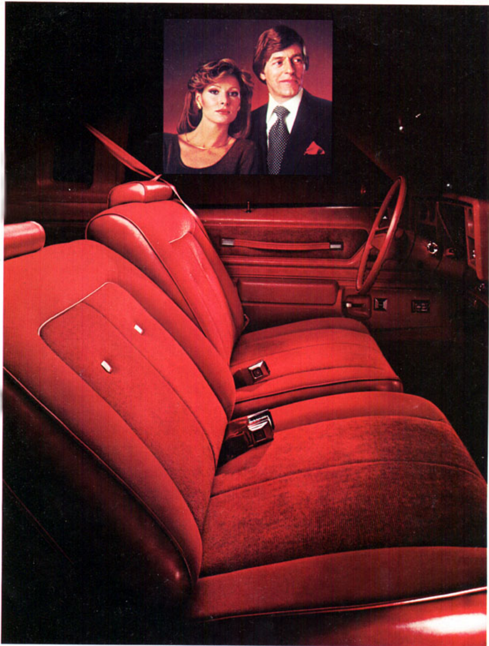
A generous measure of beauty and comfort distinguish Monte Carlo's available Special Custom Interior with reclining passenger seat.