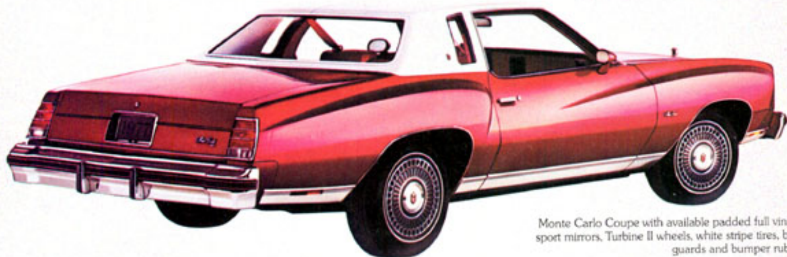
Monte Carlo Coupe with available padded full vinyl roof, sport mirrors, Turbine II wheels, white stripe tires, bumper guards and bumper rub strips.