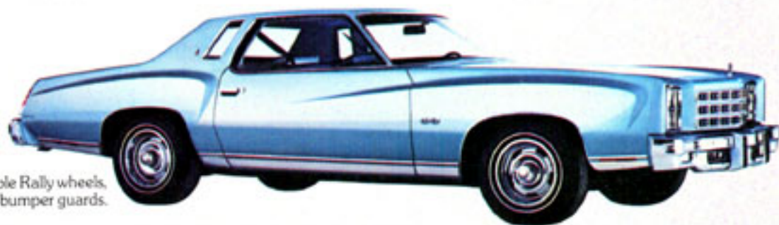
Monte Carlo Coupe with available Rally wheels, white stripe tires and bumper guards.

Cruise-Master speed control maintains a pre-selected speed, disengages by light touch on brake; excellent for long highway drives • Intermittent windshield wiper system for use in light rain or mist • Wiper action at speed set by driver • Econominder Gauge Package tells when car is running in economical range. Includes engine temperature gauge and voltmeter • Positraction rear axle supplies power to wheel with most traction for use in snow or mud • Heavy-duty suspension, front and rear, has special rate springs and shock absorbers for hauling heavy loads; required for trailering • Heavy-duty battery • Heavy-duty Delcotron generator, 61 amp • Heavy-duty radiator.