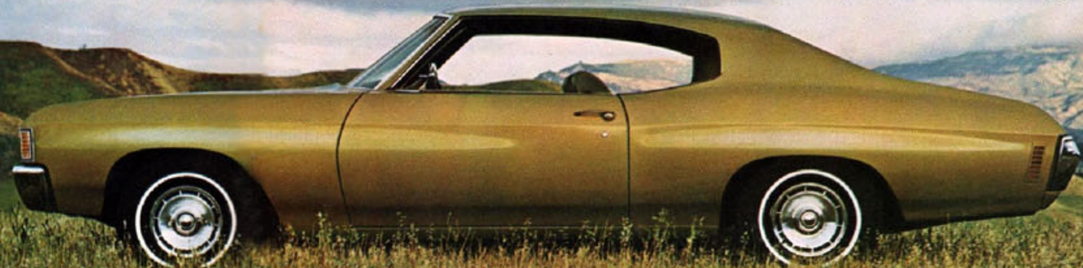
Chevelle Sport Coupe