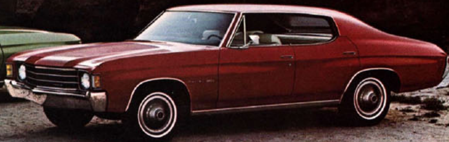
Malibu Sport Sedan