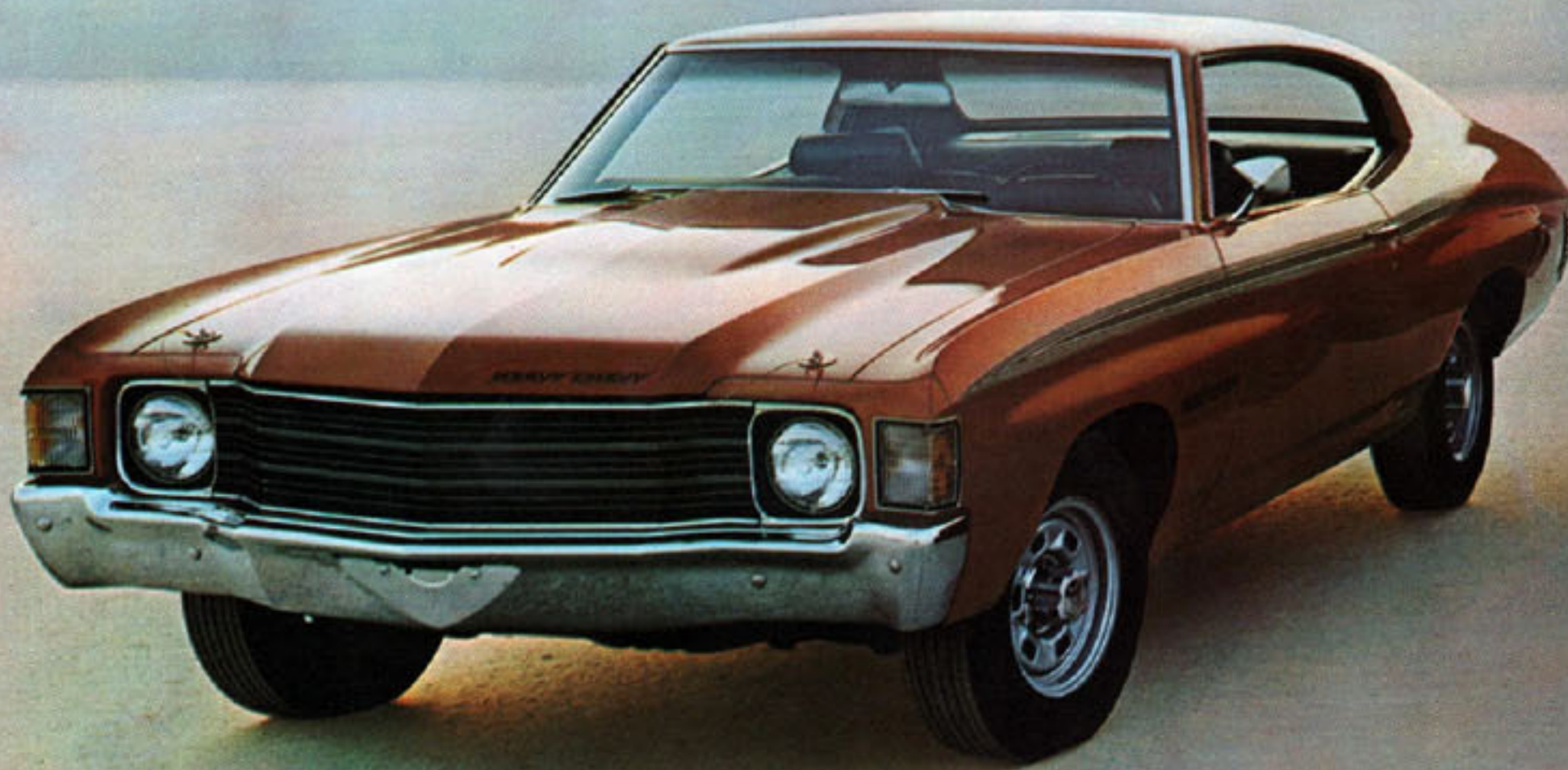
Heavy Chevy Sport Coupe

All Chevilles with SS on the fender come with power disc/drum brakes, a black grille, a special domed hood with lock pins; a left-hand remote control sport mirror (that, you'll really like), 15" x 7" Sport Wheels and white-lettered F60 x 15 tires to grip the road. You can order things on SS that you can't get on any other mid-size car, like the Turbo-Jet 454 engine. If you're SS prone you already know that. But talk to your salesman. Look at the long list of available equipment. He can help you put it all together.