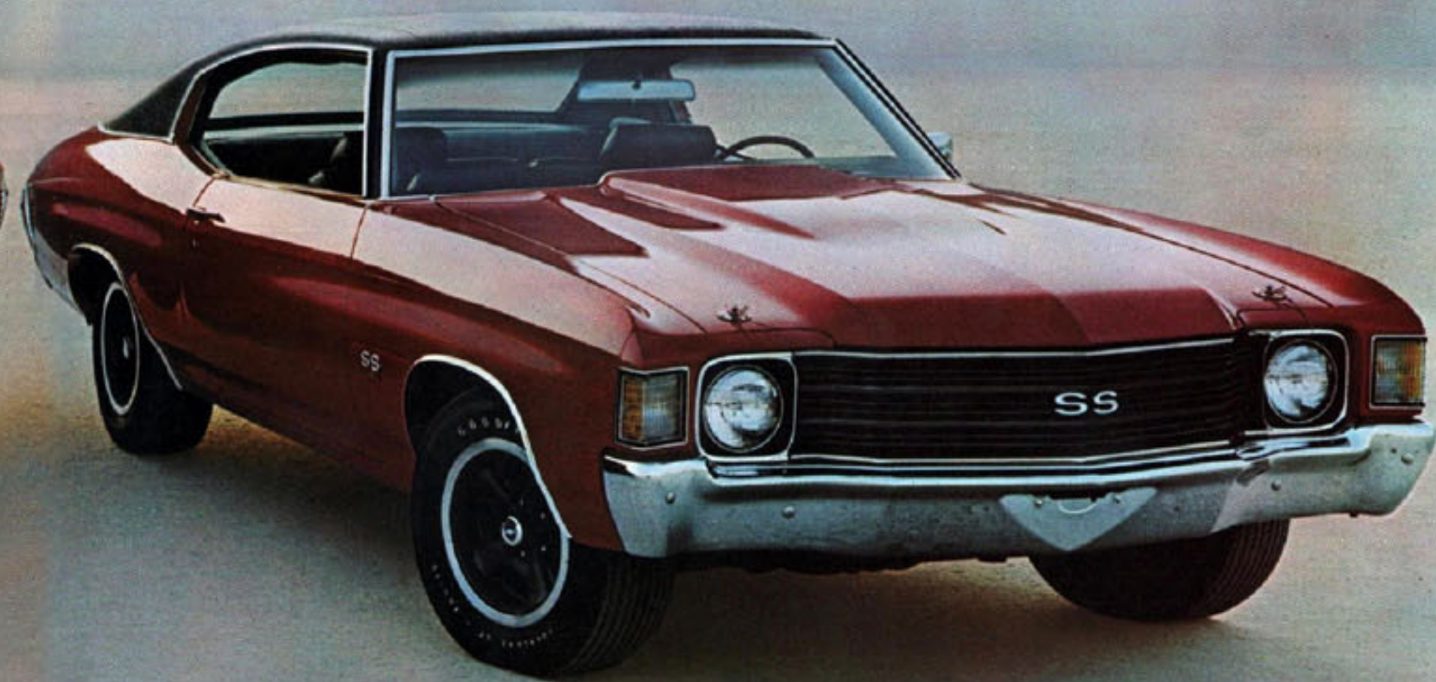
SS Sport Coupe