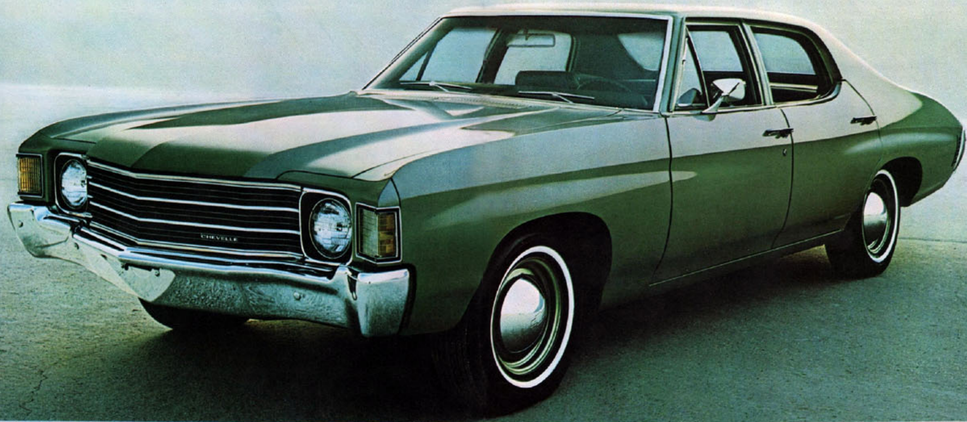
Chevelle 4-Door Sedan

see the side-terminal battery. It resists corrosion, makes sure power isn't wasted. And if you look under the fender, you'll see inner fenders to protect the outer ones from salt and slush and dirt. Open the trunk and you'll find more than 12 cubic feet of cargo space, and that's big. Look at the price on the sticker in the window, and that's small.