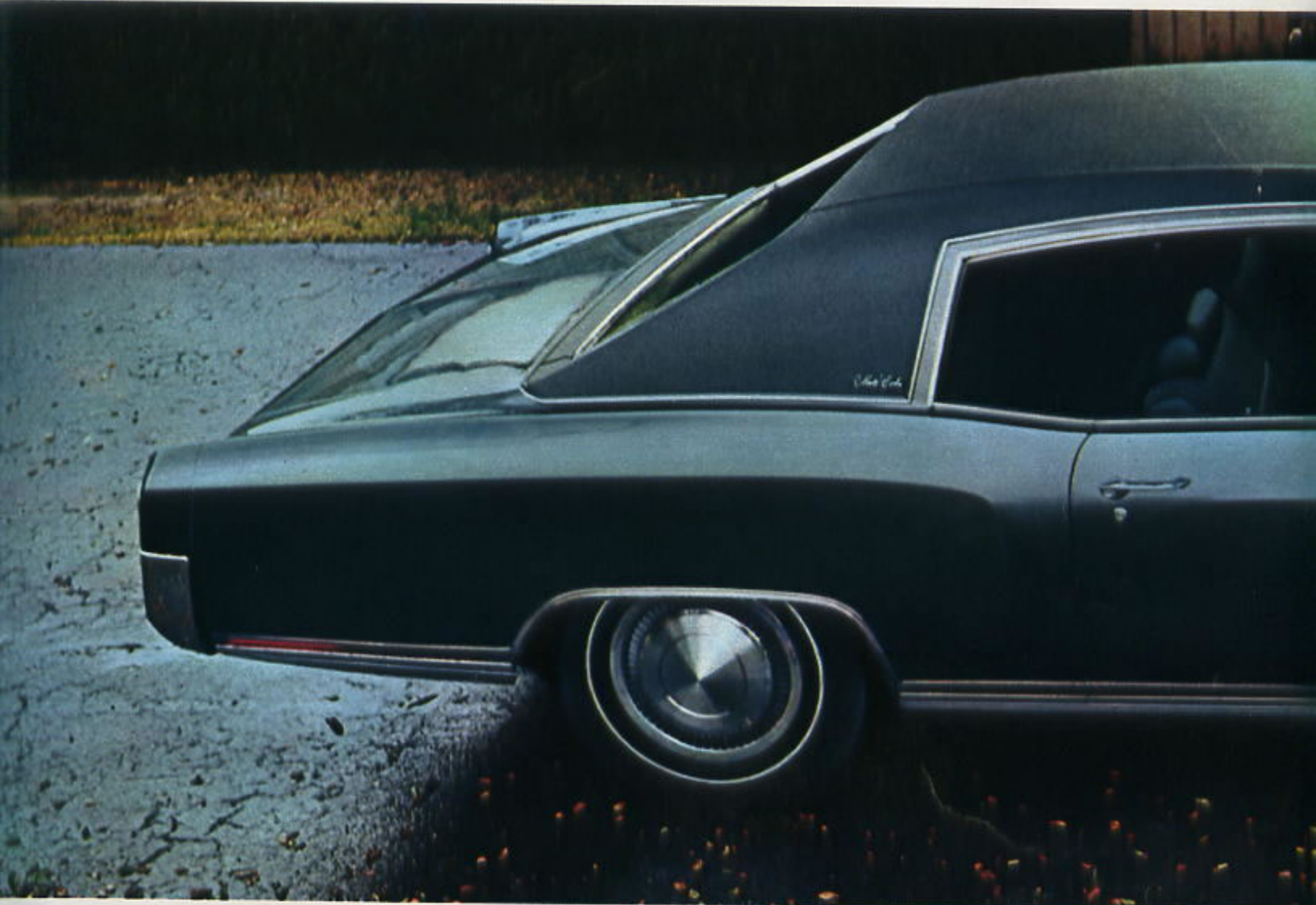
Monte Carlo SS Coupe

Easy-care features. As in all Chevrolets, a collection of easy-care features are incorporated into the Monte Carlo design. Like a long-life exhaust system. Flush-and-dry rocker panels and inner fenders at all wheel wells to inhibit rust and corrosion at particularly vulnerable exterior surfaces.