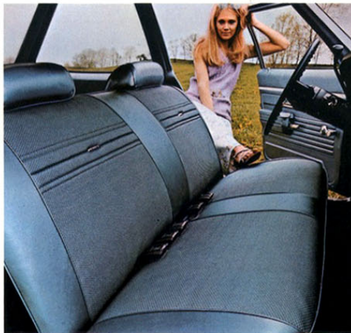
Brookwood all-vinyl interior