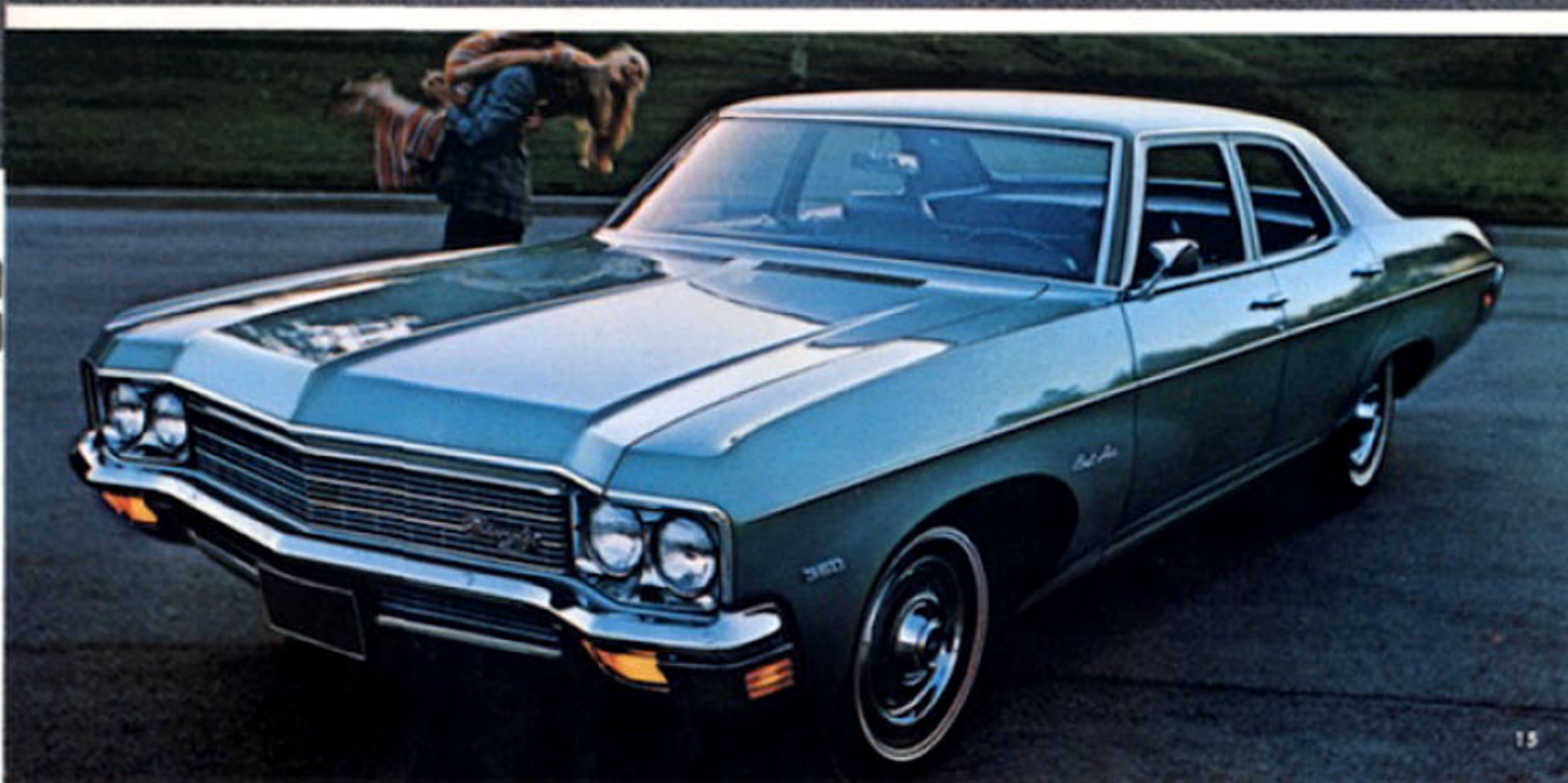
Bel Air 4-Door Sedan

The Bel Air Sport Coupe is all new for 1970. A stylish 2-Door Sport Coupe at a modest price.