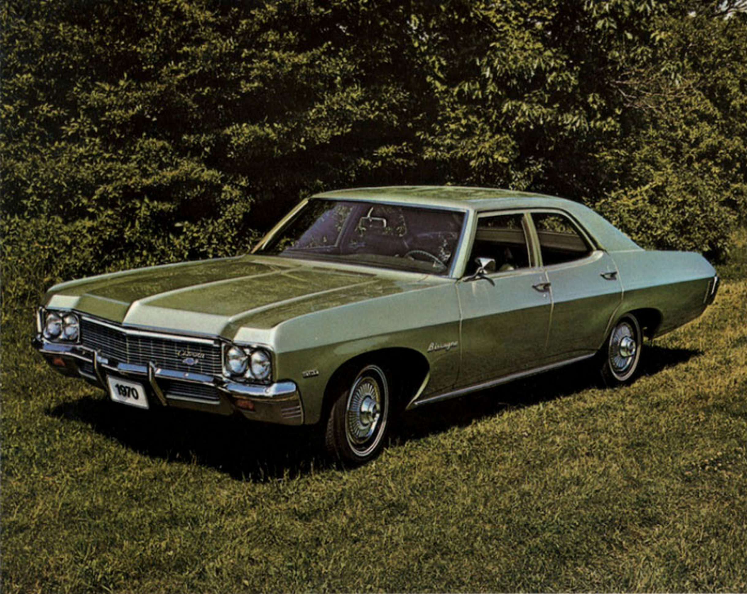
Biscayne 4-Door Sedan