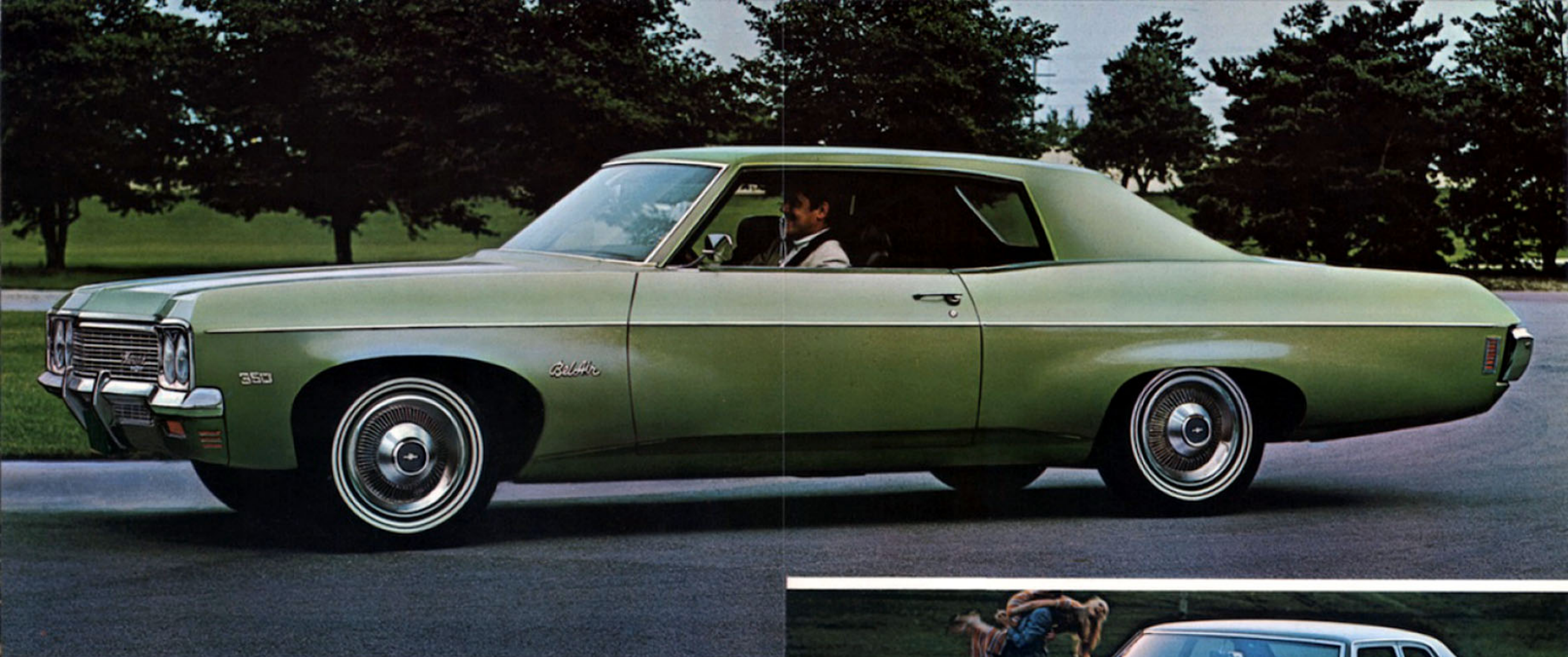
Bel Air Sport Coupe

Some of the equipment illustrated is optional at extra cost.