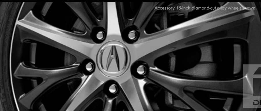
Accessory 18-inch diamond-cut alloy wheels shown.

The redesigned ILX comes with standard Jewel Eye LED headlights and LED taillights—an aggressive style to match the confidence you feel behind the wheel.