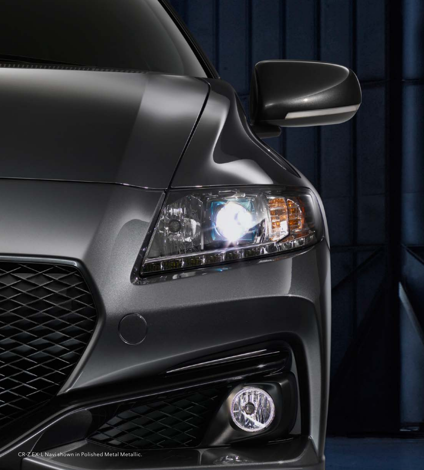
CR-Z EX-L Navi shown in Polished Metal Metallic.