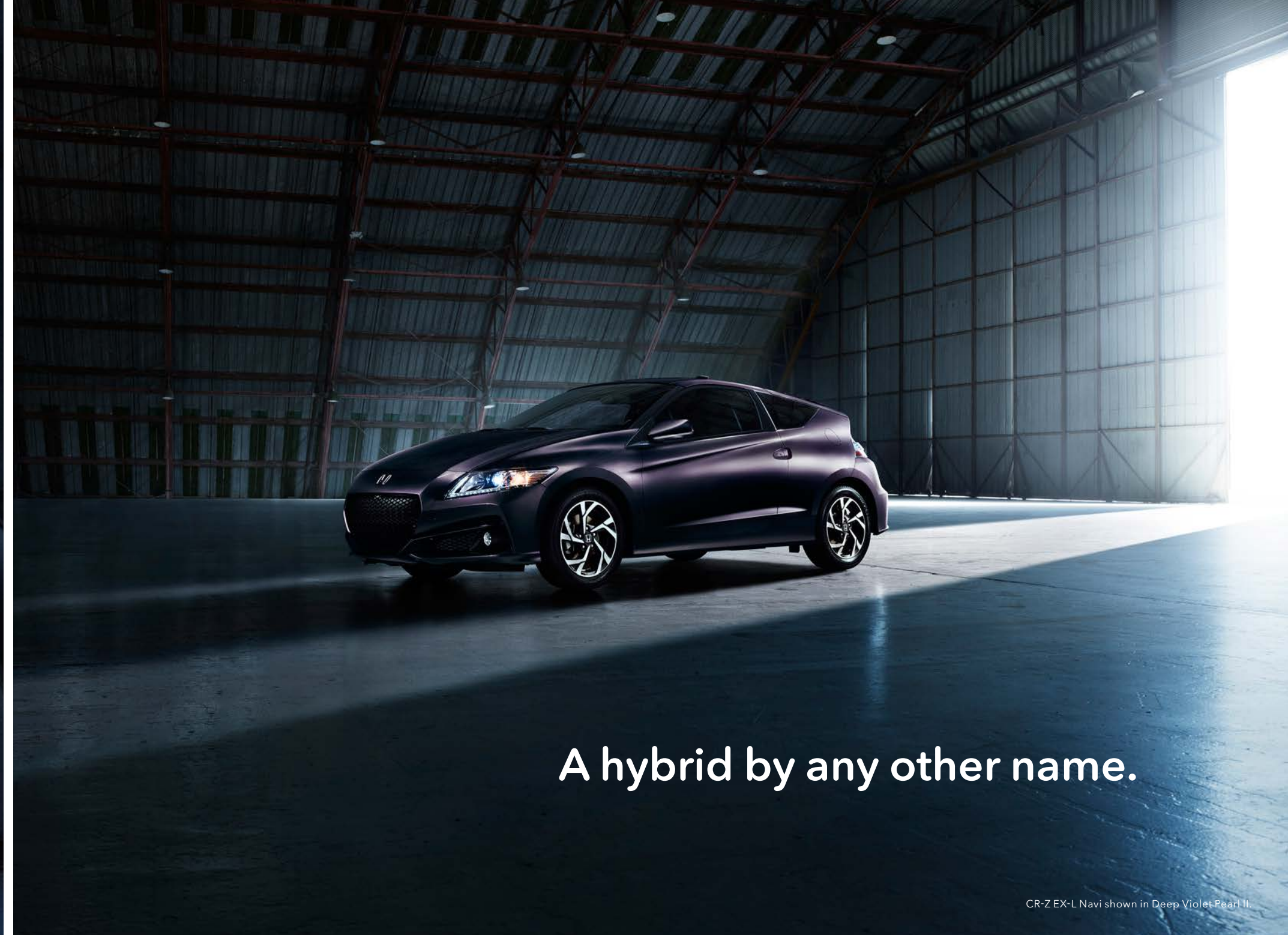
CR-Z EX-L Navi shown in Deep Violet Pearl II.