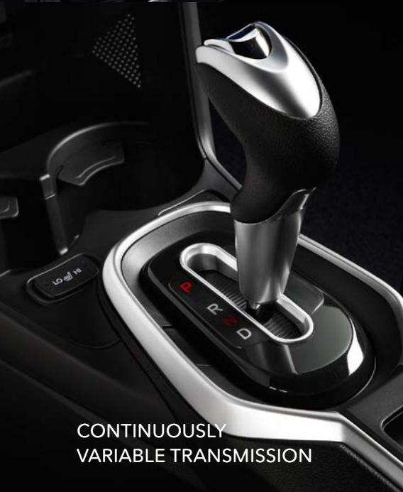
CONTINUOUSLY VARIABLE TRANSMISSION