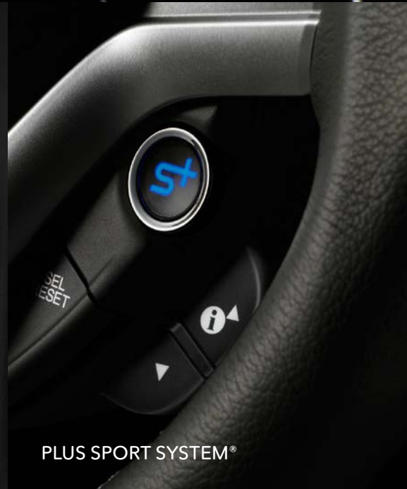
PLUS SPORT SYSTEM®