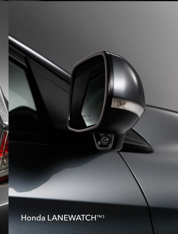
Honda LANEWATCH™ 3

Honda reminds you to properly secure cargo items.