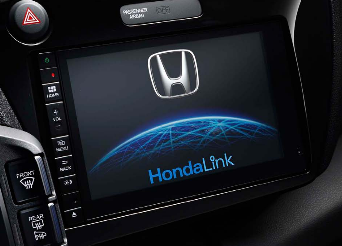
HondaLINK®1 NEXT GENERATION