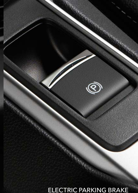
ELECTRIC PARKING BRAKE