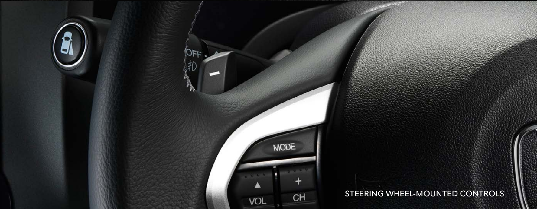
STEERING WHEEL-MOUNTED CONTROLS