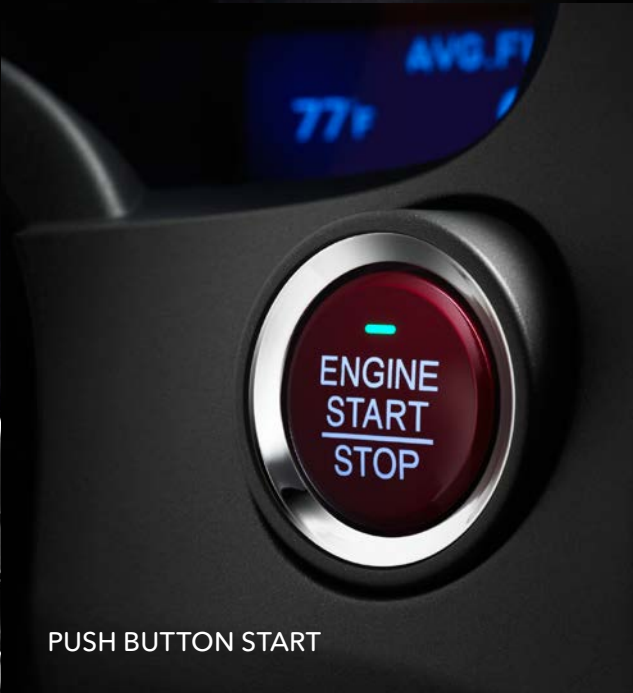
PUSH BUTTON START