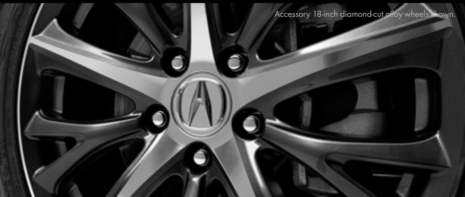
Accessory 18-inch diamond-cut alloy wheels shown.

The redesigned ILX comes with standard Jewel Eye LED headlights and LED taillights—an aggressive style to match the confidence you feel behind the wheel.