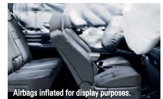
Airbags inflated for display purposes.

The Ridgeline's first line of defense is a reinforced unit body that incorporates a closed-box frame with internal high-strength steel frame stiffeners. Both the frame rails and all seven crossmembers feature box-section construction. The result is a remarkably high torsional rigidity.