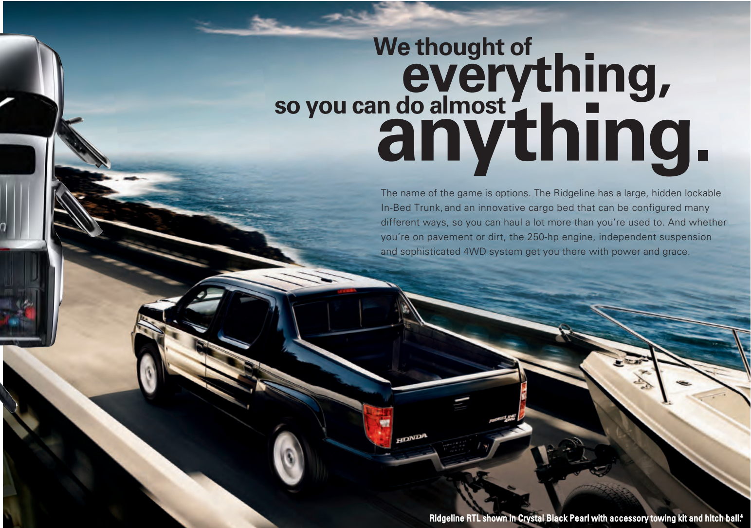
Ridgeline RTL shown in Crystal Black Pearl with accessory towing kit and hitch ball.*

Honda reminds you to properly secure items stored in the cargo area.