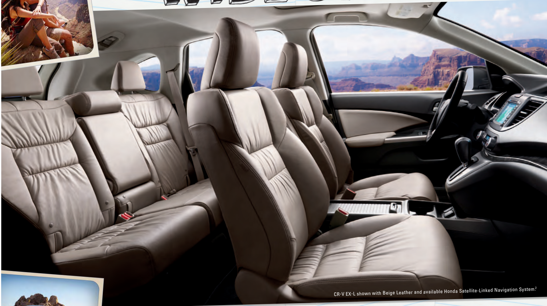
CR-V EX-L shown with Beige Leather and available Honda Satellite-Linked Navigation System. 2