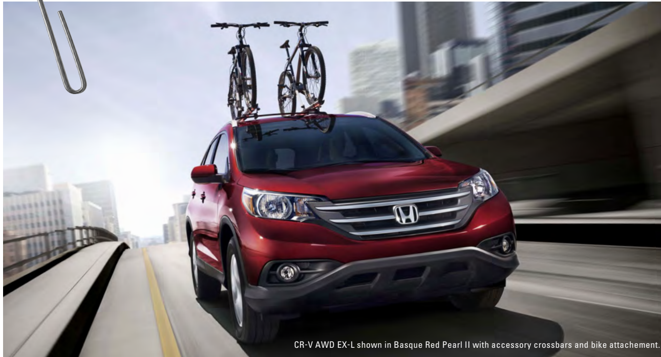
CR-V AWD EX-L shown in Basque Red Pearl II with accessory crossbars and bike attachment.

All 2013 Honda vehicles – and any Honda Genuine Accessories installed at the time of vehicle purchase – are covered by a 3-year/36,000-mile limited warranty. 13 Plus, Honda cars and trucks are covered by a 5-year/60,000-mile Limited Powertrain Warranty, 13 too. For more information or assistance, see your Honda dealer or please give us a call at 1-800-33-Honda.