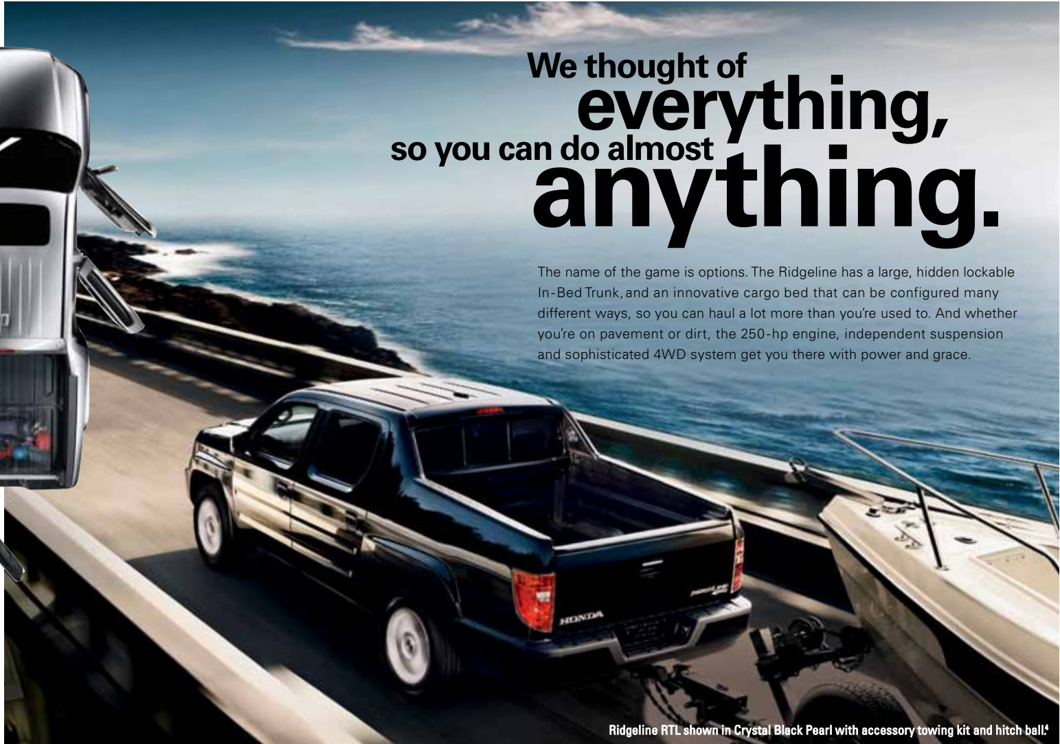
Ridgeline RTL shown in Crystal Black Pearl with accessory towing kit and hitch ball.*

Honda reminds you to properly secure items stored in the cargo area.