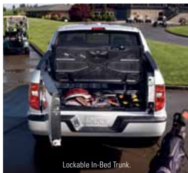
Lockable In-Bed Trunk.