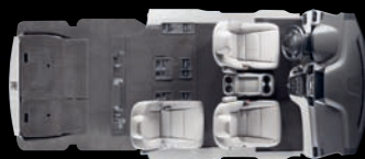
3-passenger cargo mode

The incredibly versatile interior easily adjusts to meet your needs.