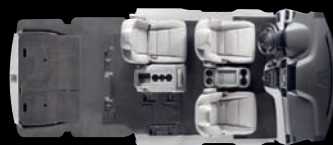
3-passenger cargo mode 2*

With 3 passengers, there's still plenty of room for a surfboard or ladder.