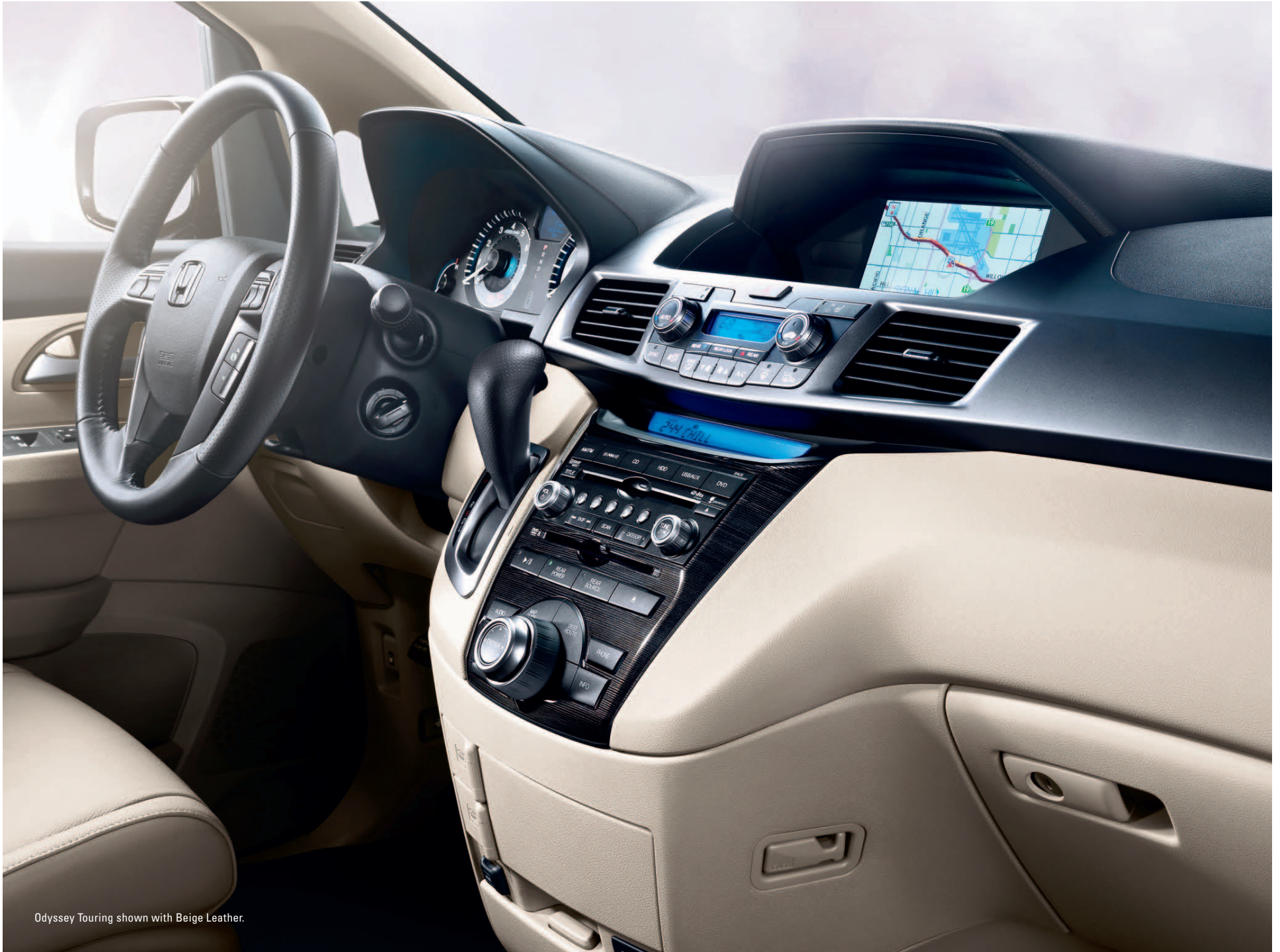
Odyssey Touring shown with Beige Leather.