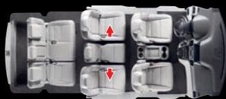
2nd-row "wide mode"

More space for passengers, or more room for 2 child seats in the 2nd row.