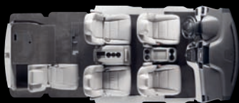
5-passenger cargo mode*

5 passengers and still plenty of cargo space.