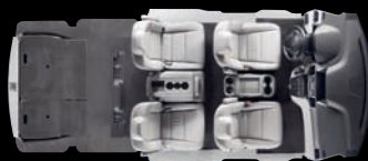
4-passenger cargo mode*

Party of 4? Stow the 3rd row for more cargo space.