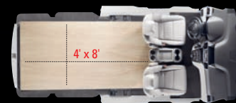
2-passenger cargo mode

4' x 8' sheets of plywood are a breeze to transport.