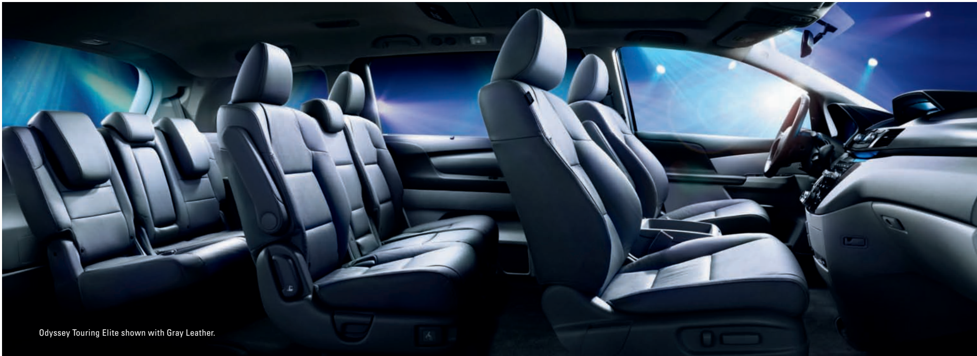
Odyssey Touring Elite shown with Gray Leather.