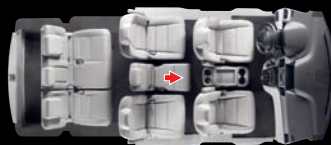
Multi-function center seat slides forward*

Quite possibly the perfect combination of cargo and passenger space.