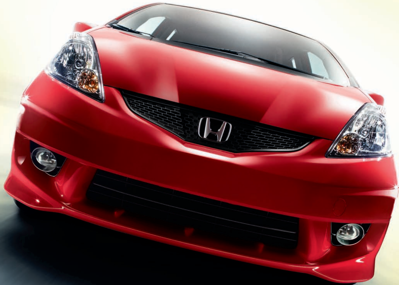
Fit Sport shown in Milano Red.

Every Honda is a smart value thanks to timeless design, great reliability and extended maintenance intervals. Check out our Best Overall Brand Award and Best Resale Value Awards 6 from Kelley Blue Book's kbb.com, Best Overall Value awards from IntelliChoice 67 and – for our sixth year in a row – Industry Best Residual Value Award from Automotive Lease Guide . 8