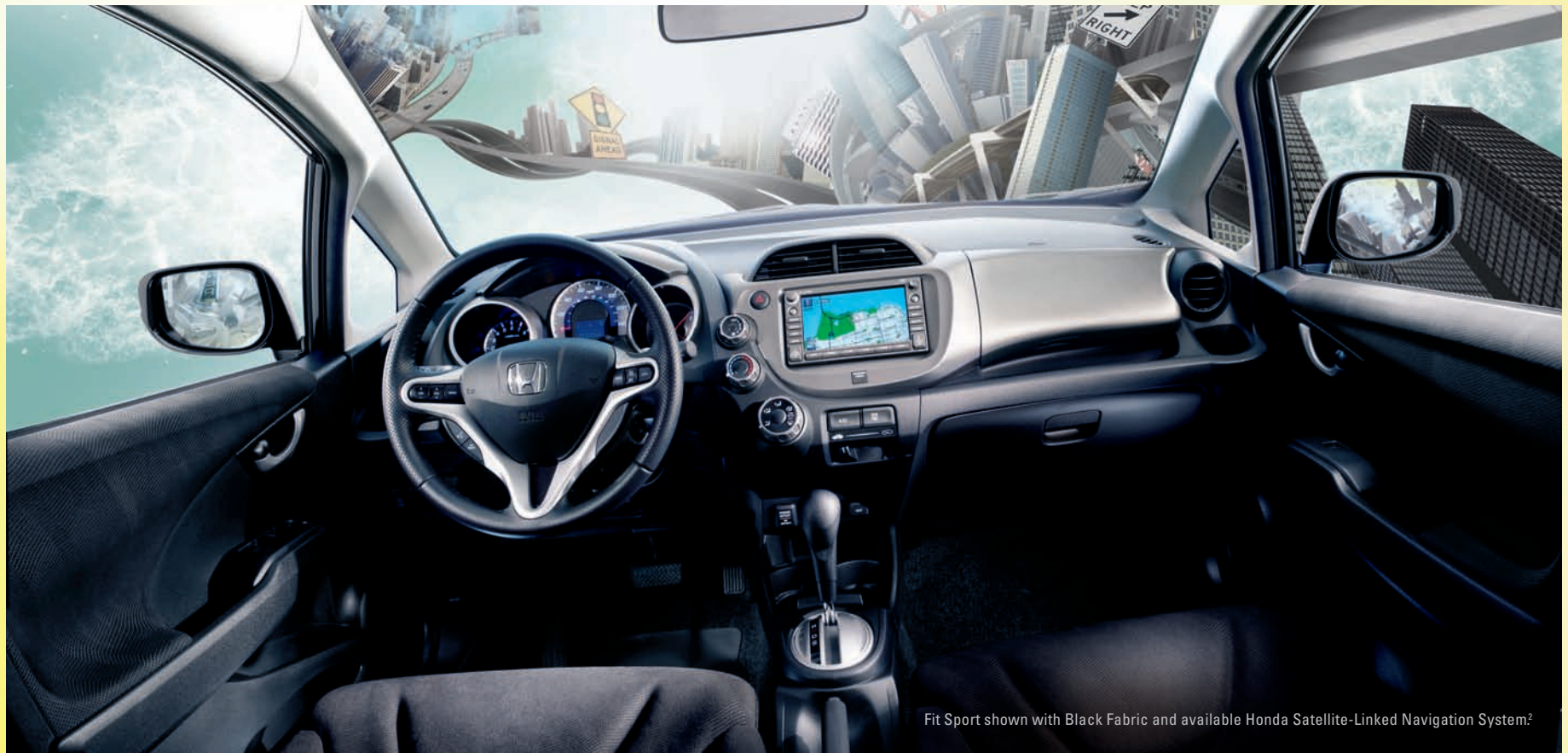
Fit Sport shown with Black Fabric and available Honda Satellite-Linked Navigation System. 2

Power windows, mirrors and door locks may be unexpected. Supportive seats may be uncommon. But a tilt and telescopic steering column? Here, it's all about adjusting to you.