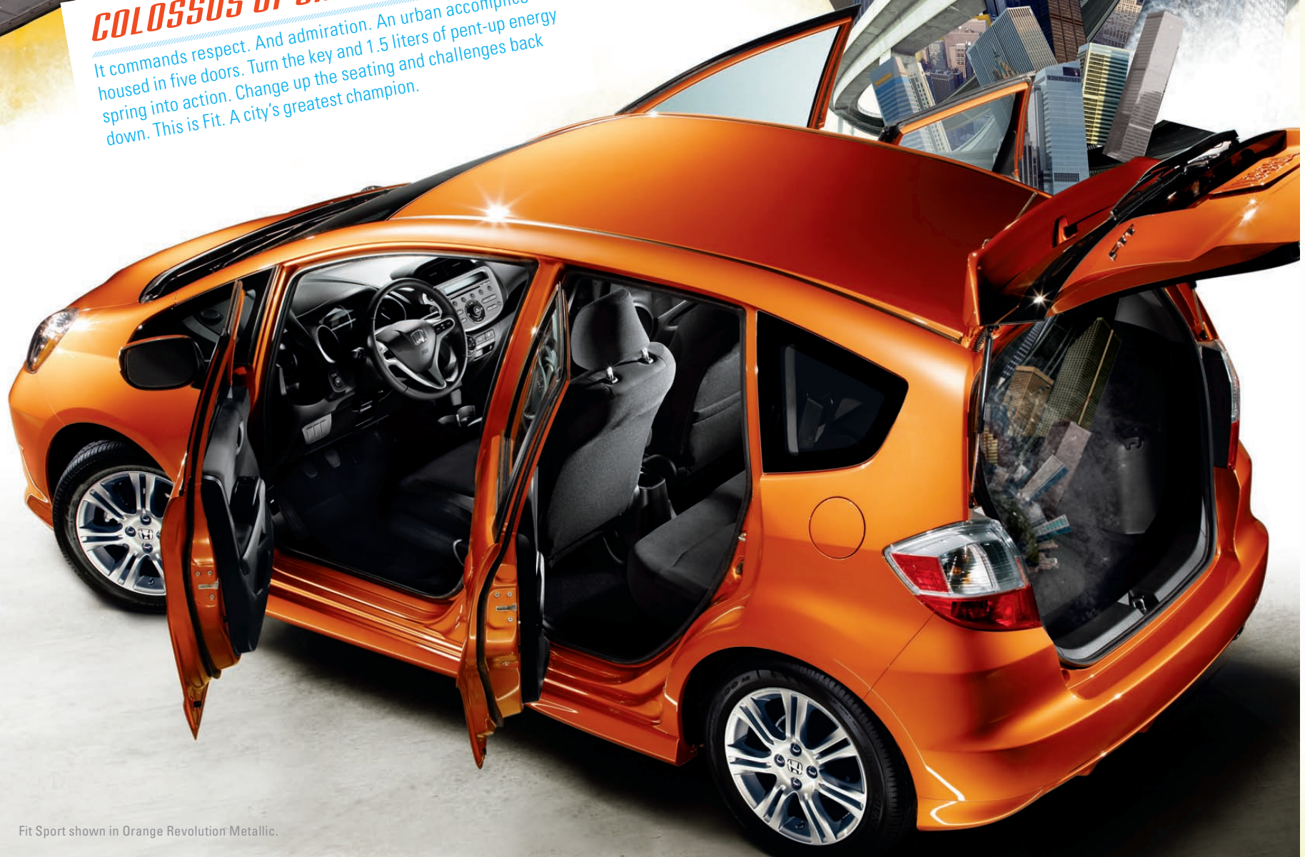
Fit Sport shown in Orange Revolution Metallic.

It commands respect. And admiration. An urban accomplice housed in five doors. Turn the key and 1.5 liters of pent-up energy spring into action. Change up the seating and challenges back down. This is Fit. A city's greatest champion.