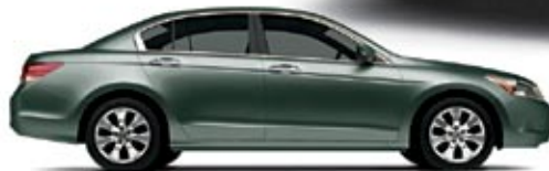
Mystic Green Metallic