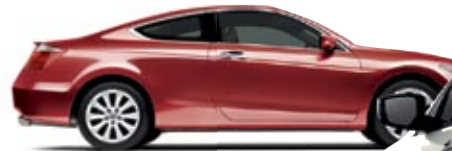
San Marino Red