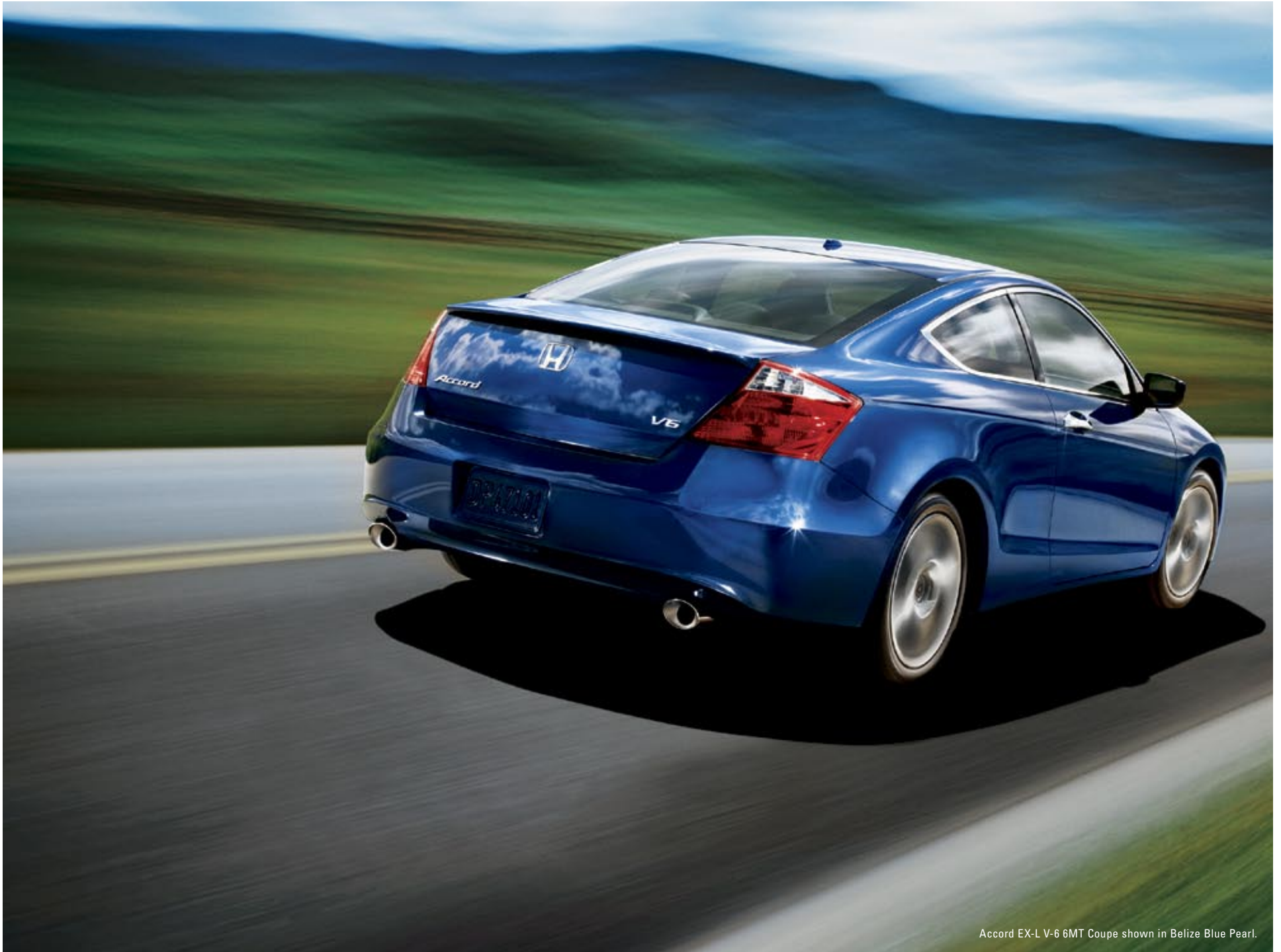
Accord EX-L V-6 6MT Coupe shown in Belize Blue Pearl.