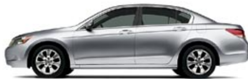
Alabaster Silver Metallic