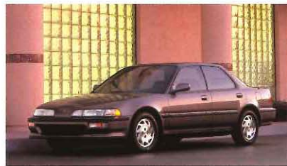
The Acura Integra 4-door GS in Rosewood Brown Metallic.