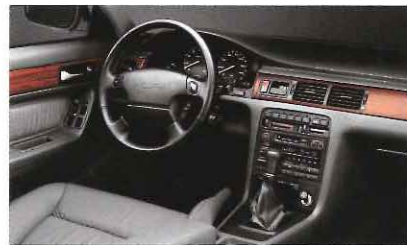
The ergonomically engineered cockpit is trimmed with warm wood accents and, in GS models, soft, supple leather.

Every Vigor is equipped with a Supplemental Restraint System (SRS) driver's side air bag, air conditioning, power windows, power door locks, cruise control, wood-trim accents, and a powerful 8-speaker AM/FM stereo/cassette music system. A luxurious, leather-trimmed interior, a power-operated moonroof and an innovative Digital Signal Processor (DSP) sound system, which electronically emulates any one of six distinct listening environments, are included in the Vigor GS model.