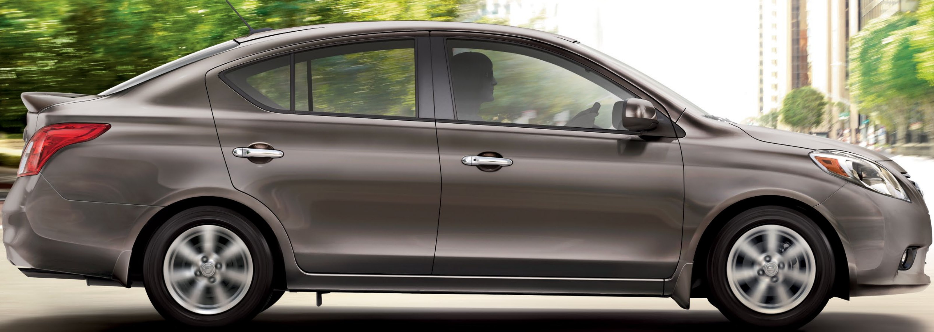
Nissan Versa 1.6 SL Sedan shown in Titanium with optional equipment.

THE FEELING OF ARRIVING AS SOON AS YOU TURN THE KEY.