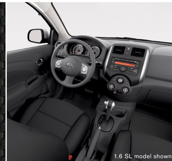
1.6 SL model shown.