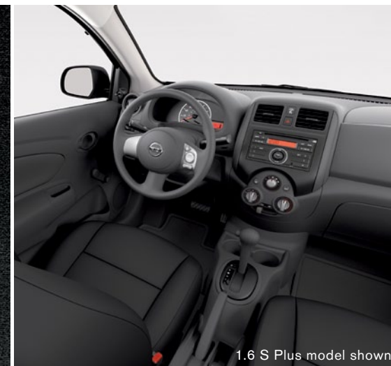
1.6 S Plus model shown.