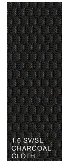
1.6 SV/SL CHARCOAL CLOTH