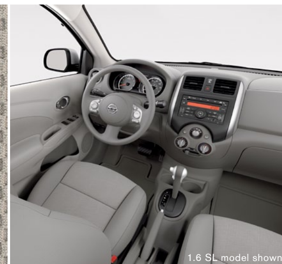
1.6 SL model shown.