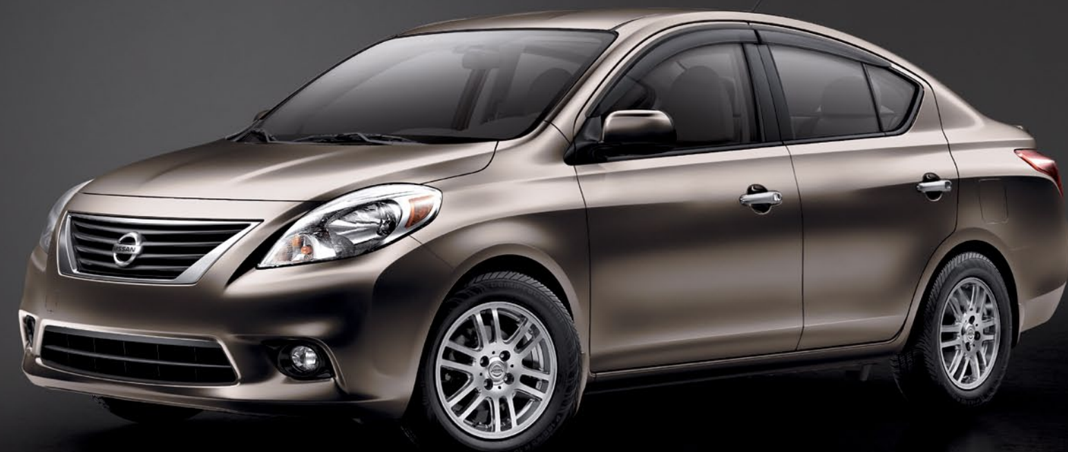
Nissan Versa 1.6 SV Sedan shown with 15" 6-spoke Aluminum-alloy Wheels, Fog Lights, Splash Guards and Side-window Deflectors.

For more information and to shop online for Genuine Nissan Accessories, go to Parts.NissanUSA.com .