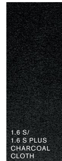
1.6 S/ 1.6 S PLUS CHARCOAL CLOTH