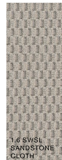
1.6 SV/SL SANDSTONE CLOTH