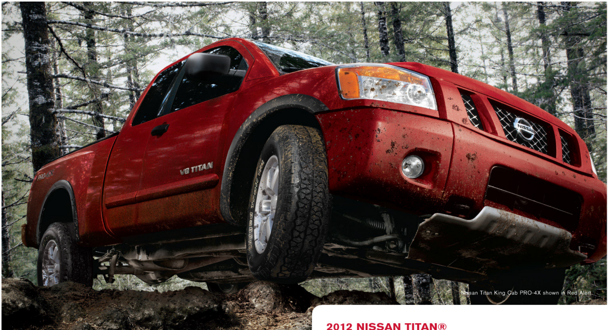
Nissan Titan King Cab PRO-4X shown in Red Alert.