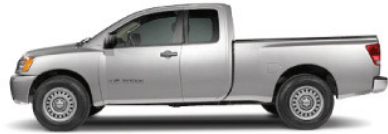
S KING CAB AND CREW CAB