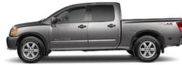
PRO-4X KING CAB AND CREW CAB