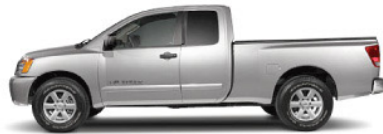
SV KING CAB AND CREW CAB