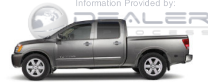
SL CREW CAB